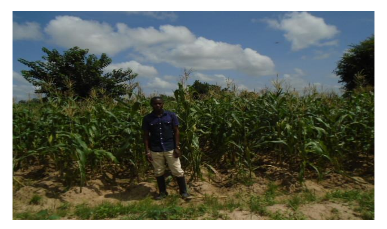
Figure 2: Earth bunding