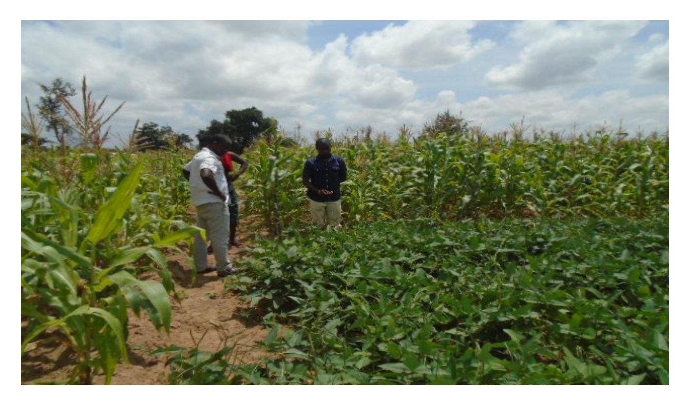
Figure 3: Crop rotation between maize and cowpea