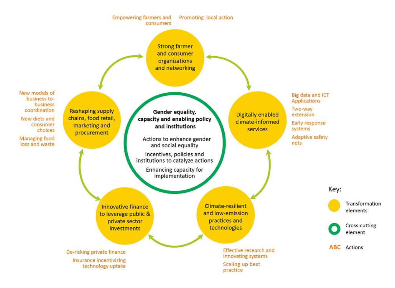
Figure 1. Transforming food systems under a changing climate: a six-part action plan