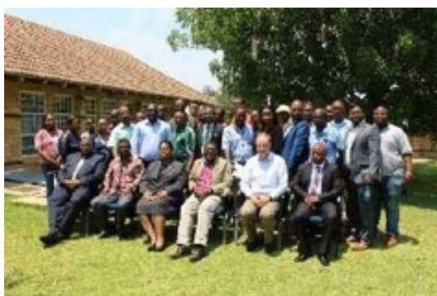
Picture 7: Farmers and SWADE personnel at the SwaziBeef closeout workshop

As a form of instruction, an analysis was done on each and every sale to conclude whether or not it was a solid deal. In time, and with perseverance on the part of the team, farmers gradually came around to the new way of thinking and began to show signs of adopting good business practices and dealings.