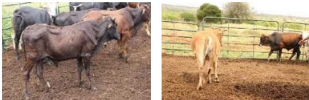
Picture 6: Feedlot animals from Nxusamlo farmer company

Before slaughter, all animals were inspected by the Department of Agriculture and the carcasses inspected for human consumption by the Ministry of Health. After completing training, not one of the farmers' animals failed the health test. Depending on the disease found, carcasses which failed the test would either be condemned, or farmers were paid amounts below break-even points. Skills acquired from this program were applied to the treatment of other animal species kept by individual farmers in their respective homesteads.