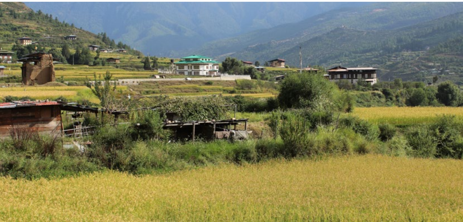
Photo: Improved rice varieties in the Paro valley, Bhutan.

contact the national focal point designated to deal with applicants and rely on the guidance provided by this person.