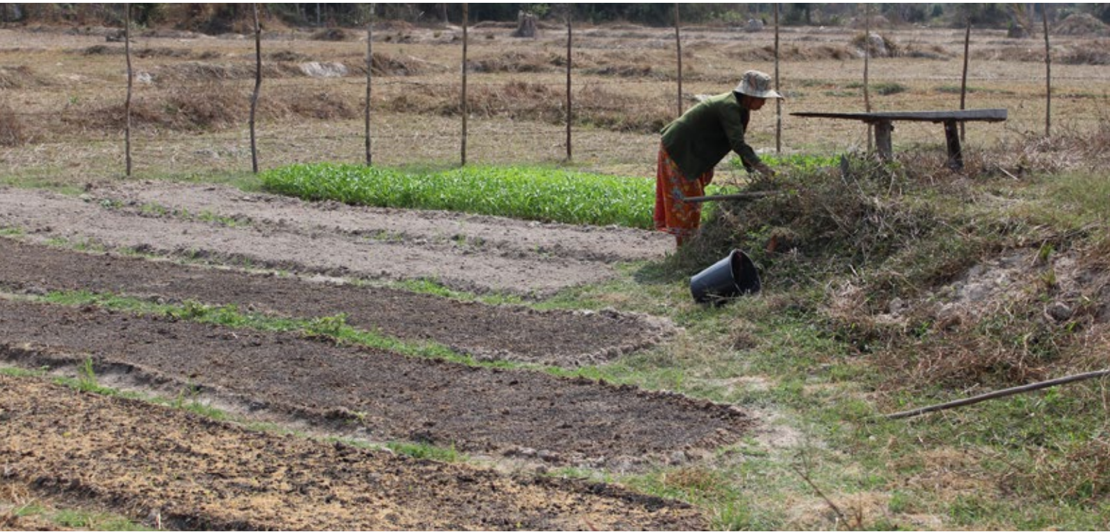
Photo: Farmers testing vegetable production under dryer conditions, Lao PDR

only qualitative location information. However, methods are available to determine geographic coordinates from secondary sources that are precise or nearly so.