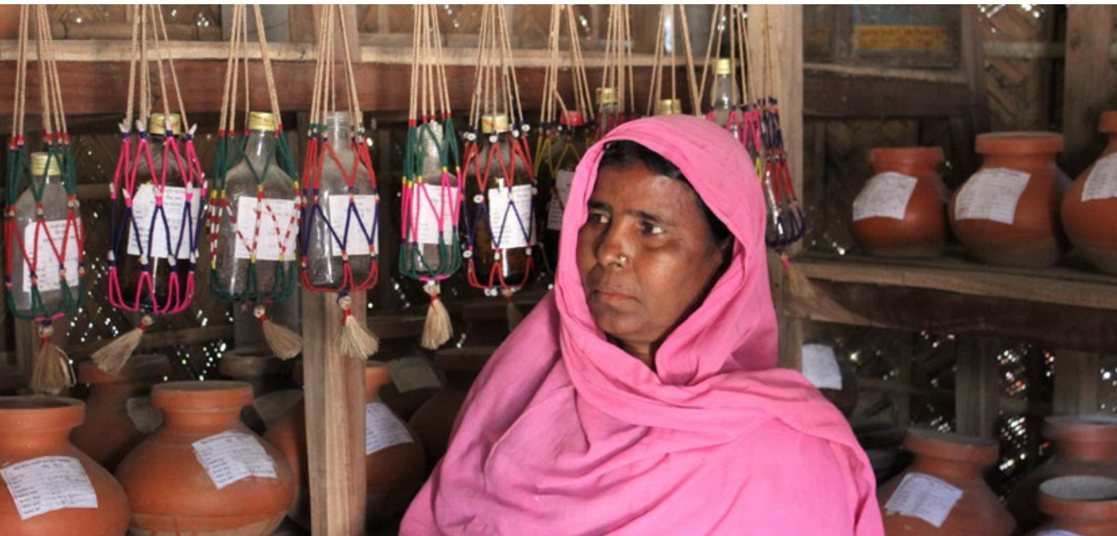
Photo: Hazaripara Community Seed Wealth Centre, Ishwardi, Pabna, Bangladesh.