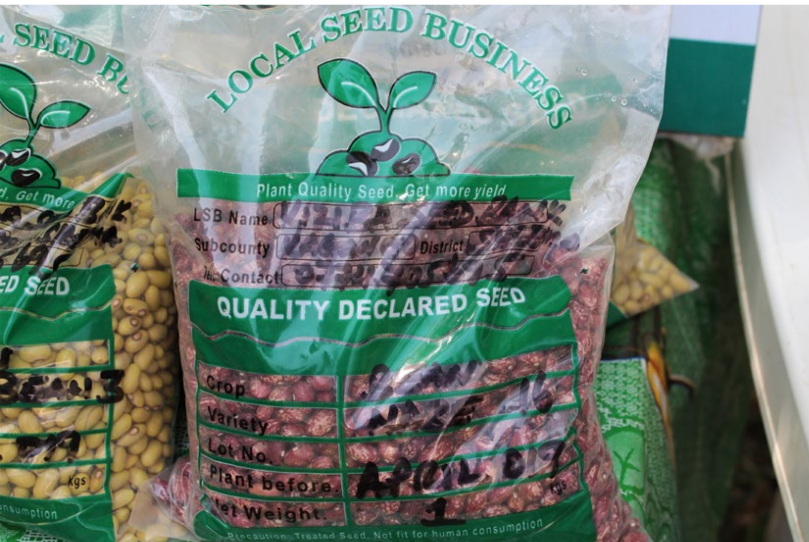
Photo: Quality Declared Seed: beans (Uganda).

The conditions for this are 1) only if there is a shortage of seed of a particular crop within the country, 2) only seed of known crop varieties can be distributed, 3) the seed can only be sold as “Standard Graded Seed” (which will affect the price).