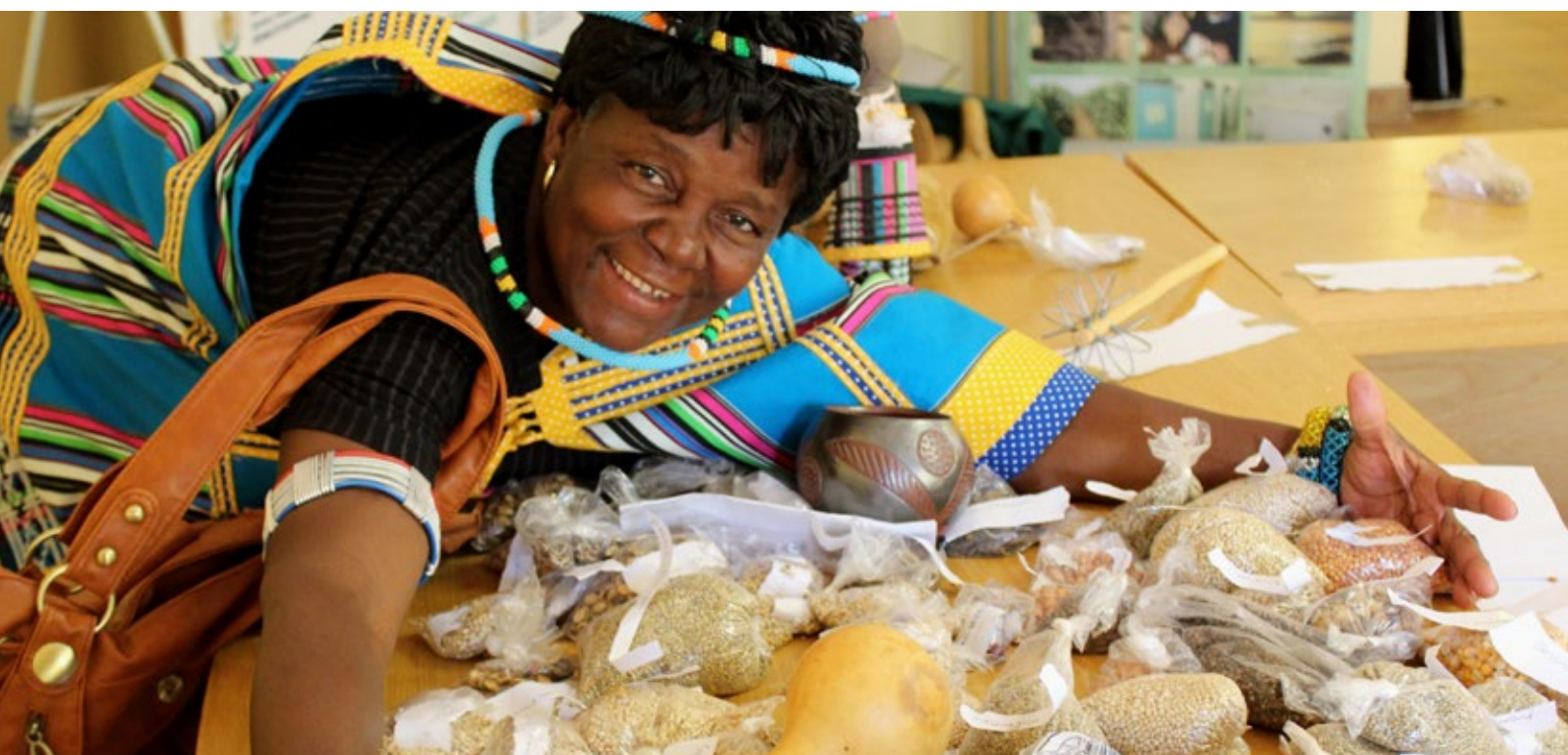
Photo: Diversity fair, South Africa.

Community seed banks (see section 3), a collective form of crop conservation, occupy an intermediate position between these two approaches. Farmers have a very strong say in most community seed banks.