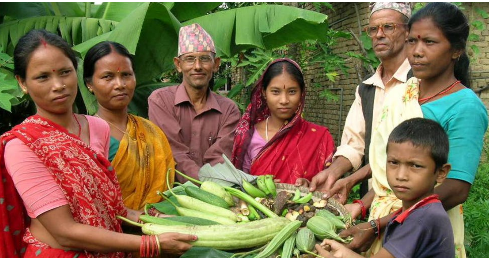
Photo: Farmers and gourd diversity, Nepal.

Climate change has begun to put additional pressure on farmers' seed and food production systems and on the multiple functions that they fulfill. Although, in many areas, farmers continue to maintain crop diversity, a significant reduction in the number of crops as well as area planted is occurring. Findings from the field point to a decline in diversity of local varieties in many countries. Future impacts of climate change are expected to become more pronounced in many parts of the world, forcing farmers to change their practices and causing them to search for information about crops and varieties better adapted to new weather dynamics.