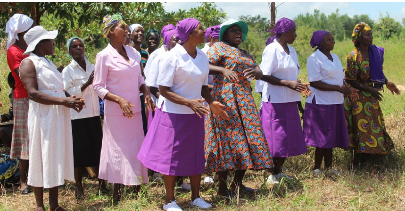
Photo: Sharing local knowledge through dance and songs, Zimbabwe.