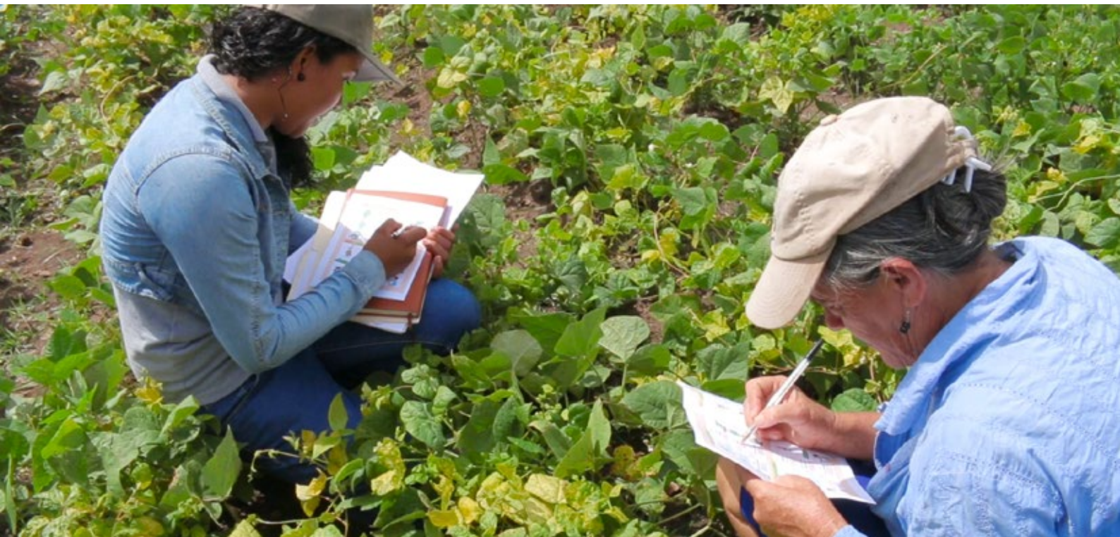
Photo: Evaluating bean varieties, Honduras. Credit: Bioversity International

many farmers at all stages, provided that some technical and financial support is available over several years of experimentation.