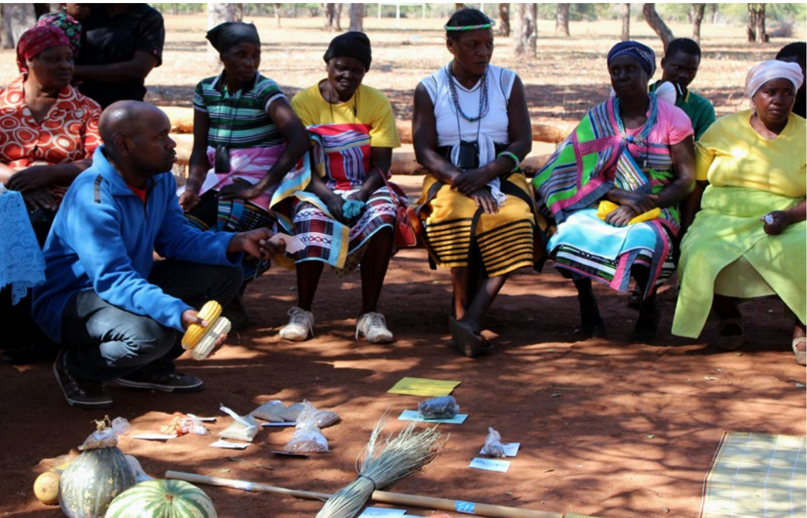
Photo: Four-cell analysis with farmers, South Africa Credit: Bioversity International/R. Vernooy