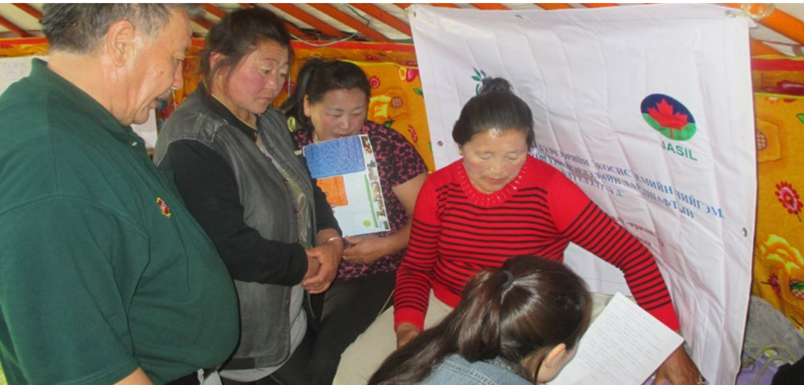
Photo: Group work to evaluate research results, Mongolia.