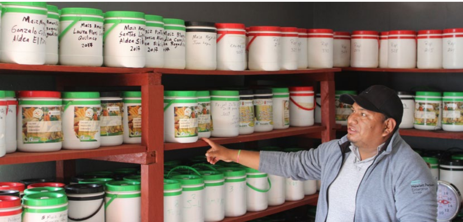
Photo: Local maize diversity in a community seedbank, the Cuchumatanes, Guatemala.