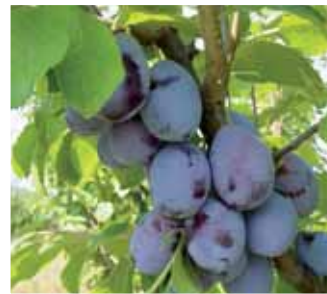
Stanley plum variety.

Presently, the fruit germplasm fund held in various collections includes biological material from 11 fruit genera and species ( Amygdalus : 128 accessions; Armeniaca : 663; Castanea : 42; Cerasus sativa : 461; Cerasus vulgaris : 160; Cydonia oblonga : 73; Juglans sp.: 222; Malus : 872; Persica vulgaris : 1075; Prunus sp.: 812; and Pyrus : 536), 11 small fruits and strawberry ( Cornus mas : 29; Corylus avellana : 47; Hippophae : 11; Ribes grossularia : 195; Ribes sp.: 25; Rosa sp.: 5; Rubus sp.: 36;