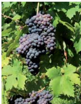
"Primitivo" from old vineyards near Heidelberg.