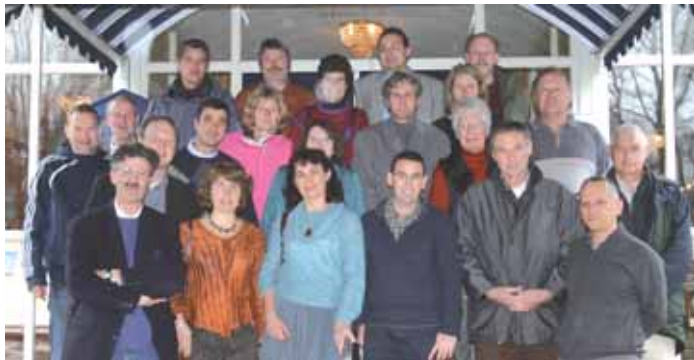
Group photo of the participants of the start-up meeting of the GENRES Leafy Vegetable project in Wageningen (February 2007).

For further information, please contact Chris Kik (Email: chris.kik@wur.nl ) or visit: http://documents.plant.wur.nl/cgn/pgr/leafyveg/default.htm