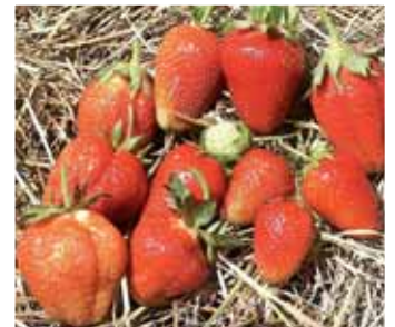
Strawberry - Floral.

The fruit collections are reorganized periodically. The