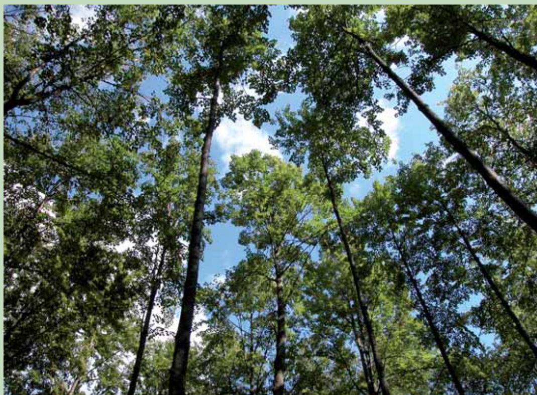
A gene reserve forest of small-leaved lime (Tilia cordata).