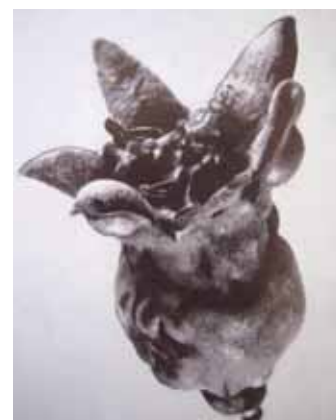
Pomegranate flower from the excavations of fortress Karmir-Blur (near Yerevan), VII BC.

The breeding of pomegranates in ancient times could only be carried out by selection and intraspecific hybridization. These methods continue to be the major ones used nowadays. It is for this reason that it is so important to study intra-species diversity of the pomegranate to discover features valuable for selection. However, populations of wild pomegranate are of significant interest, not only as possible donors of valuable genes. As early as half a century ago, A. Ivanova (1950) noted that minimal geotechnical care of wild-growing bushes would broaden the use of wild pomegranate fruits (of which the citric acid content exceeds that of lemon juice). It would also allow the use of wild pomegranate bushes for irrigation-free field-protecting