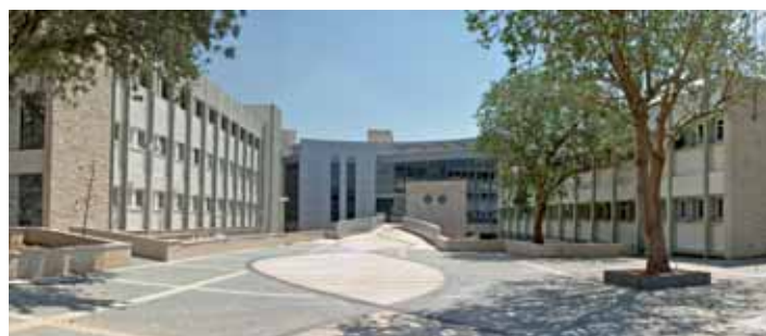
The new IGB facilities, Bet Dagan, Israel.

centres such as the Millennium Seed-Bank Project, CGIAR and others. More information on the IGB, its activities and query of IGB database can be found at http://igb.agri.gov.il/