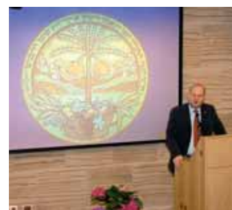
Emile Frison, DG of Bioversity International making a presentation at the IGB inauguration ceremony.

IGB is equipped with state of the art conservation facilities and research laboratories. The short and long-term conservation facilities plan to encompass the rich biodiversity of the Israeli flora, including its genetic diversity. Conservation efforts are carried out in collaboration with local and international research institutes and conservation