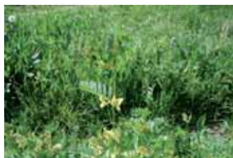
Top: urban large-flowered vetch; right: urban narrow-leaved vetch, both found growing amid the buildings in the city of Novi Sad.