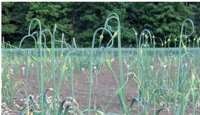
Garlic plants growing in the field.

The project is highly integrative and needs the close collaboration of the partners from Germany, Czech Republic, France, Italy, the Netherlands, Poland and the Nordic Gene Bank. The meeting was conducted in a very open atmosphere, characterized by vivid discussion around nine main talks covering all aspects of the project. Interesting laboratory and field visits rounded it off. More information is on the EURALLIVEG Web site: http://euralliveg.ipk-gatersleben.de/