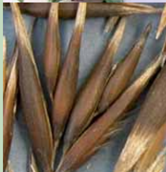
Top: Brassica; bottom: Avena sativa; and right: Shallots, all species covered by the AEGIS project.