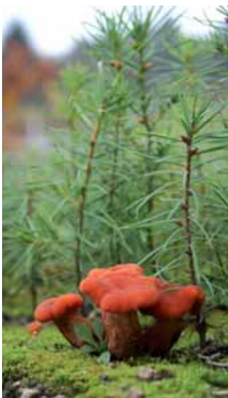
Fruiting body of the mycorrhizal fungus Laccaria bicolor in association with seedlings of Douglas fir.

Finally, proposals for integrated research projects contributing to the research on ecosystem genomics were generated; a mobility plan was developed; different technical and scientific workshops were organized and public awareness materials were prepared to disseminate the outputs of the project.