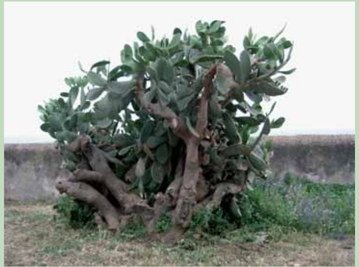
A prickly pear-tree (Opuntia ficus indica) in Central Italy.

a self-funded project called EPGRIS3. The objective of this initiative is to coordinate ongoing, self-funded voluntary actions proposed by European partners for the improvement of a European Plant Genetic Resources Information Infrastructure.