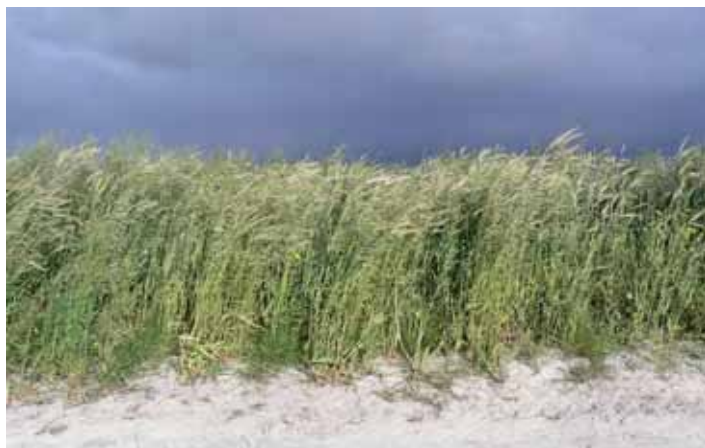
Avena strigosa and Secale cereale landraces on the Outer Hebrides, Scotland.

A continuing close collaboration between the EUCARPIA Genetic Resources Section and ECPGR may offer fertile ground to improve the link between conservation and use of plant genetic resources.