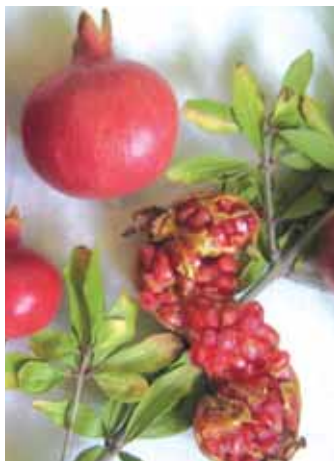
Wild pomegranate from southeast regions of Armenia.

However, until now, no measures have been undertaken to preserve wild pomegranate in situ . Carrying out periodic monitoring and gathering of seed material for conservation ex situ , in collections and genebanks, are recognized as important activities. These measures will allow Armenia to preserve this rare and relic fruit, valuable not only as the wild relative of a cultivated pomegranate, but also as a fruit holding a special place in human culture (religion, art, folk rites) in the broader sense.