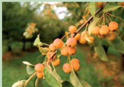
Malus baccata .