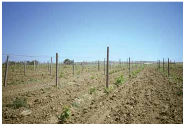
Establishment of a new grapevine collection at the experimental station in Absheron, Azerbaijan. Drought is a major challenge for agriculture in Central Asia.