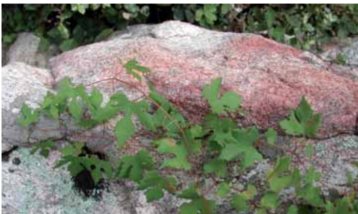
Wild Vitis sylvestris found in a forest in South France.

The first meeting of the project at INRA Versailles, France on 21-23 March 2007, was attended by all participant organizations, a representative of the Directorate General for Agriculture of the European Union and by a representative of Biodiversity International. During the meeting, a number of important decisions were taken concerning the list of grapevine accessions to be studied under the different work packages, the methods to be adopted for molecular identification, morphological and agronomical characterization, as well as the on-farm, true-to-type and database work to be carried out over the next four years. Further details on the project and its participants can be found at: www.montpellier.inra.fr/grapegen06/