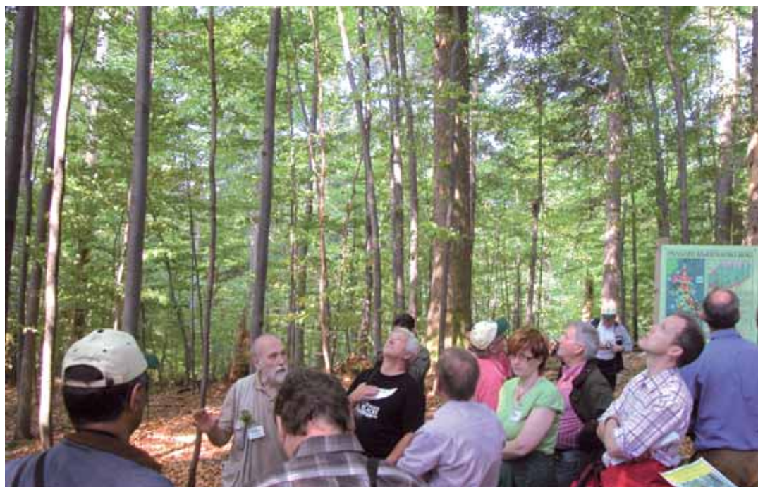
EUFORGEN Steering Committee visiting the Rajhevanavski Rog Forest Reserve, Slovenia.

National Coordinators and observers from 27 countries met in Novo mesto, Slovenia on 22–24 May 2007 for the mid-term review of Phase III of the European Forest Genetic Resources Programme (EUFORGEN). This was the fifth Steering Committee meeting since the inception of EUFORGEN in October 1994 and it was hosted by the Slovenian Forestry Institute.