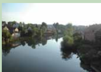
A view of the Krka River, Novo mesto, Slovenia.

The summary report of the meeting is available at the EUFORGEN Web site ( www.euforgen.org ).