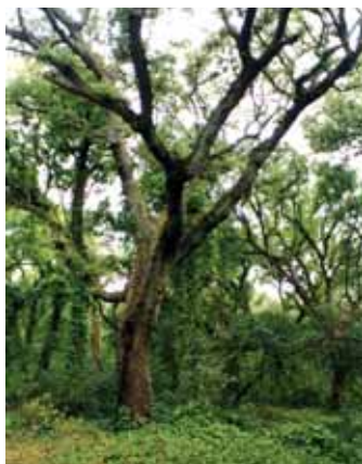
A natural cork oak stand in Portugal.

Oudara Souvannavong FONP - Forestry Policy and Institutions Service Food and Agriculture Organisation of the UN (FAO) Forestry Department Rome, Italy Email: Oudara.Souvannavong@fao.org