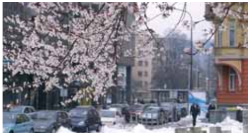
Prunus flowers blossom in a snowy spring in Ljubljana.