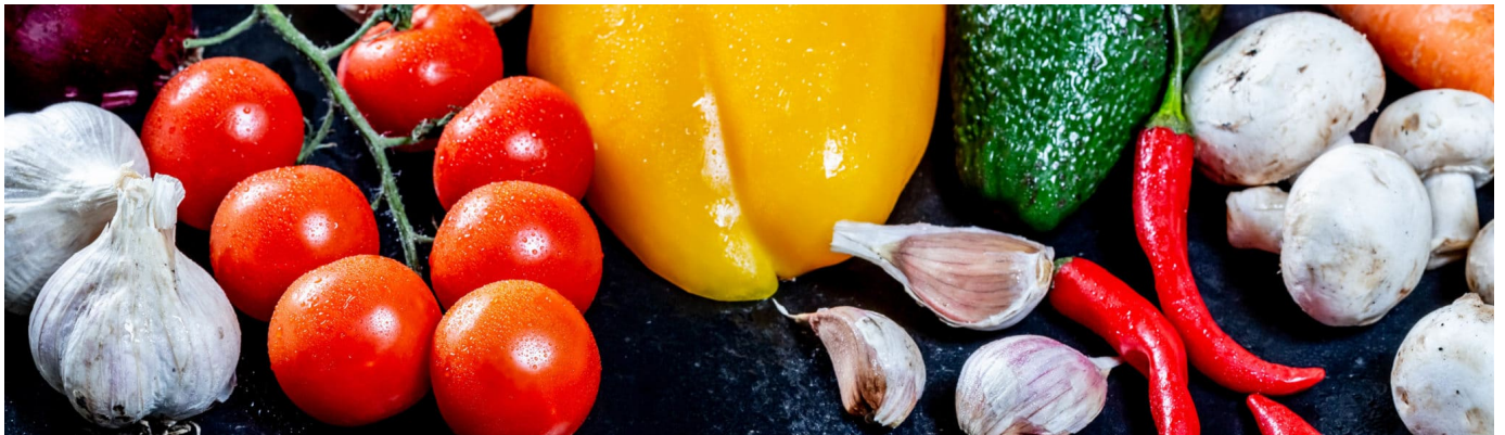
Concept of healthy food- fresh vegetables

Informal markets are one of the primary sources of food and nutrition for poor people throughout the developing world. Yet, for too long, these markets have been overlooked, underappreciated, and side-lined.