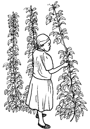
Gives stakes for supporting tomatoes and climbing beans