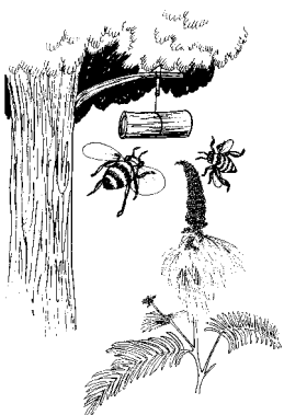
Provides forage for bees to make honey