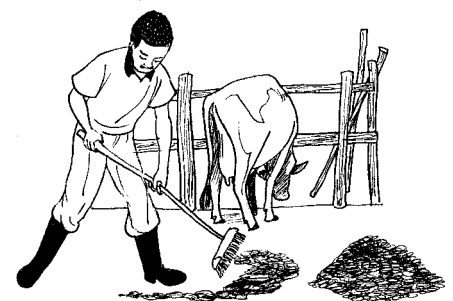
When eaten by livestock, they produce good manure.