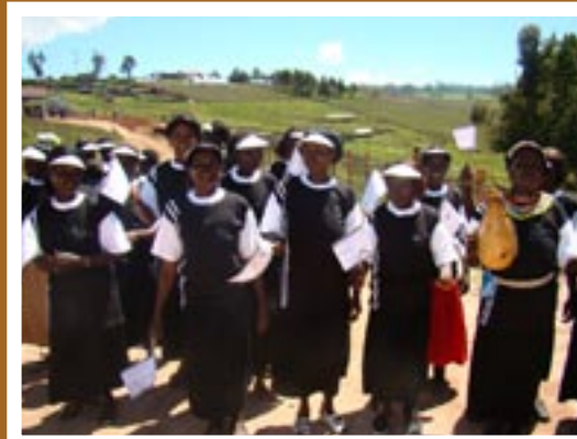
Women group waiting to receive chief guest