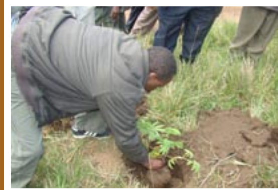
Tree planting: Minister for Livestock