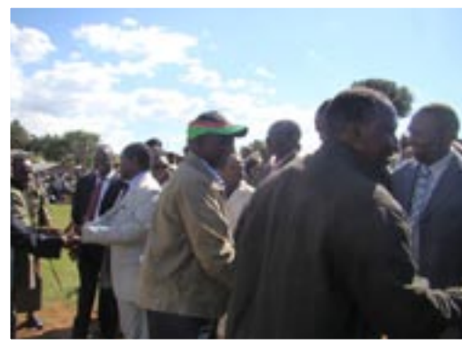
Greetings and introductions as women group welcomed the guests with traditional dance