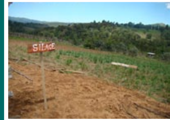
Demonstration plots/model farms were also set for farmers to be trained