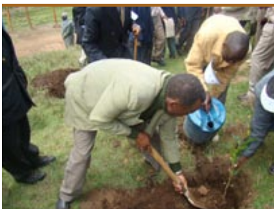
Tree planting: Area Member of Parliament, Sigor