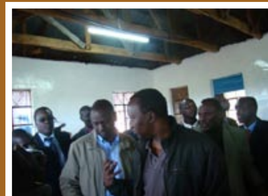
Then the guests toured the milk chilling plant, Lelan Highland Dairies Limited