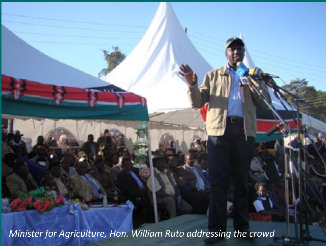
Minister for Agriculture, Hon. William Ruto addressing the crowd

Ruto discouraged the community from valuing their herds by merely counting the horns and legs. “The true value of your herds lies in the output of meat and milk.” Ruto says.