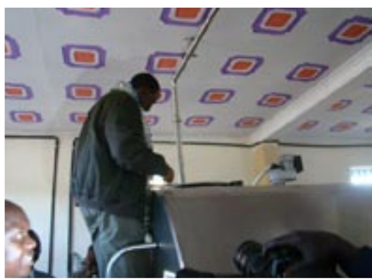
The Minister of Livestock takes a look into the Milk Chilling tank