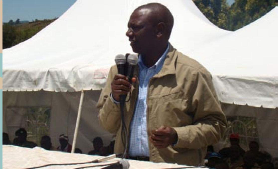
Minister for Agriculture addressing the crowd in Lelan

The launch of Lelan cooling plants is the onset of a vibrant hub of economic activities in the areas as spin-offs of the cooling plant activities spread to other agricultural and commercial ventures. During the launch milk collection was at 2,800kgs and increasing daily.