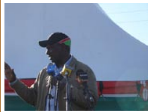
Minister for Africulture driving his point home