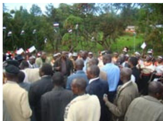
Guests being ushered with traditional song and dance