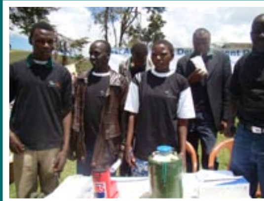
Artificial Insemination (AI) service providers were in attendance