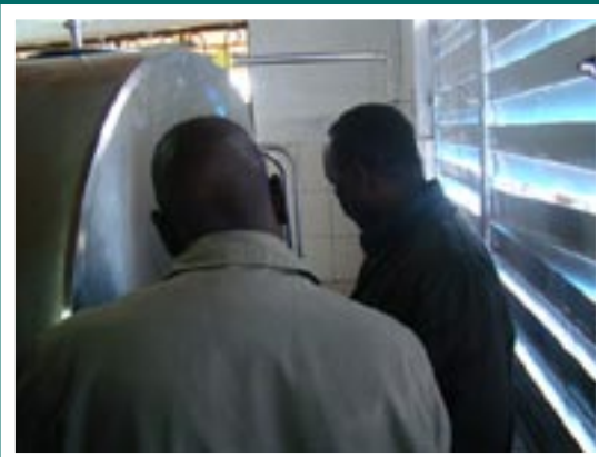
The Ministers' take a closer look at the milk chilling tank