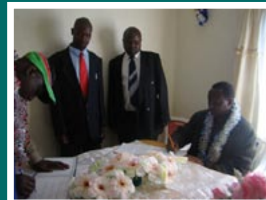
They paid a courtesy call at the offices of Kabiyet Dairies Company Limited where they signed the visitors book