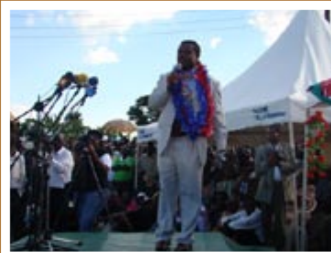
Local area Member of Parliament speaks to the masses