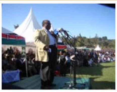
Chairman New KCC, the processors/buyers of raw chilled milk gives his speech