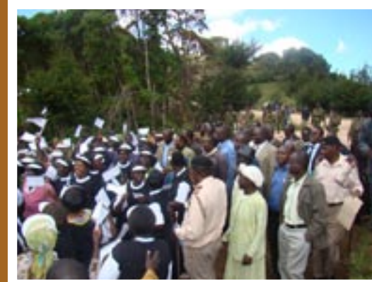
Women group ushering chief guest in song and dance