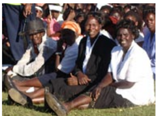
Women had turned up in large numbers