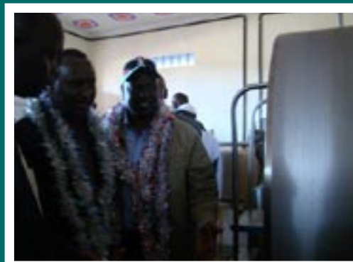
The Ministers' were taken through a tour of the plant