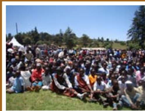
...and the masses listened keenly...