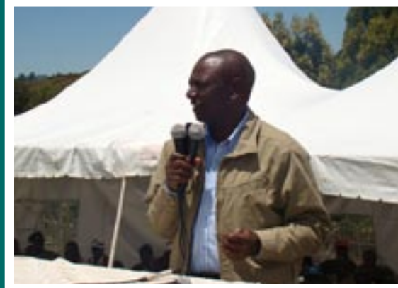
Minister for Agriculture gives his speech