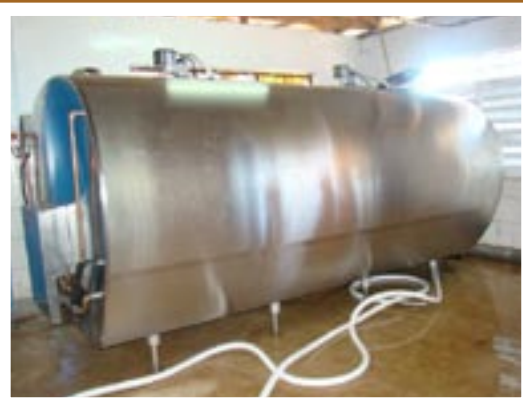
Milk chilling tank