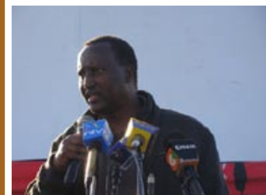
Minister for Livestock briefs farmers on new government policies in dairy