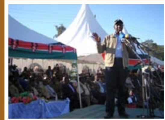
Minister for Agriculture advises residents of good dairy farming practises