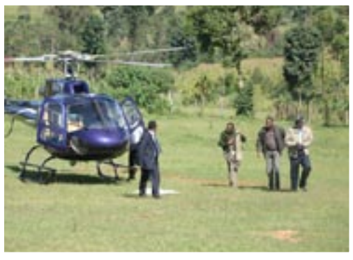
Arrival of Guest of honour