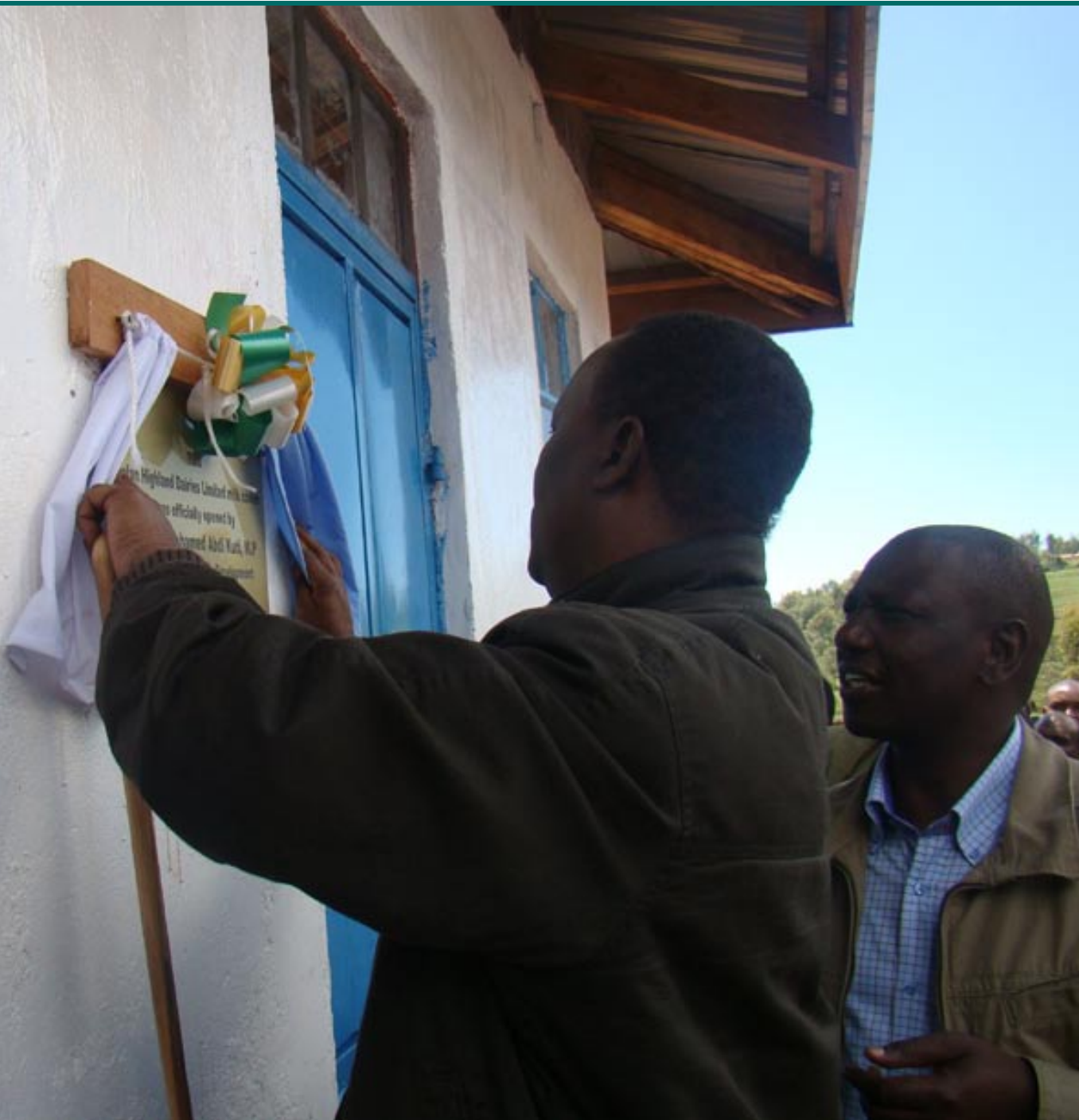
From left: Ministers' for Livestock (left) and Agriculture (right) unveil Lelan plaque

Speaking during the launch, the two ministers commended farmers of Lelan for rallying together and taking their own destiny into their hands by purchasing the chilling tank which will now provide ready market for their milk. The ministers especially challenged the farmers to work closely with EADD in improving the quality of their dairy cows through artificial insemination. Without enough milk to fill the tank, their business will be running at a loss hence plunging them into more poverty.