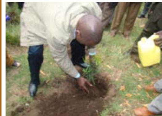
Tree planting: Minister for Agriculture