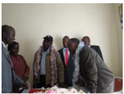
The Chairman (left) briefs the guests about the village bank which is under construction