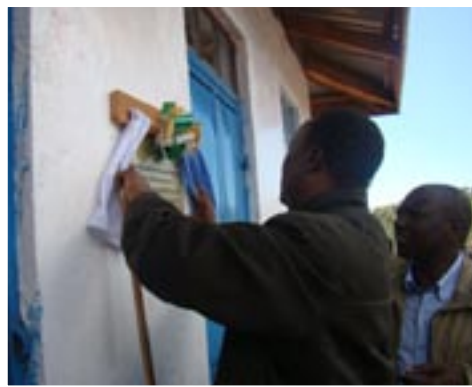
They finally unveiled the plaque...