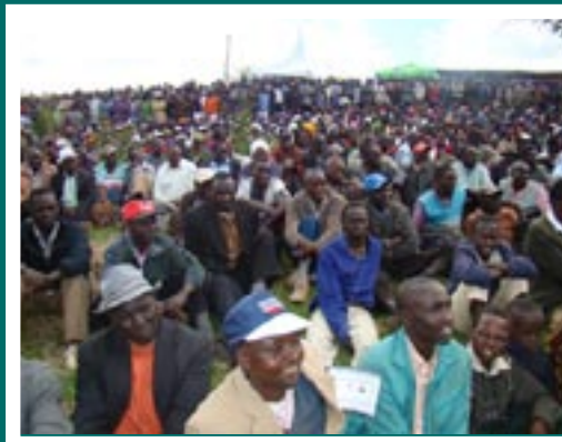
Residents had gathered in thousands to witness this great occasion