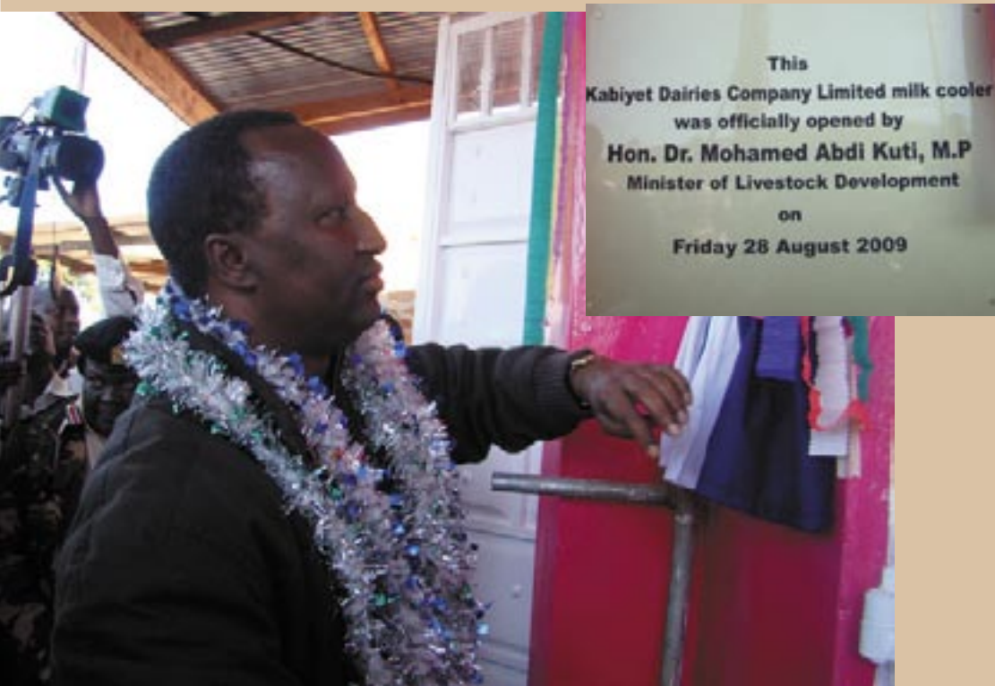
Minister for Livestock, Hon. Mohammed Abdi Kuti unveiling the plaque at Kibiyet Dairies Company Limited