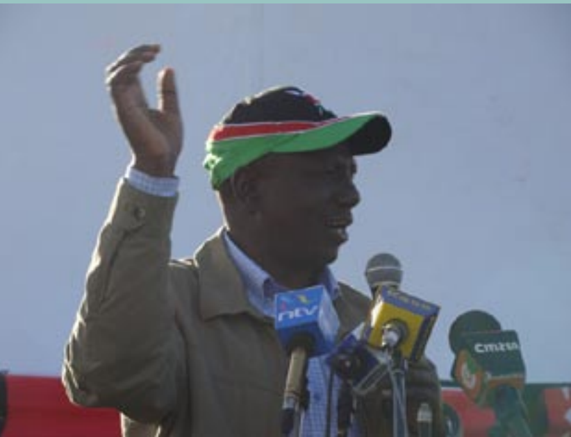
Minister for Agriculture, Hon. William Ruto

"If the price of water is around Kshs.80 per litre, how can a litre of milk cost Kshs. 20? Yet for milk to be found, the cow has to be well fed, use Artificial Insemination, salt lick, dairy meal, taken to the dip and also milked. Can all this work really cost Kshs. 20? Why should the price of water cost more than that of milk, yet milk is more nutritious?" asked Ruto. The Minister challenged Kenya Dairy Board to finding out the real cost of milk by calculating the cost of production to determine the price of milk per litre.