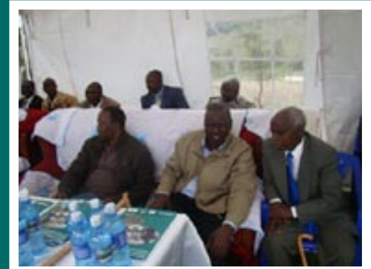
From the chilling plant to Murkokoi centre (venue the function) from Left: Minister for Livestock, Minister for Agriculture and Country Director, Heifer International