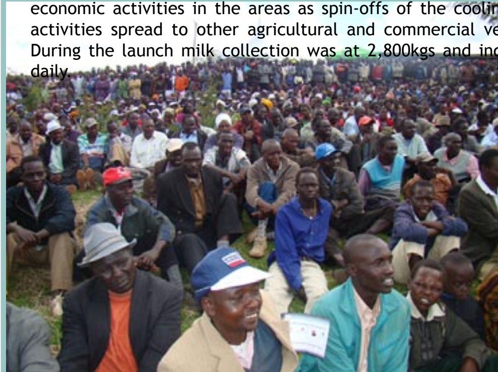
Part of the crowd in Lelan. Residents had gathered in thousands.