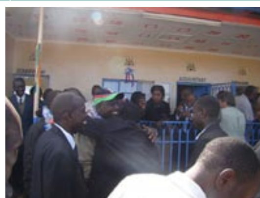
The guests exchanged pleasantries with local leaders and board members and thereafter embarked on their walk to the venue of the function