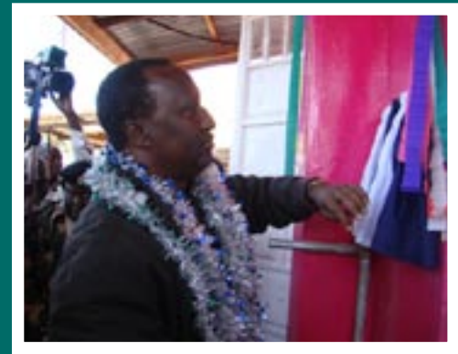
The Minister for Livestock unveiled the plaque at Kabiyet Dairies Company Limited