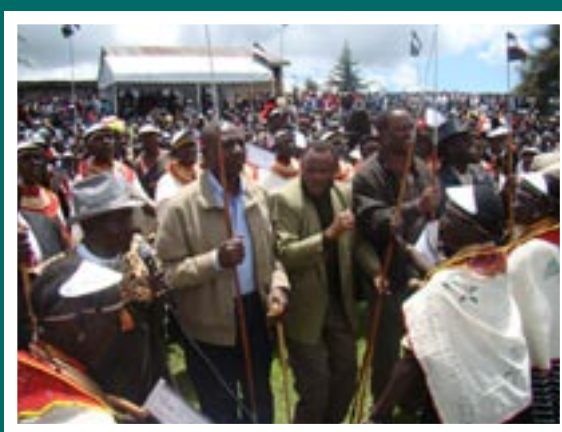
The traditional dances engaged the guests