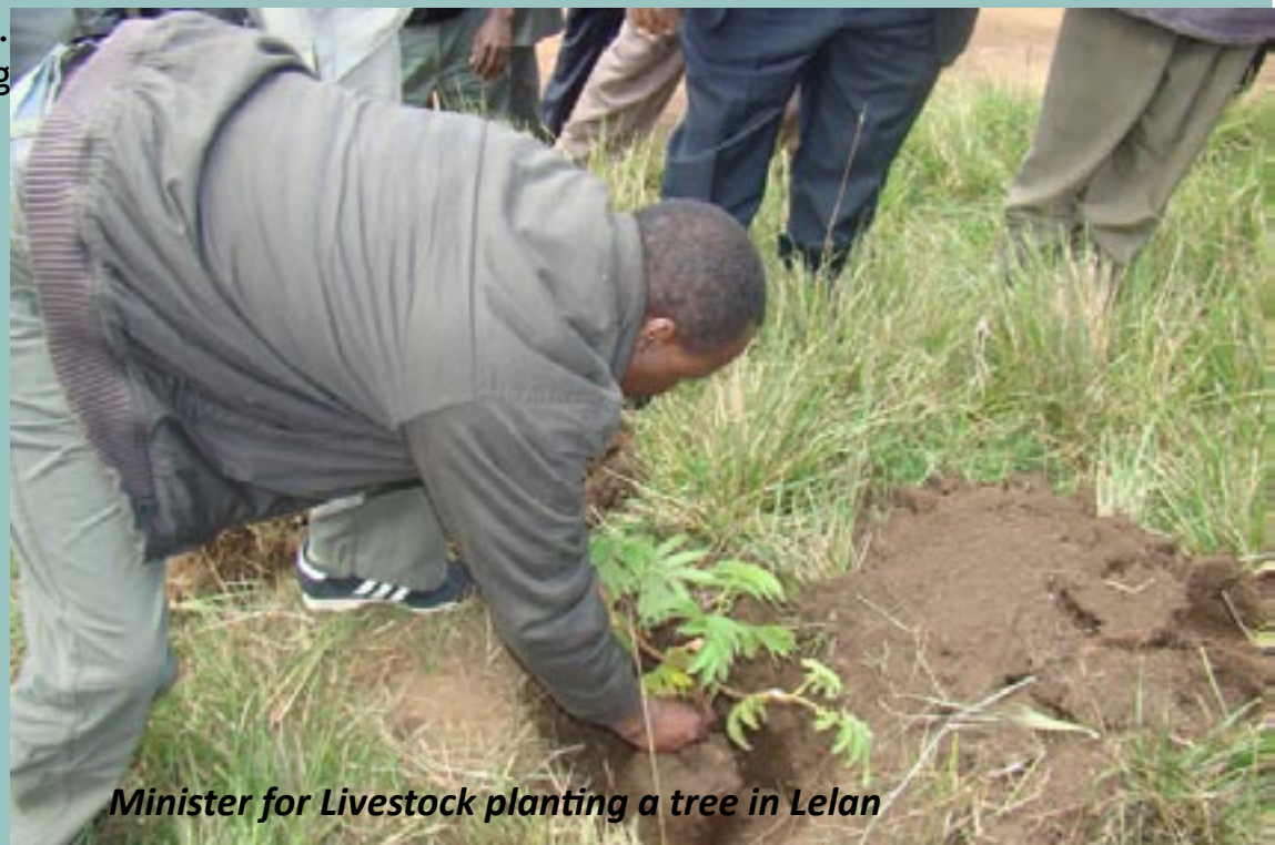
Minister for Livestock planting a tree in Lelan