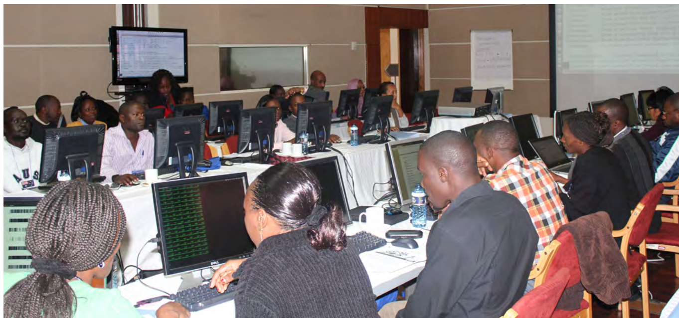
Participants of BecA-ILRI Hub's 2012 annual training workshop on Advanced Genomics and Bioinformatics attend a lab session at the ILRI campus in Nairobi.