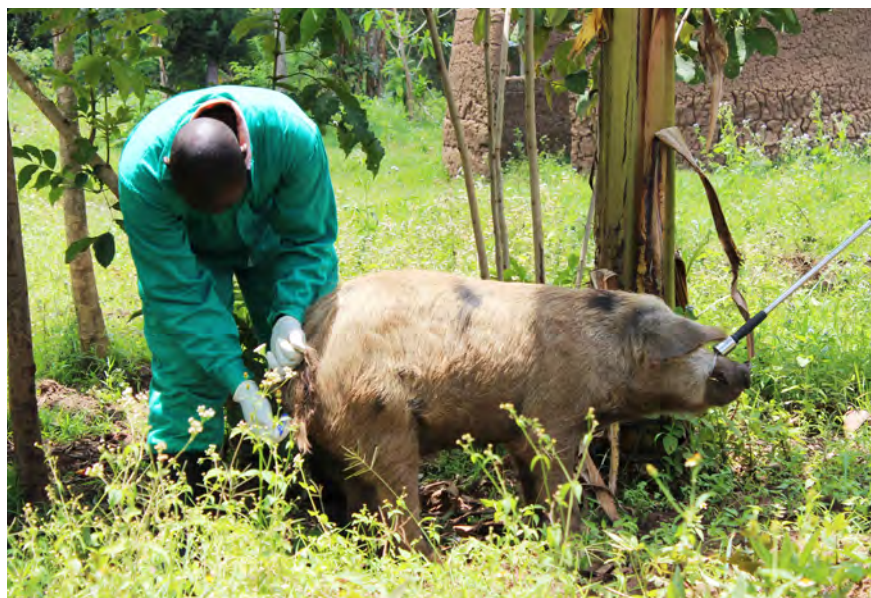
A blood sample is taken from a pig during a field survey by the African swine fever project team in Busia, western Kenya.

Leading Australian scientists are key collaborators in these projects. They include researchers from CSIRO and other Australian institutions with core skills ranging from bioscience, biometrics, food processing, analytical chemistry, biosensors, human nutrition, farming/ecological modelling and social science. CSIRO is also contributing invaluable communication and stakeholder engagement expertise