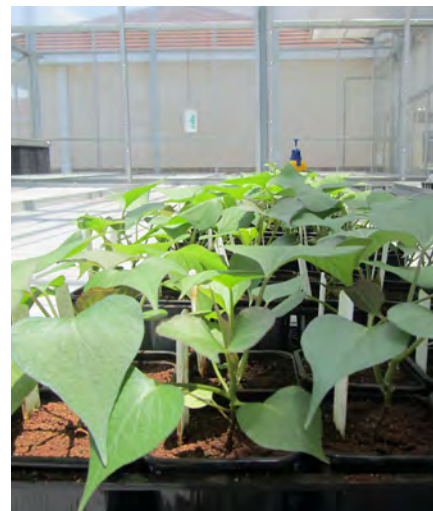
Crops in the green house at the BecA-ILRI Hub, Nairobi.

Goats are a significant component of the livelihood of smallholder farmers and pastoralists in Cameroon and Ethiopia. In this project, partners in both countries aim to increase goat productivity through strengthening the capacity of national