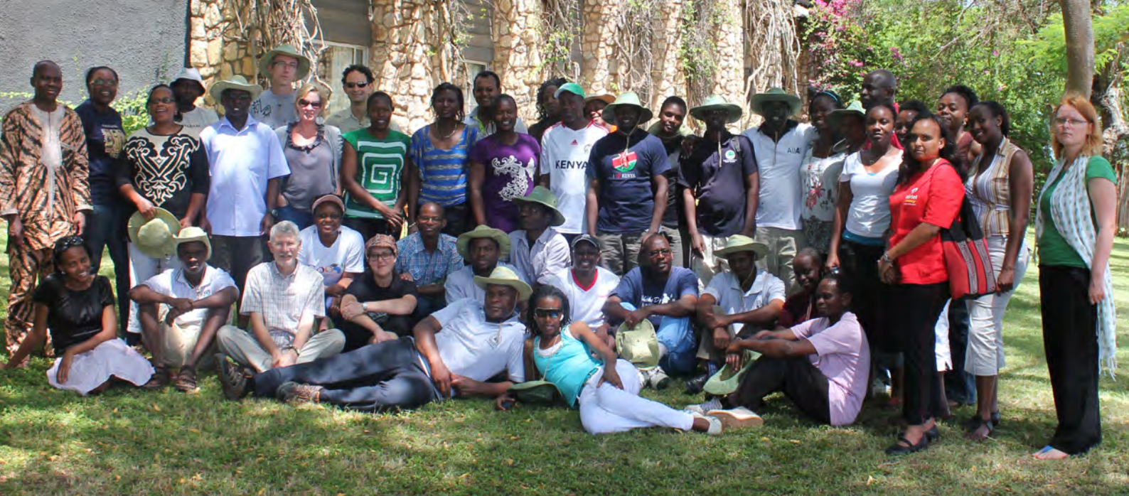
The BecA-ILRI Hub team during a planning and strategy retreat in Taita Hills, Kenya. The team has 44 members from eight countries - Australia, Benin, Cameroon, Ethiopia, Italy, Kenya, UK and USA