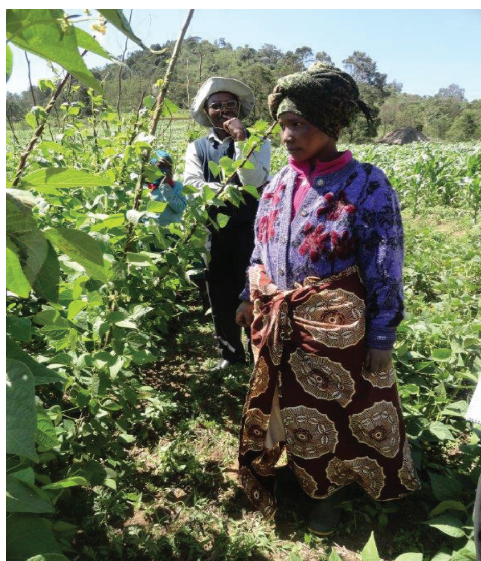
Farmer in Babati, Tanzania, testing maize - climbing bean intercropping