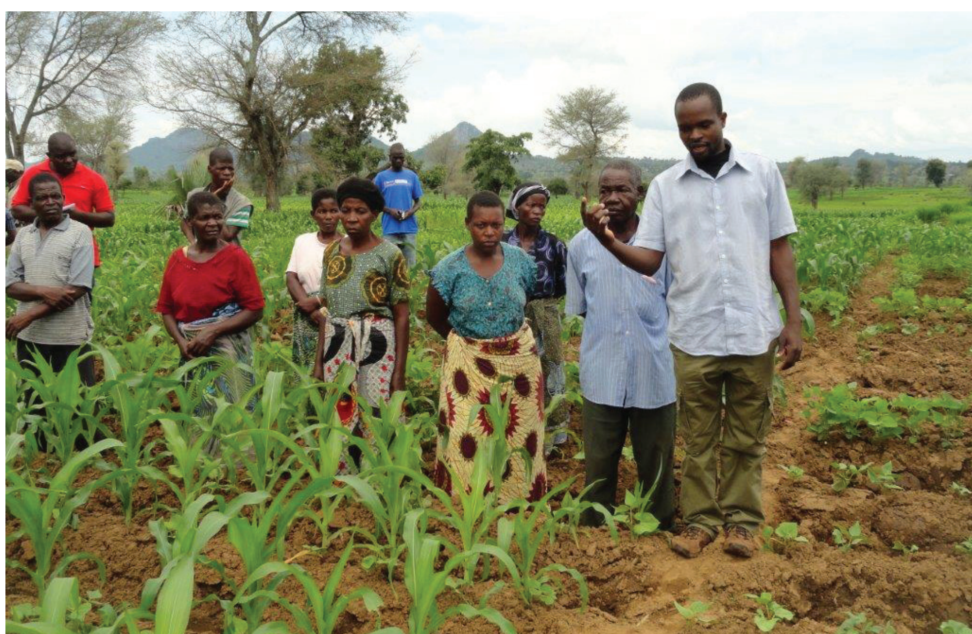
Farmers discussing field experiments

The African Research in Sustainable Intensification for the Next Generation (Africa RISING) comprise three research for-development projects for West Africa, East and Southern Africa, and the Ethiopian highland supported by the United States Agency for International Development as part of the U.S. government's Feed the Future Initiative. Africa RISING in East and Southern Africa is being implemented in Tanzania, Malawi and Zambia.