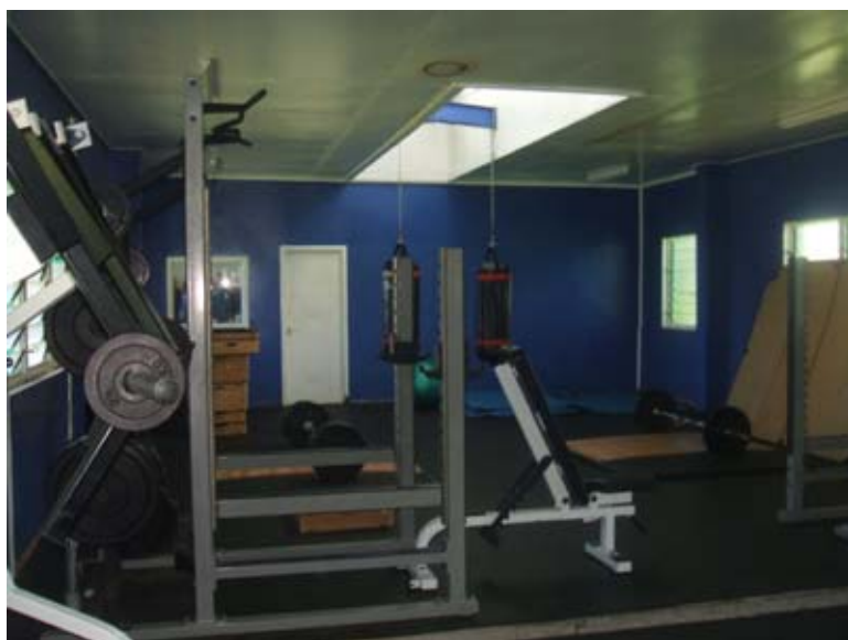
Newly operated fitness gym on Campus

But the village has regulations which make it best suited for students who are able to adhere and follow the residential regulations. The regulations does not mean it's a strict boarding