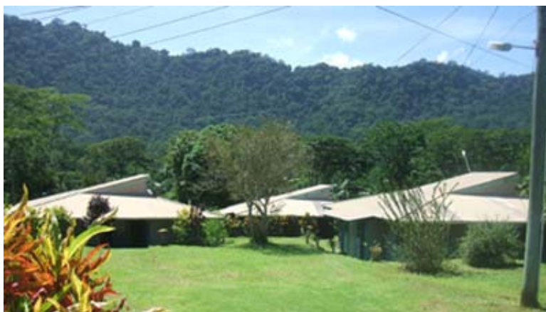
Residential Halls at the lower block