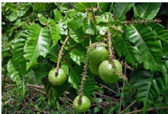
Fruits and leaves.

The tree fruit’s domestication will require the identification and collection of best varieties of which seedlings or cuttings would be used for cloning and desired clones propagated and distributed to farmers. In the last few years, taun fruits have been collected from selected trees and evaluated for quality characterisation such as fruit size, texture and taste.