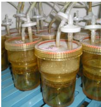
Immersion in progress using RITA technology