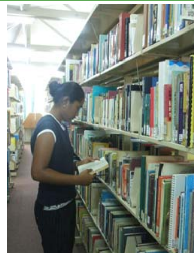
In the library

block, but it is the concern and the respect of making the village a comfortable place to stay and study.