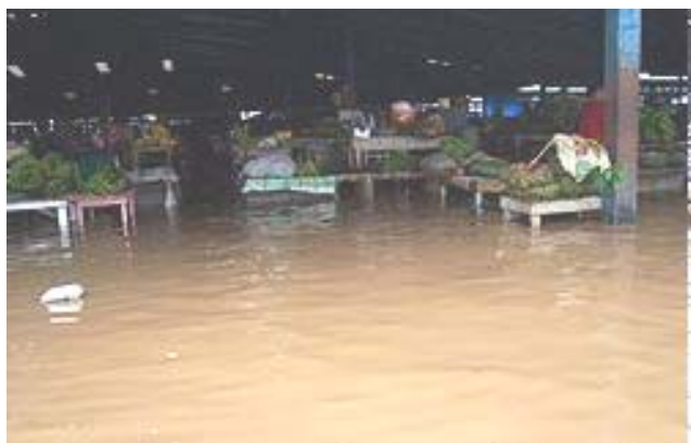
Event Polynesia ( www.eventpolynesia.com ) captures a flooded Fugalei market during the rainy season

The strong demand for some of this agricultural demand was associated with the overall growth in the economy according to the Fugalei Market Survey for November.