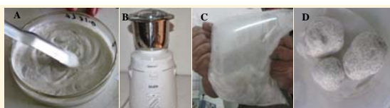
Figure 1. Wet mixing of the PhopGV -talcum preparations in Petri dishes (A); blender used for dry mixing (B); treating potatoes with product in plastic bag (C); Treated potatoes used in bioassay (D).

Bioassays: 50 neonate P. operculella larvae were placed on 100 g treated potato (4 replications per treatment, completely randomized). Virus concentration-mortality lines and relative potencies were determined through Probit regression for each product application rate and formulation type in a parallel line assay. Mortalities observed were adjusted for natural and talcum-caused mortality.