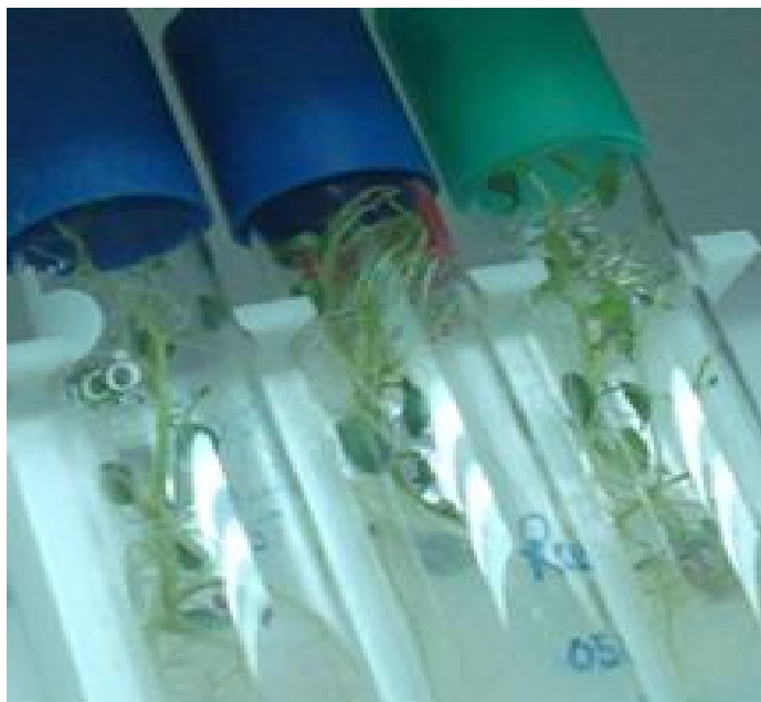
Figure 1. A picture of potato plantlets in a solid growth media in a tissue culture growth chamber (Chiipanthenga 2009, unpublished).

Tissue culture is not limited by the time of the year or weather. Healthy plants can be grown in a laboratory at any time of the year. In addition, conditions in the laboratory are ideal and therefore, conducive to all year round production scheduling. It also saves an enormous amount of daily care required by conventional cuttings and seedlings (Tudge, 1988; Mahmond, 2006). Tissue culture is also used in somatic hybridisation, the induction and selection of mutants and biosynthesis of secondary products (Beukema and Van der Zaag, 1990).