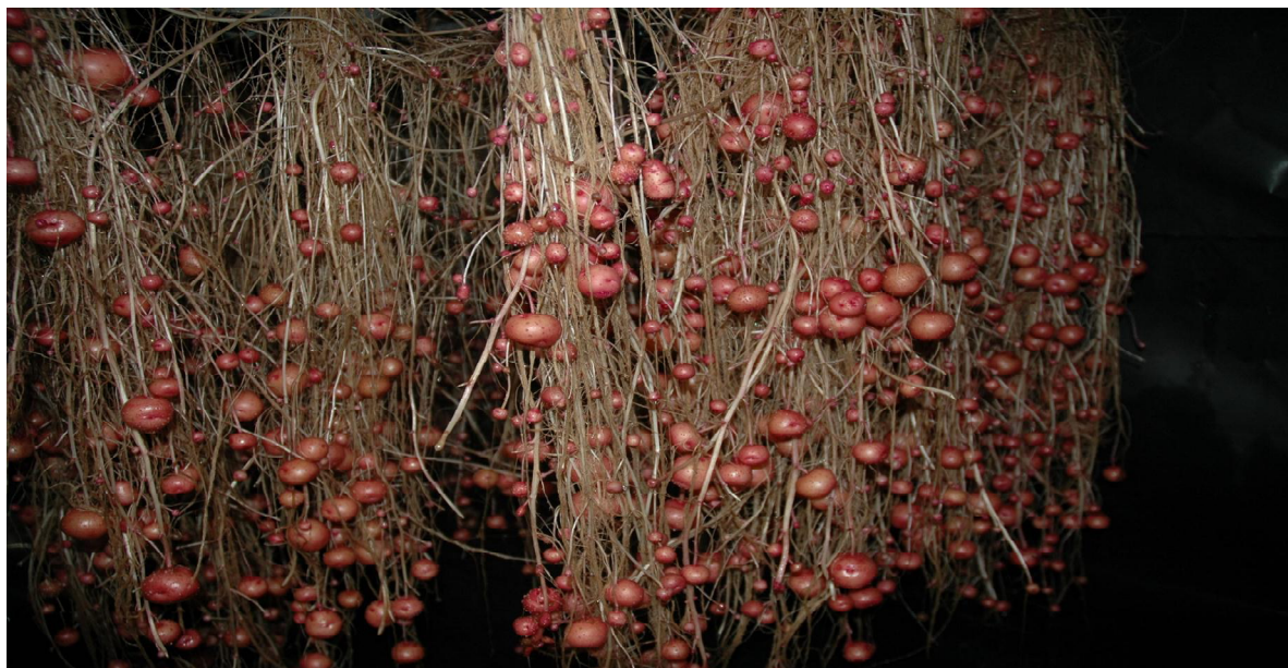
Figure 2. A picture of seed potatoes showing a prolific potato seed propagation and root air optimization in an aeroponic system (CIP, 2008).

efficient and cheaper system to rapidly produce high quality seed tubers for commercial production.