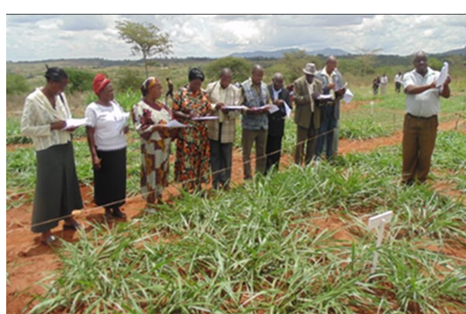
Fig 1. Farmers evaluating Brachiaria varieties at KALRO–Katumani, Kenya