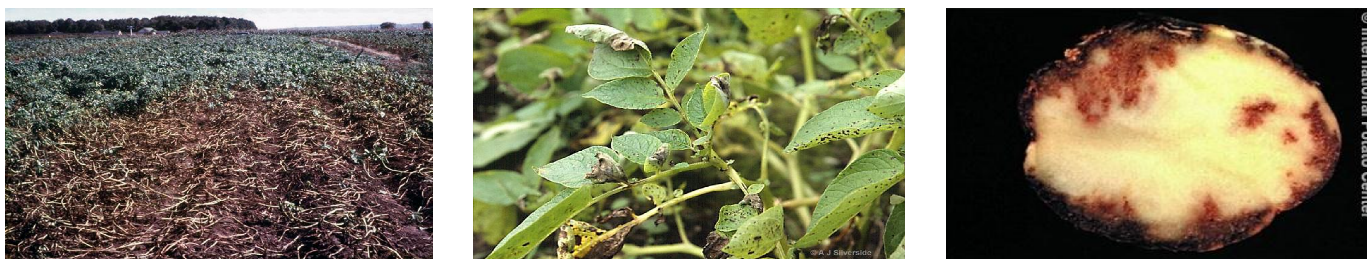
Figure 1: Damage caused by P. infestans in the field (left), on potato leaf (center) and tuber (right).

One of our current strategies to control this devastating disease include stacking broad-spectrum resistance genes isolated from wild potato relatives through transgenesis. The RB , Rpi-blb2 (isolated from Solanum bulbocastanum ) and the Rpi-vnt1.1 (isolated from S. venturii ) R genes (Song et al. 2003; Vossen et al., 2005) can be transferred by genetic engineering into susceptible farmer-preferred varieties. These R genes were cloned into a triple R gene construct (pCIP99) to transform two susceptible potato varieties grown in SSA. 'Desiree' was chosen essentially because of its high transformation efficiency and for testing efficacy with single and the stacked R genes whereas 'Victoria/Asante' for its wide adoption as stable variety in Kenya and Uganda. The later will only be transformed with the 3 R gene stack.