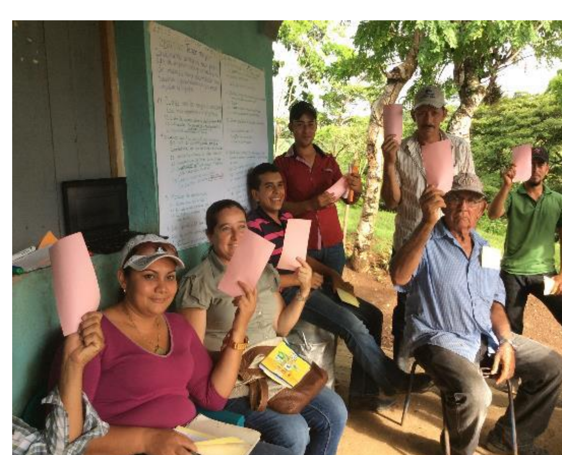
Focus group discussion