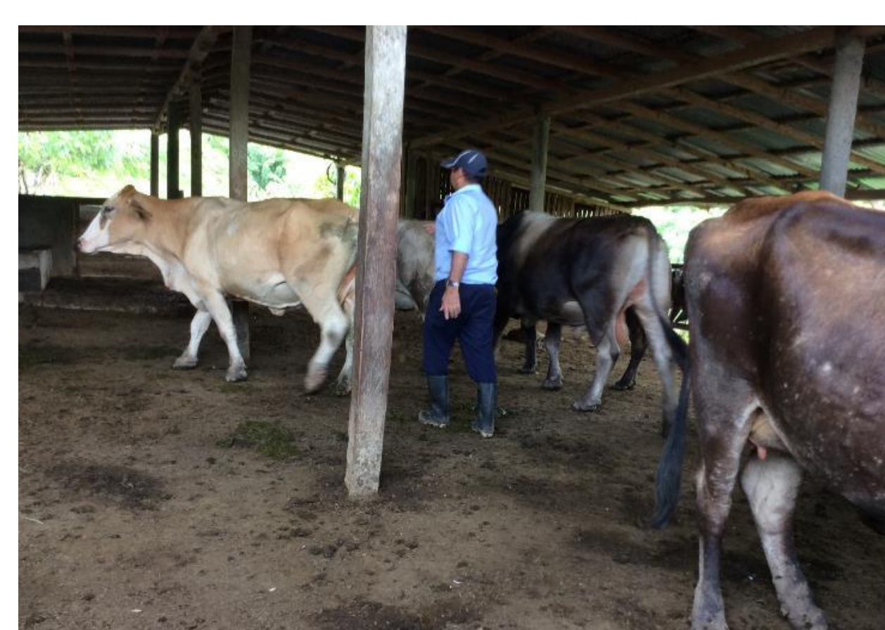
Breed diversity on a farm

Summary statistics and analyses of variance were carried out using Genstat