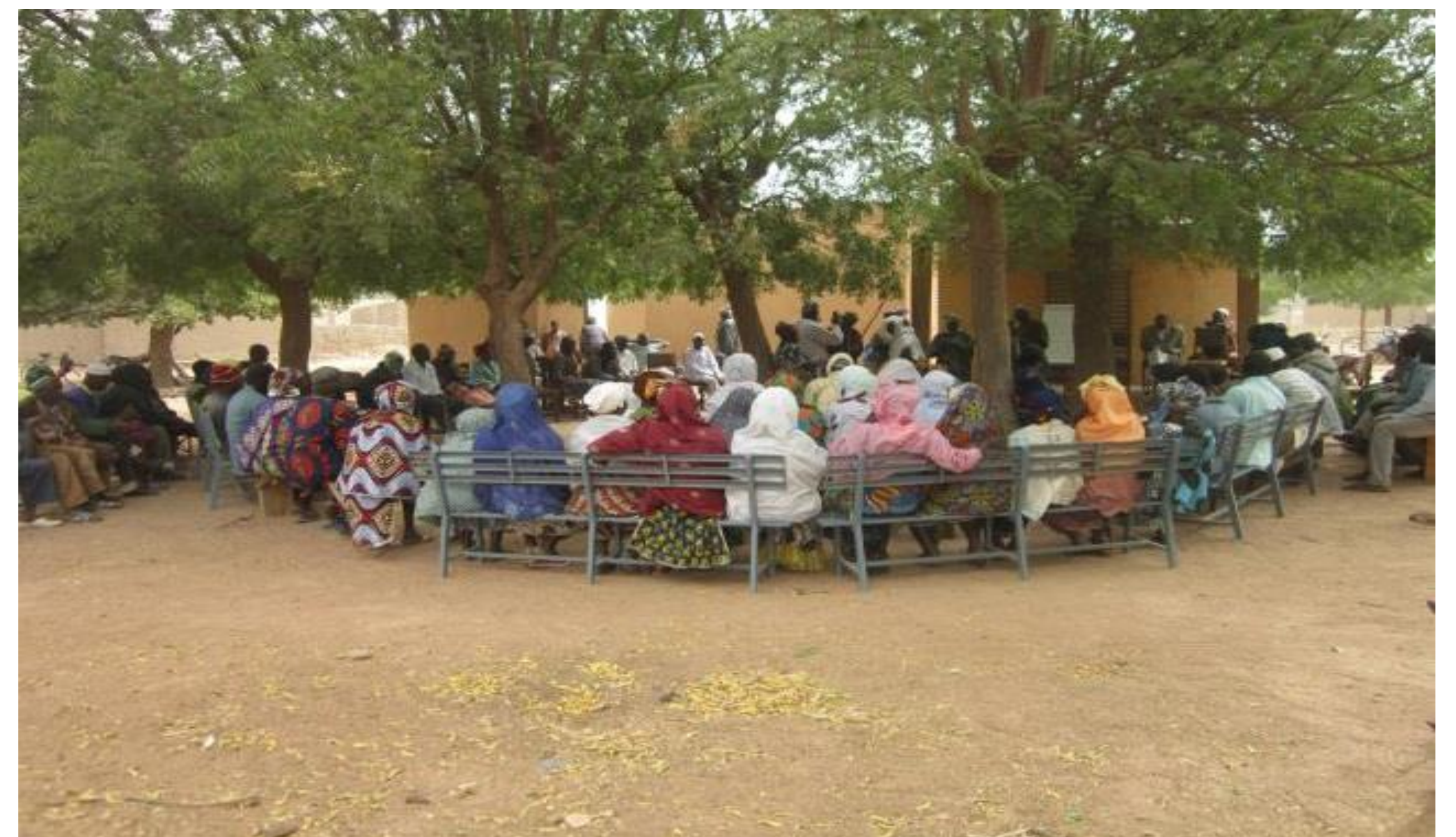
Photo1. Community participation in elaboration of local conventions