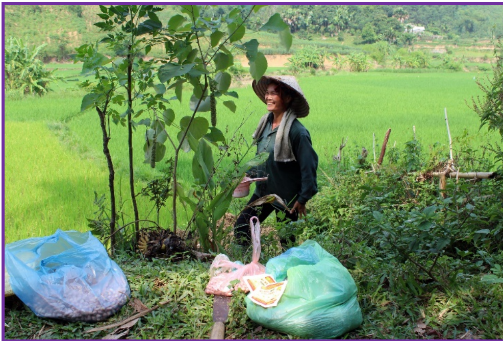
Photo 1. Lowland and upland areas of Ma village.