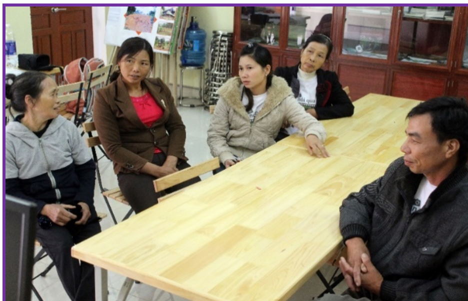
Photo 3. Focus group discussion.

was also held at the village meeting room; one of the technical project staff was present to take notes of the discussion. The farmers for the FGD were invited by the village leader. This may have coloured the selection process to some degree, but the purpose was not to have a statistical representative group of non-participating farmers; rather to obtain some initial feedback from non-participating farmers.