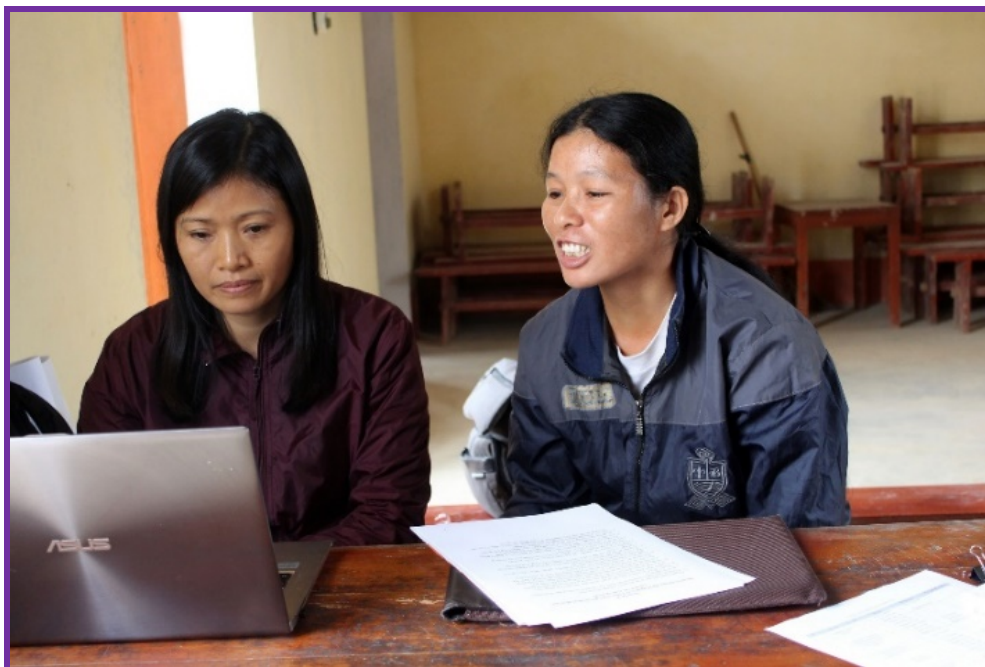
Photo 2. Interview with ma village farmer.

presence of project staff. Each interview lasted between 30 and 45 minutes. Interviewees were selected from the list of experimenters representing all the CSA options being tested. Interviews were held at the village meeting hall. One limitation of this venue was that the actual experiments could not be observed.