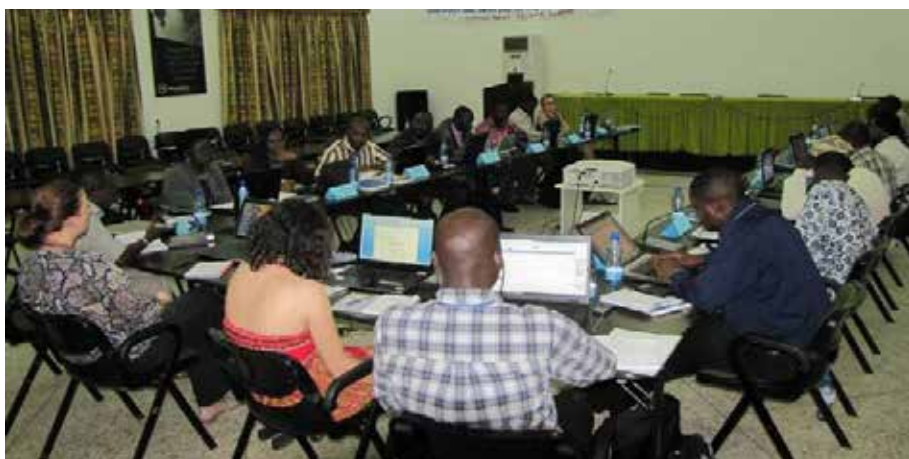
Training course on advanced qualitative data analysis using NVivo (29 April–3 May 2013, AfricaRice, Benin).

analyzing, and sharing data, no matter the method used. AfricaRice organized a group training course on advanced qualitative data analysis for NARS taskforce members from 15 countries at AfricaRice, Benin from 29 April to 3 May 2013, where the use of NVivo was explained in detail using diagnostic survey data gathered in the project.