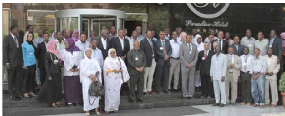
Participants at the SARD-SC Wheat Inception Workshop for the East Africa Lowlands hub, 13-15 April 2013, Khartoum, Sudan.

Despite the late start of the SARD-SC Project, it was possible to plan and carry out a number of activities in the East Africa Lowlands and the West Africa Lowlands hubs during the 2012–2013 cool season.