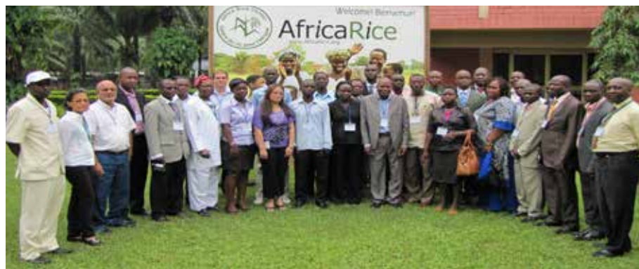
Training of NARS Administration and Finance Officers (29–31 May 2013, AfricaRice, Cotonou, Benin).

Proper management of the SARD-SC project is of paramount importance, not only among the executing and implementing partners, but also among the NARS partners. Therefore, especially under impetus from the SARD-SC project, AfricaRice gathered accountants from all 26 countries that receive grants at AfricaRice, Benin