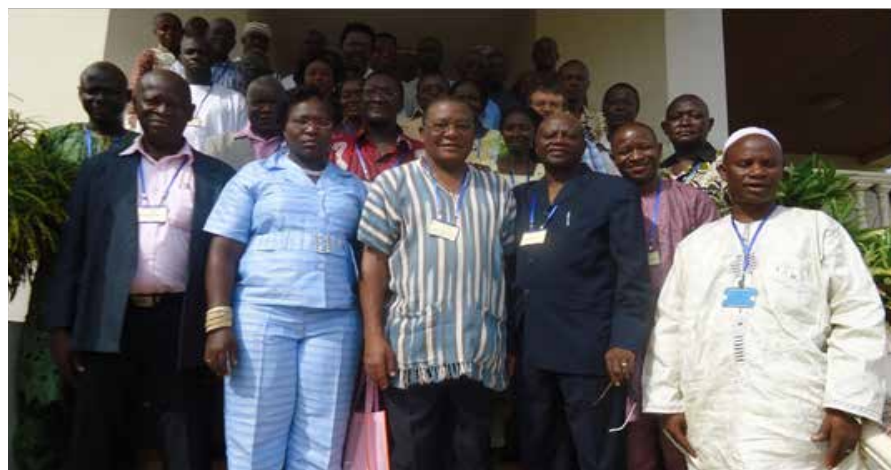
Participants at the SARD-SC cassava launching 22-23 March 2013 at Freetown, Sierra Leone.

Community awareness activities have included consultative and sensitization visits backed by an initial series of radio spots on community radio stations.