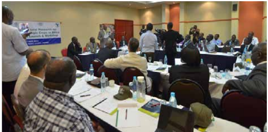
Honorable Robert Sichinga, Zambia’s Minister of Agriculture and Cooperatives Minister of Zambia addressing the stakeholders during the launching workshop in Lusaka, Zambia.