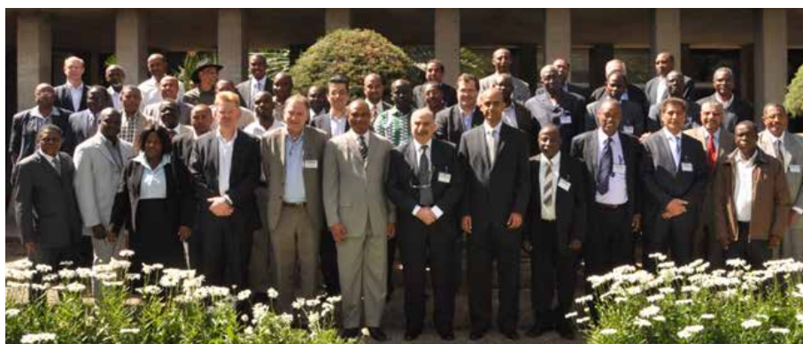
Participants at the SARD-SC Wheat Inception Workshop, 27-28 February 2013, Addis Ababa, Ethiopia

An inception workshop for the SARD-SC Wheat Project was held at Addis Ababa on 27-28 February 2013, with an attendance of 58 participants, including 26 from NARES (of Ethiopia, Kenya, Mali, Mauritania, Niger, Nigeria, Sudan, Tanzania, Zambia and Zimbabwe) , 18 from ICARDA , 6 from regional fora (ASARECA, FARA) and 8 from partner institutions (IITA and CIMMYT) and AfDB. The project activities will involve the participation of and serve the interest of all stakeholders in the wheat value chain, encompassing crop improvement, soil-water-crop management, seed production, post harvest management, grain transportation, processing, marketing, favorable pro-smallholder policies for credit and for input acquisition and delivery. AfDB presentations focused on procurement and financial procedures required for an efficient management of the SARD-SC project. NARES presented the challenges