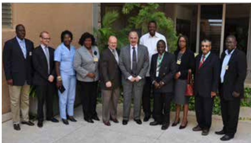
Members of the SARD-SC Project Steering Committee in IITA, Ibadan, Nigeria

The Project Steering Committee (PSC) of the SARD-SC project held their first meeting in March at IITA, in Ibadan, Nigeria.