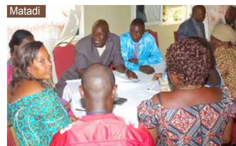
A cross section of the group discussions during the SARD-SC at Matadi and Bukavu, DR Congo.