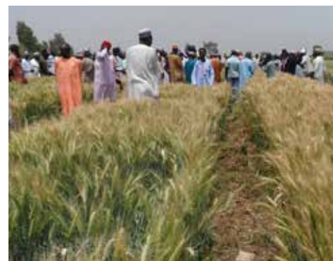
Farmers Field day at Kano, 11 March 2013, Nigeria