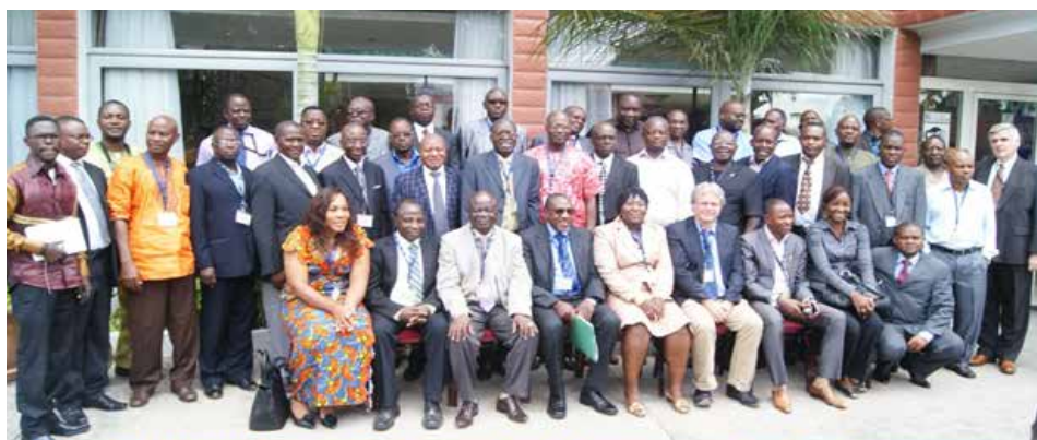
Participants at the SARD-SC Cassava Workshop, 12-13 February 2013, Kinshasa, DR Congo.

The SARD-SC cassava workshop was held in Kinshasa, DR Congo on 12-13 February 2013 with the aim of bringing all the cassava stakeholders from the four participating countries to familiarize themselves with the project activities, implementation arrangements, M&E framework, finance management,