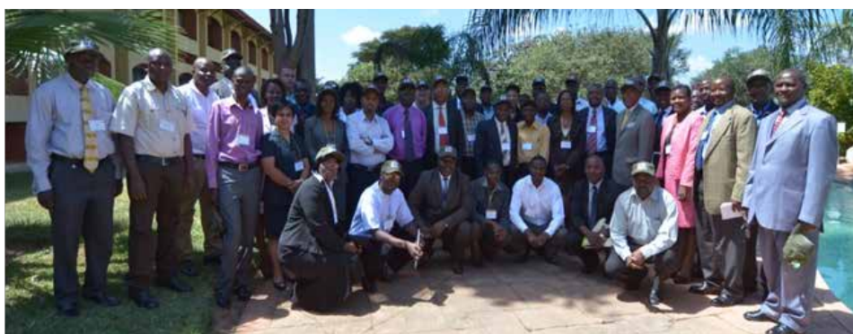
Participants at the SARD-SC Cassava and Maize Workshop, 16-17 April, Lusaka, Zambia.

capacity building, and networking. This workshop also helped to identify some challenges that can delay progress.