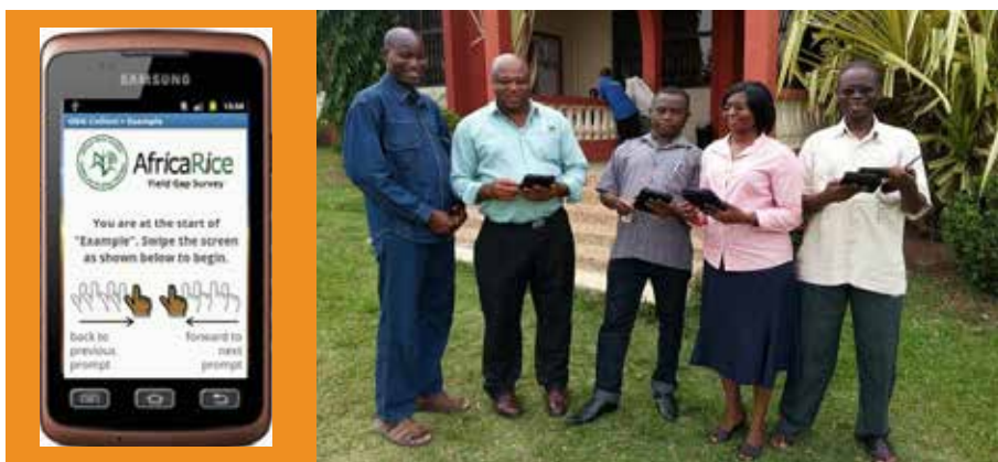
Smartphone displaying software for yield gap survey (left); extension agents in Ghana displaying tablets for yield gap survey (right).

facilitated "discussion groups", additional qualitative information is gathered and discussions are focused on understanding the "how" and "why" of a particular issue. Thus far, eight countries have conducted the diagnostic survey in one hub while seven countries conducted it in two hubs. Ten countries (Benin, Cameroon, Côte d'Ivoire, Gambia, Ethiopia, Mali, Nigeria, Senegal, Tanzania, and Togo) were able to complete data transcription for all interviews. Data transcriptions will be analyzed using NVivo, a qualitative data analysis computer software package produced by QSR International (UK). Using NVivo, researchers can analyze unstructured or semi-structured data like interviews, surveys, field notes, web pages, and audio clips; NVivo has been specifically designed for qualitative researchers working with very rich text-based multimedia information, where deep levels of analysis are required. The software does not favor a particular methodology but is designed to facilitate common qualitative techniques for organizing,