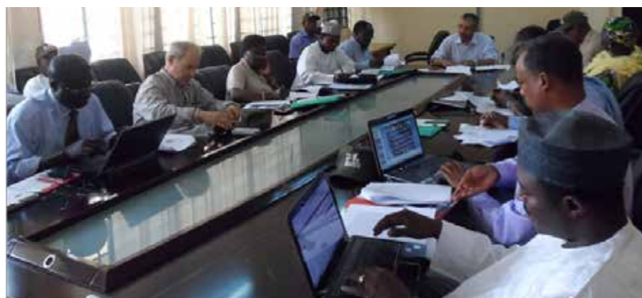
A working session of the SARD-SC Wheat launching workshop for West Africa Lowlands hub, 20-23 March 2013, ARCN, Abuja, Nigeria.

and opportunities of wheat production in their respective countries. Several constraints to wheat production were enumerated by the participants, with the lack of proper technology being the most frequent challenge, followed by access to machinery, inputs and credit, ineffective extension systems, small farm holdings, and insufficient research capacity. Discussions centered on the optimal approach and mechanism to address these challenges through an efficient use of resources and expertise made available through the SARD-SC Project. The project will address these challenges through the confirmation of research-proven improved technology and its dissemination for rapid farmer uptake, through strengthening the capacity of both the technology