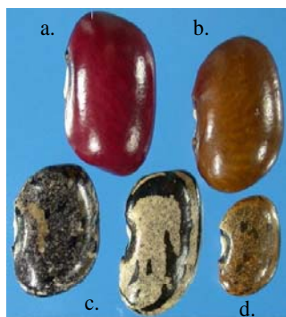
Figure 1. Biological forms evaluated:

Seeds of such complex were collected in six natural populations during 1987, 1998 and 2003 in the Central Valley (González-Torres et al. 2003). A morphoagronomic evaluation (weight of 100 seeds in grams) was performed to select 732 individuals of each different biological form: wild, weedy and cultivated (Figure 1), out of which 217 individuals were weedy types possibly resulting from gene flow. A similar procedure has been used by Papa & Gepts (2003). We used as markers phaseolin and two loci of isozymes, and nine loci of microsatellites to evaluate the contribution of nuclear genome to gene flow. In addition, the direction of gene transfer was determined by RFLPs-PCR on cpDNA (Chacón 2001). A multiple correspondence analysis (MCA) was performed to observe in a multidimensional plane the genetic structure of the population of evaluated individuals.