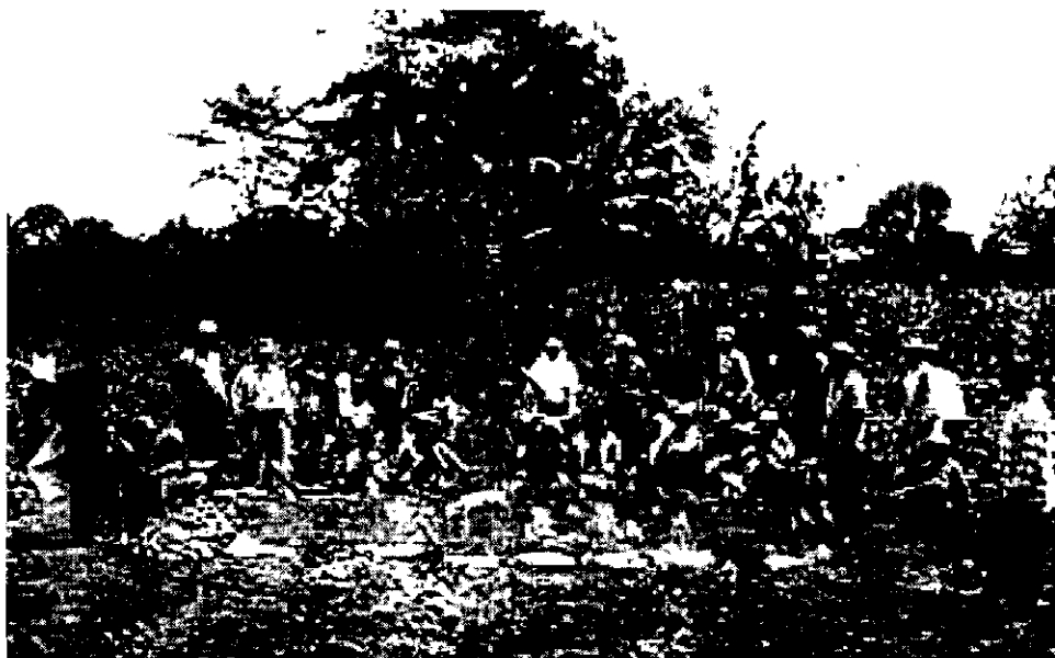
Figure 1. Farmers, traders, and extensionists ranking selected sweet potatoes