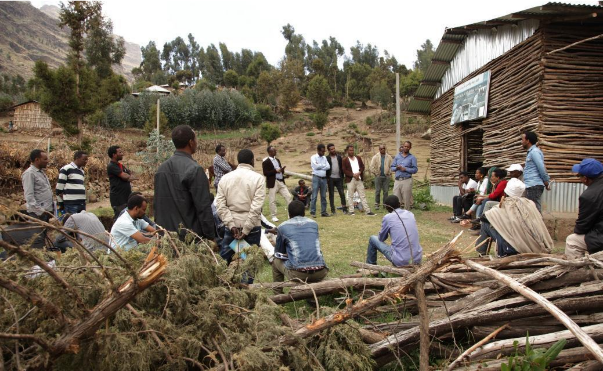
Africa RISING supports Tuemtimay Cooperative that provides improved potato seed variety to farmers