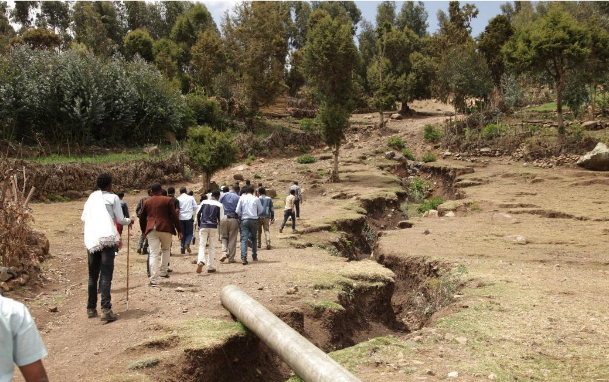
Participants moving to the next technology visit