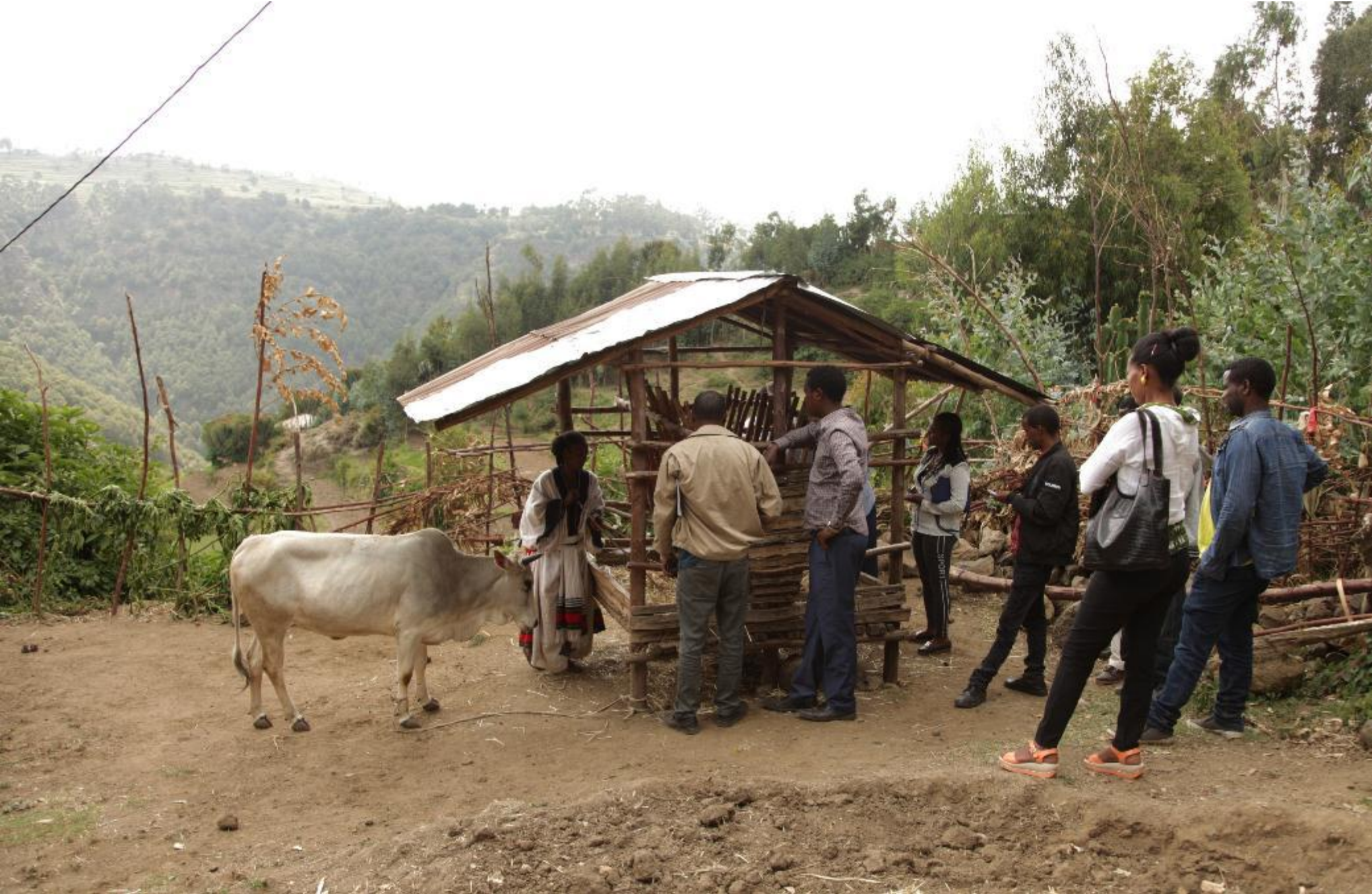
Improved feed trough