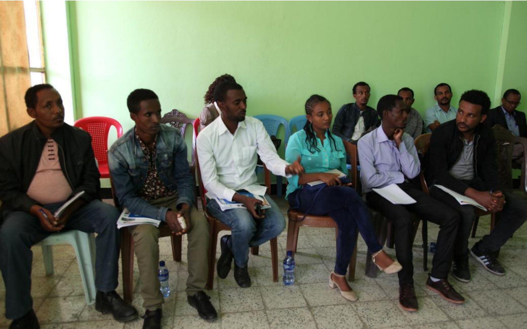
Training going on- Natural Resource Management group