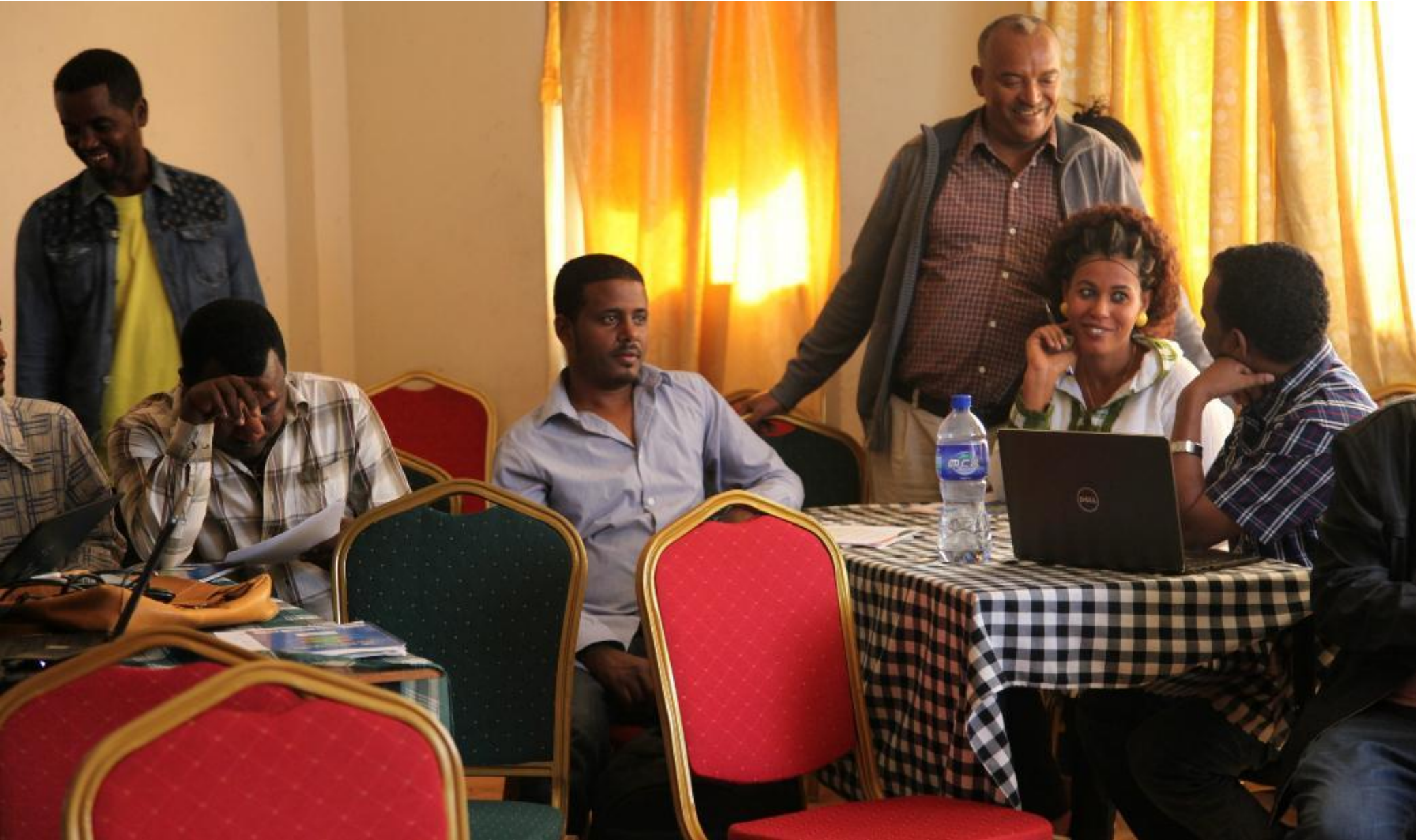
Participants getting ready to start the training workshop