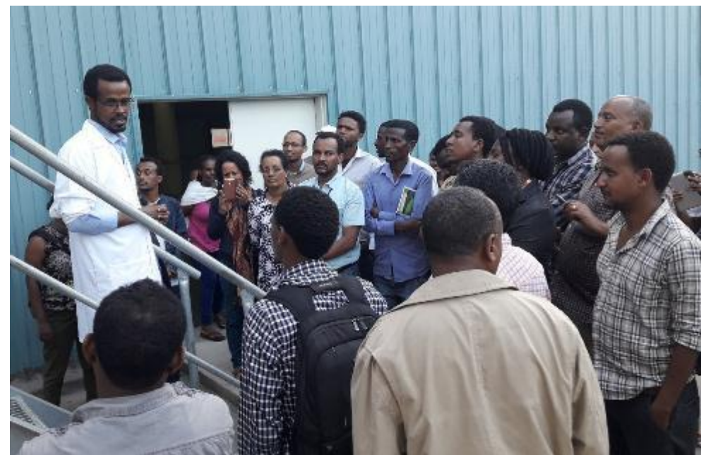
Visiting Raya Brewery, identified as a strong partner, to work with Africa RISING on Malt barely