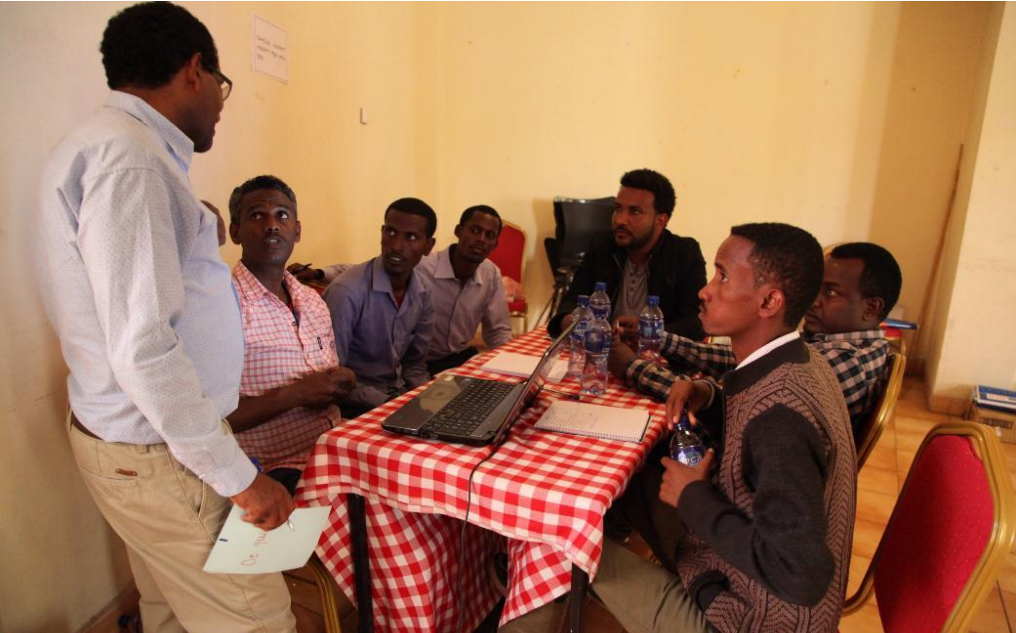
Tigray Agricultural Research Institute (TARI)-team plans their engagement with Africa RISING