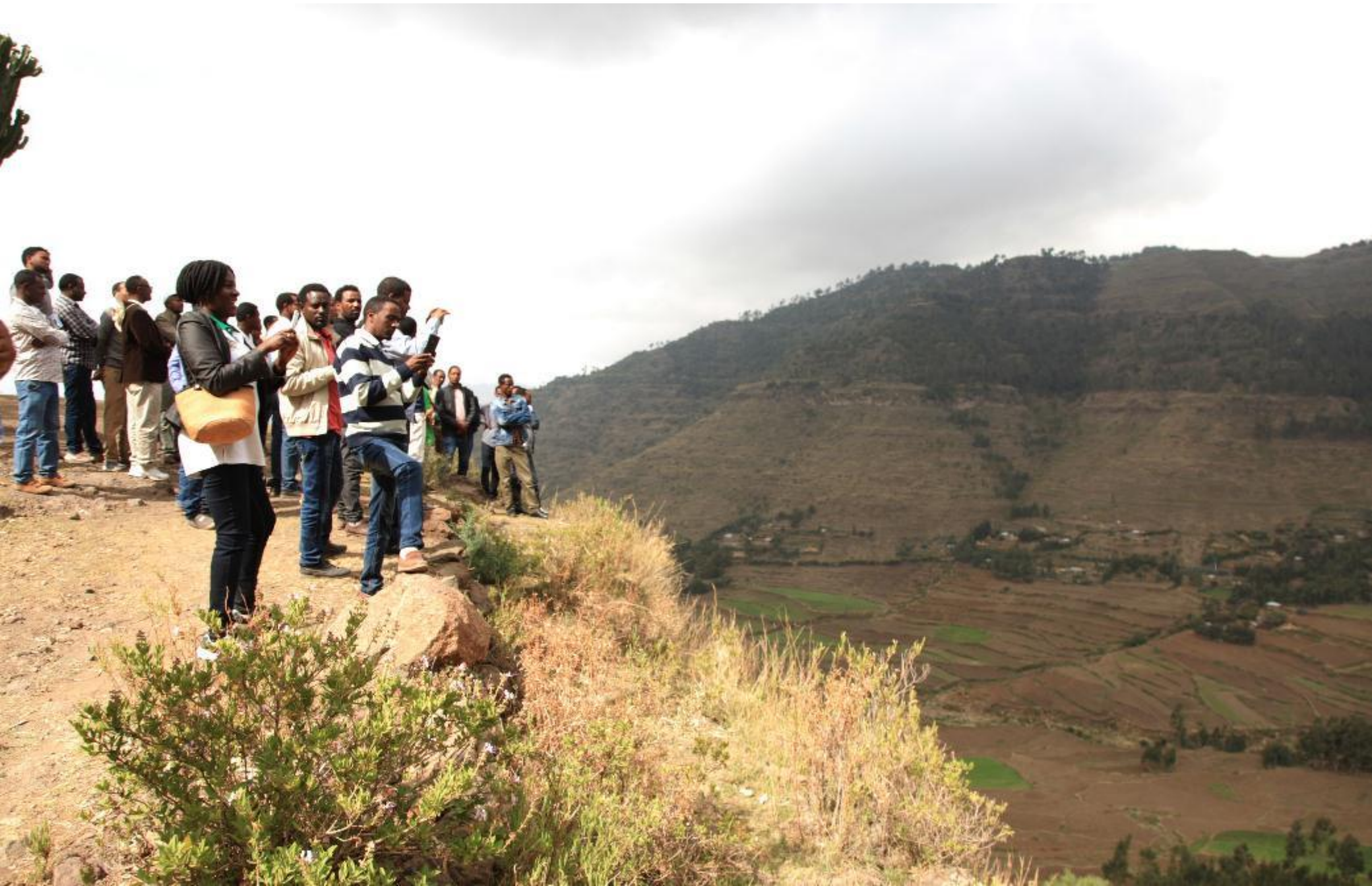
Participants visiting the watershed interventions