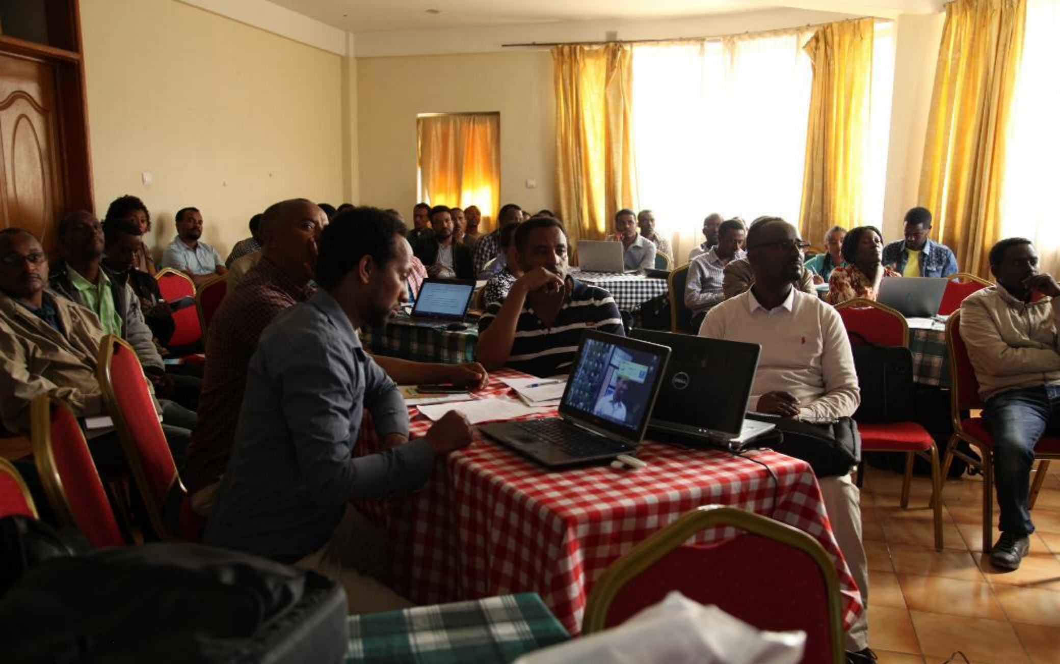
Partial view of training workshop participants