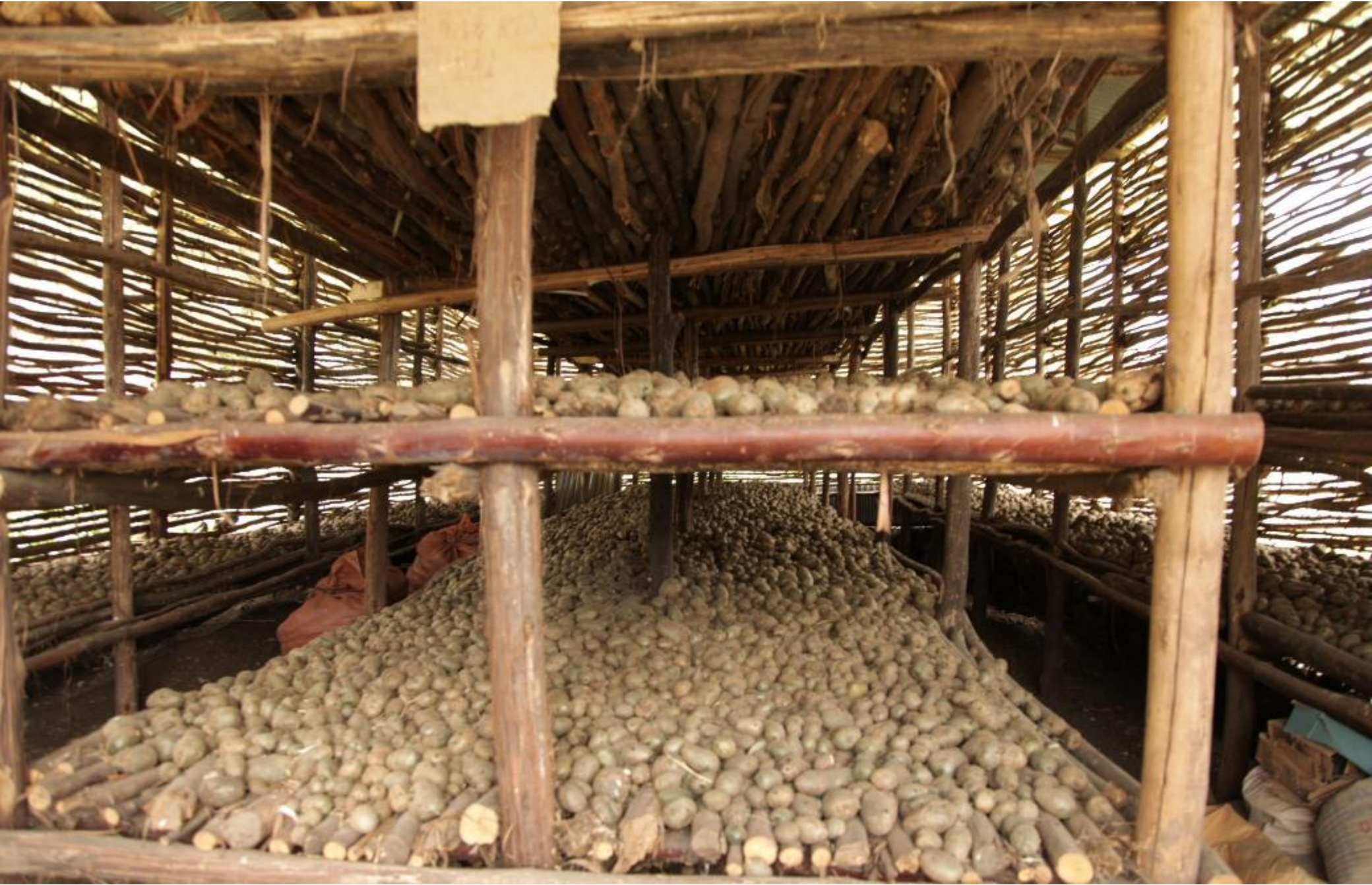
Potato seed storage from inside