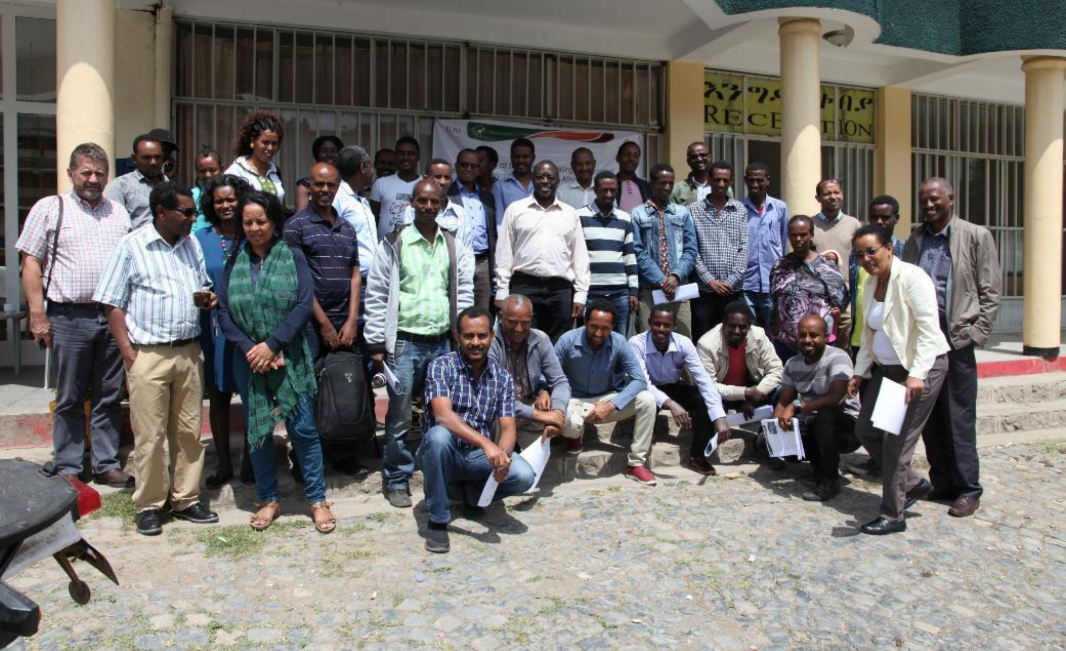
Group picture of participants at the Training of Training in Maichew, Tigray