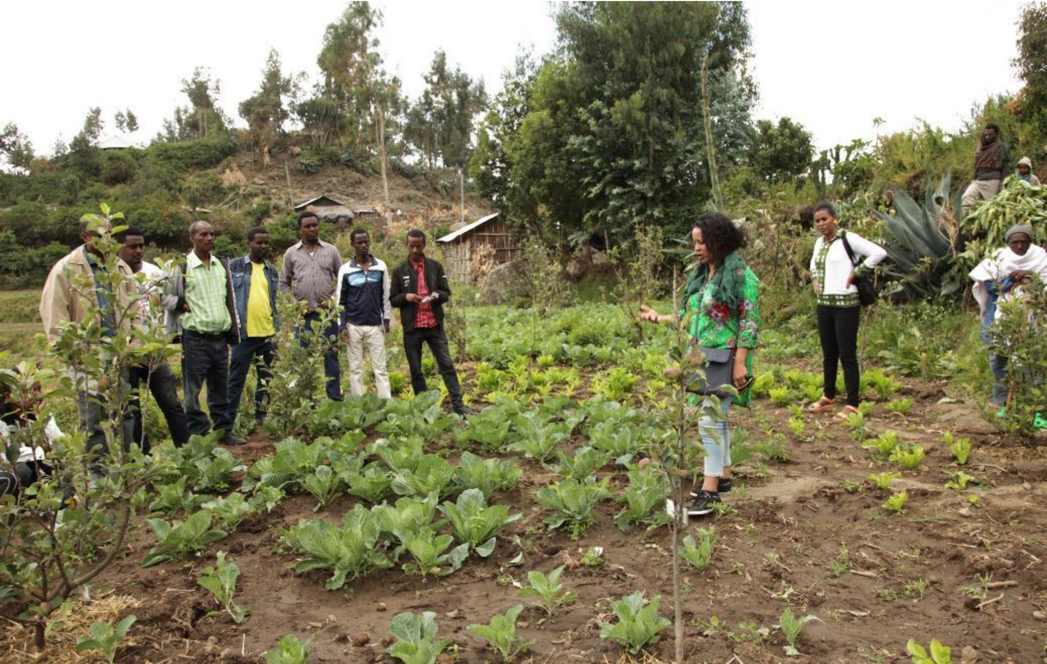
Participants visiting Apple trees that ICRAF/Africa RISING introduced