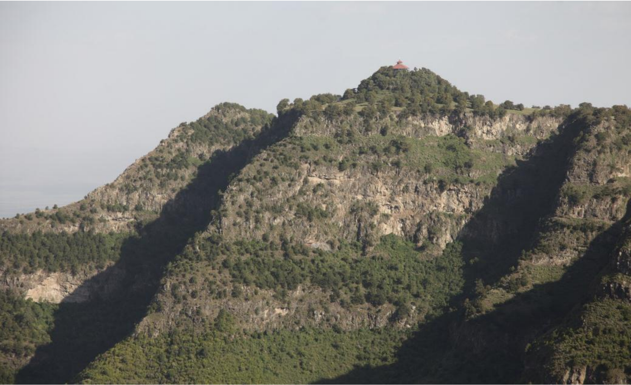
Michew's beautiful mountainous landscape