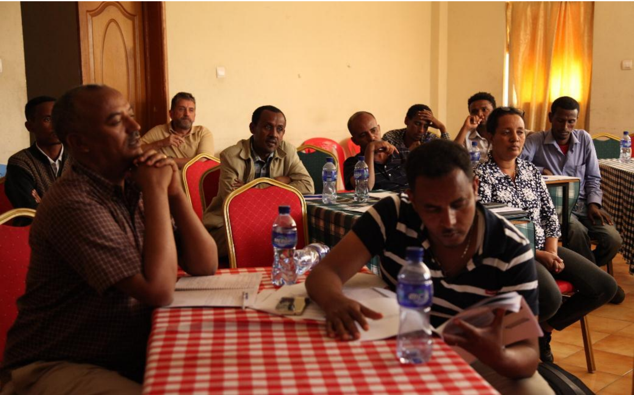
Training going on- Crop group