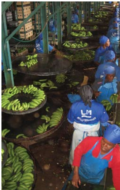
In commercial plantations, bananas are washed to remove the latex that exudes from the cut surface of the crown and any dirt or fungal spores that may be present on the fruit. This usually generates female off-farm employment

Important production constraints to the development of roots and tubers include declining soil fertility, insufficient and poor planting material, lack of well-adapted varieties, and pests and diseases (Scott et al 2000). All these constraints have significant gender dimensions relating to access to inputs, credit, agricultural knowledge and extension services, etc. However gender-