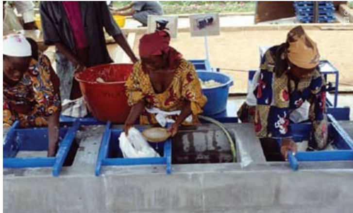
Women sieving cassava mash with IITA constructed sieves and tanks for making fufu, Nigeria

all societies and encompass all aspects of public and private life. However, by creating opportunities for poor women to benefit from technological interventions and by ensuring that interventions are designed to take into account, or compensate for, the production constraints faced by women, the activities envisaged by the RTB will contribute to the empowerment of women and in the long run to transformation of gender relations.