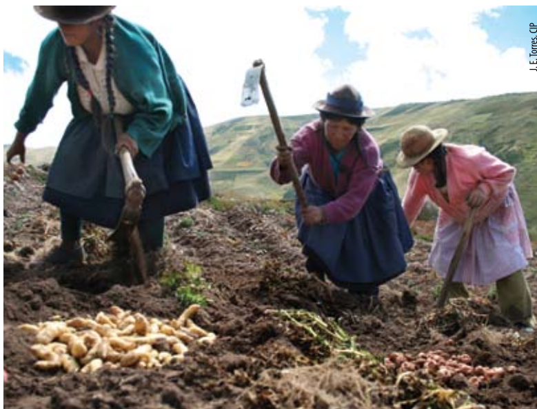
Female farmers have special responsibility for potato harvest in San José de Aymará, Apurímac, Peru

Specifically, the gender strategy will draw on tools and instruments developed through participatory research and gender analysis work on participatory plant breeding (e.g. Farnworth and Jiggins 2003). Greater equity in income benefits accruing to women and men from commercial crops can also have a broader positive impact on the farming system and on gender roles by offering a viable economic alternative to male migration. The departure of men to urban centers in search of work often leads to increased labor burdens on rural women and youths, and weaker rural economies (although it can also lead to enrichment of individual households that receive remittances). This theme will involve capacity strengthening among team members and local partners in gender-aware participatory plant breeding and preferred variety selection. In addition,