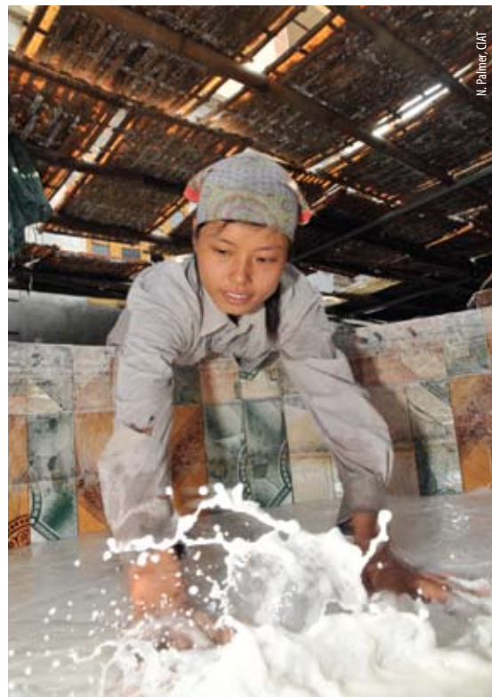
Cassava starch processing near Hanoi, Vietnam

RTB has developed a set of preliminary indicators that can be used by individual projects to assess their progress both in achieving gender-responsive research and in achieving gender-transformative work. These are discussed below. Monitoring will have to be regular and steps should be taken within individual projects to make necessary adjustments if they are not designed to be sufficiently gender-responsive.