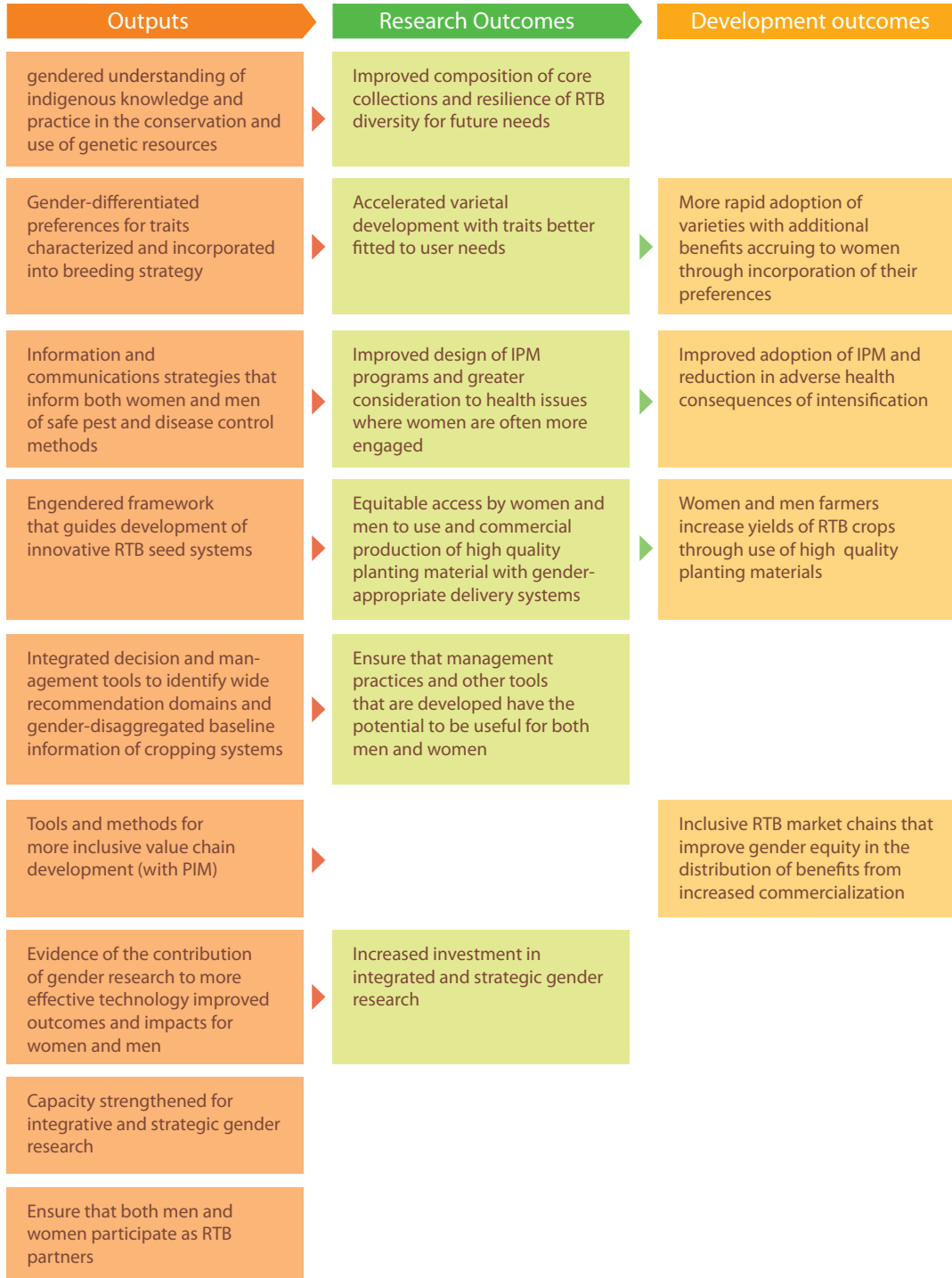
Figure 1. Schematic impact pathway for gender research in the RTB

Measurement of progress towards gender impact in RTB will be systematic and undertaken at all stages of the research cycle. It will be based on the regular monitoring of a set of pre-established indicators. These will be derived from the impact pathway for gender research in the RTB. A preliminary version of the impact pathway is shown in figure 1. This will be further developed as we get input from stakeholders and progressively engender RTB programs.