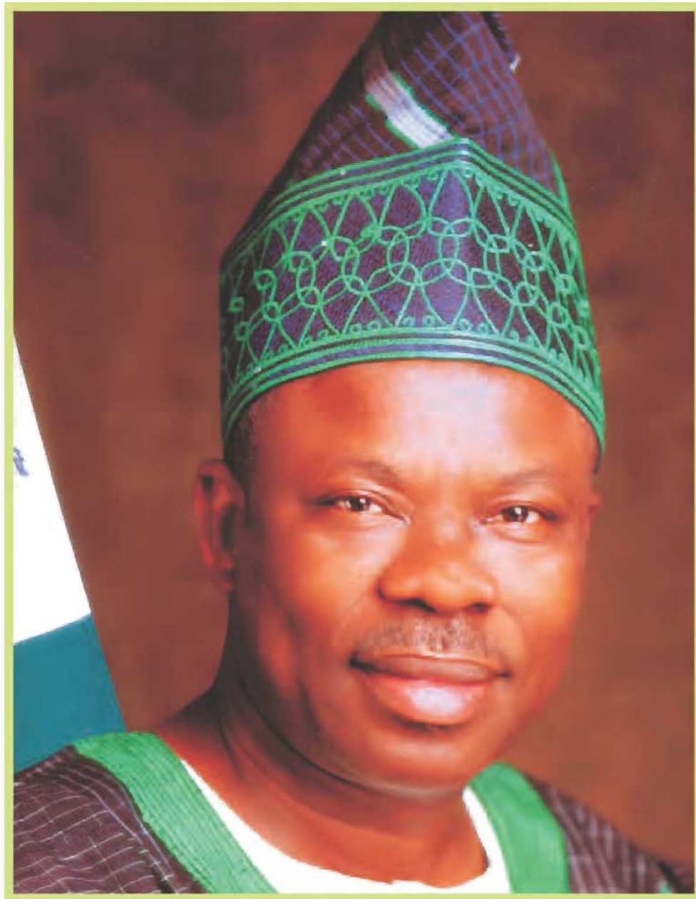
His Excellency, Governor Ibikunle Amosun Executive Governor of Ogun State