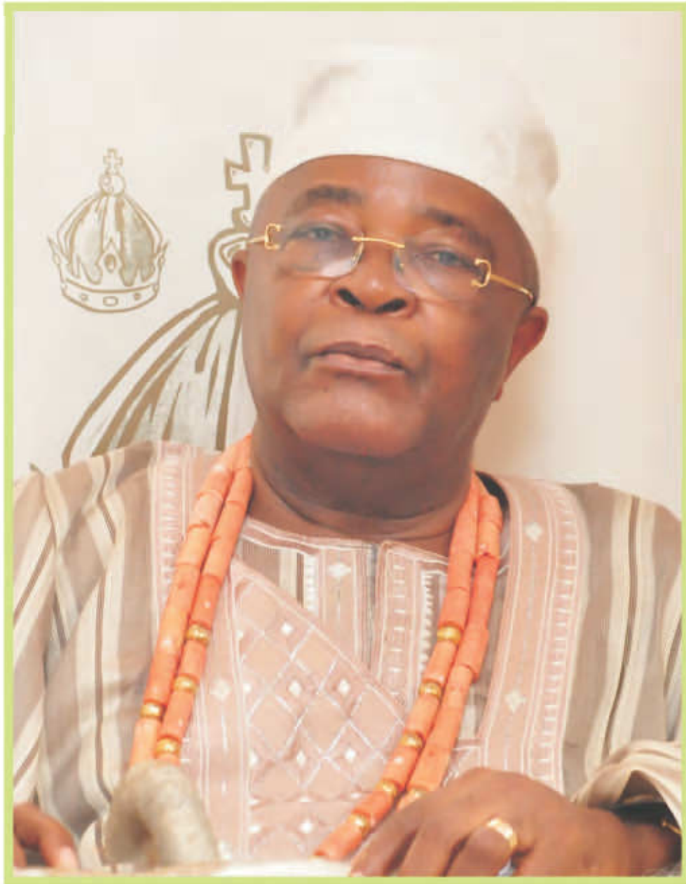
HRH Oba Adedotun Aremu Gbadebo The Alake of Egbaland