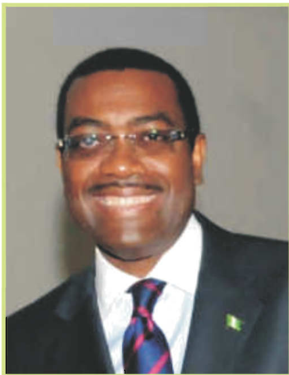
Dr Akinwumi Adesina Hon Minister of Agriculture and Natural Resources