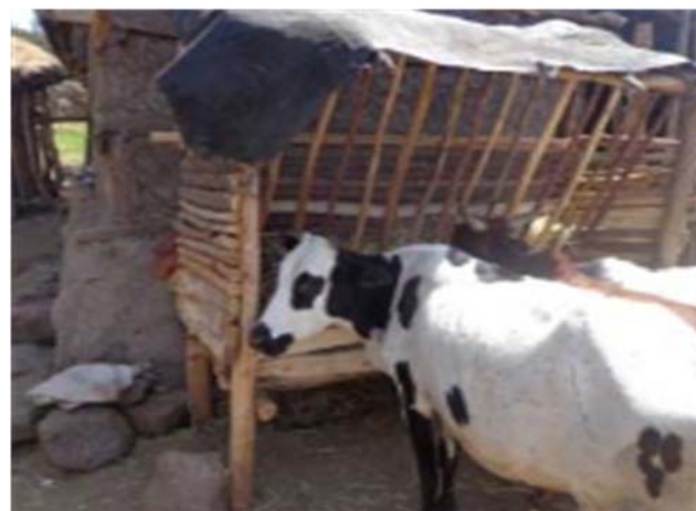
Figure 2. A one-sided feeding trough for cattle