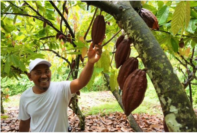
Figure 1. Cocoa agroforestry systems improve productivity and resilience and serve as carbon sinks in Southeast Asia.

Improved, robust, MRV is critical to the future of agroforestry in climate change mitigation and adaptation. Here we report on a first appraisal of agroforestry in MRV systems under the UNFCCC, with a focus on national inventories and REDD+/NAMAs. We examine attempts by countries to monitor and report on trees outside forests, the barriers they have encountered, and the ways they have sought to overcome these challenges.