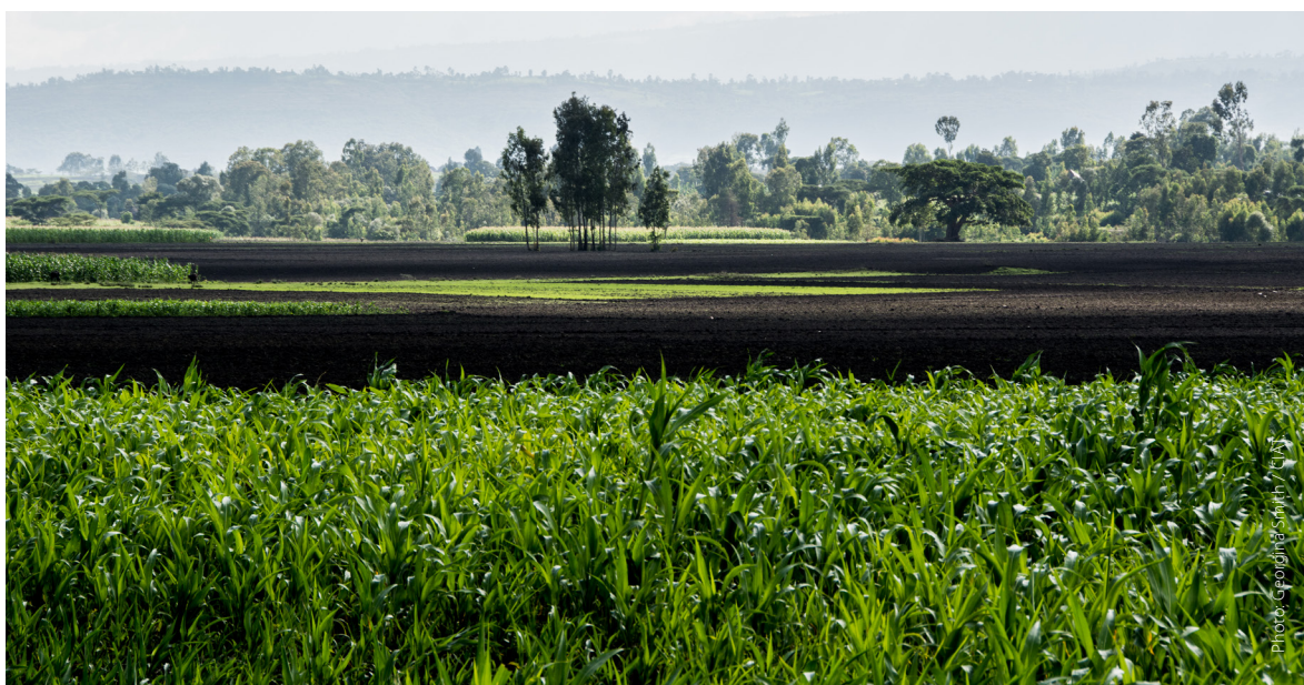
Rehabilitated landscape in Debre Berhan, central Ethiopia.

increasing demand (Abate et al. 2015). Despite the rapid yield growth, our research results (van Ittersum et al. 2016) show that considerable opportunities still exist for further yield increase. Yield levels in Ethiopia are still much lower than those achieved in other parts of the world, such as United States and Argentina. The water-limited or rain-fed yield potential of maize in Ethiopia is very high with an average value of 12.5 t/ha. It ranges from over 18.1 t/ha in western Ethiopia to 6.2 t/ha in eastern Ethiopia. Water-limited yield potential assumes crop growth under rain-fed conditions with perfect crop management that avoids limitations from nutrient deficiencies and reductions from weeds, pests, and diseases. In regions of the world with highly productive agriculture, yields can reach 80 percent of the water-limited yield potential; further yield increases are typically not beneficial from an economic point of view nor desirable from an environmental perspective due to diminishing returns to inputs.