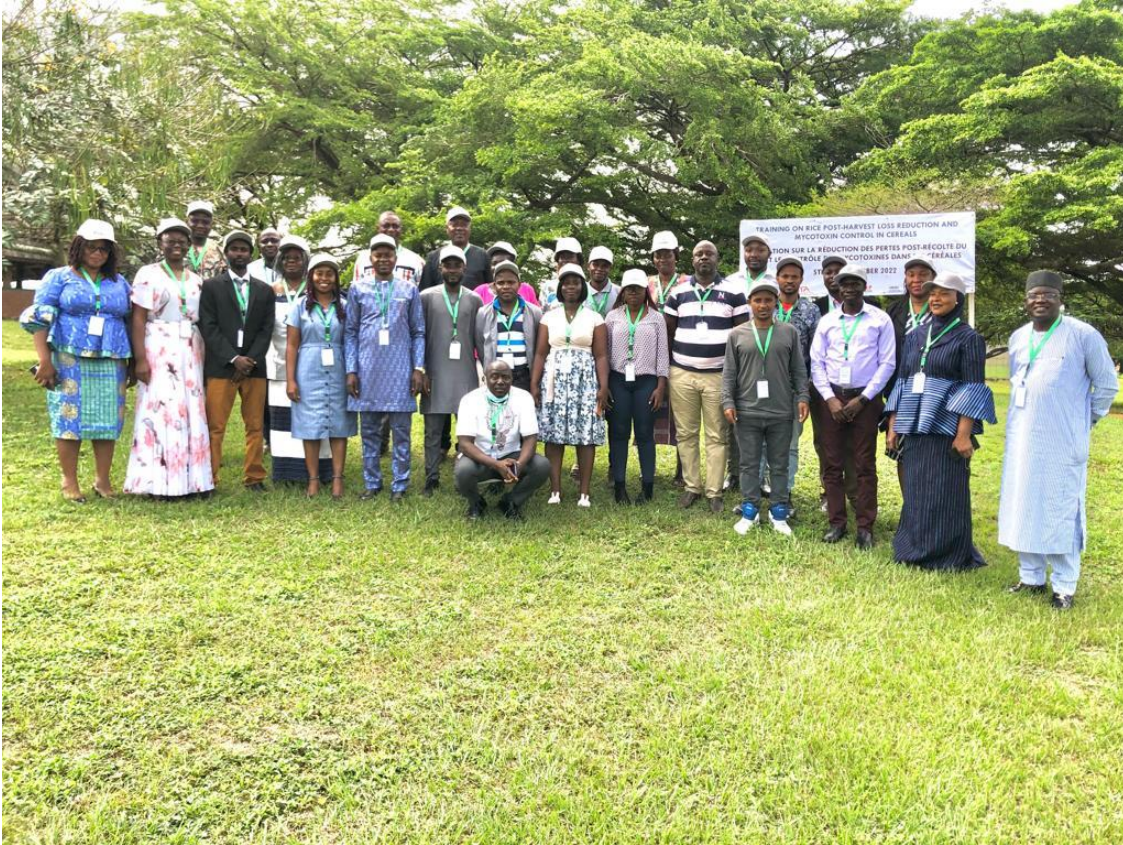
Figure 1. Group photo of participants on the first day of training at the Mbe Station, Africa Rice Center, Bouake, Cote D'Ivoire.

This was followed by the group photo and the first coffee break that lasted for 20 min.