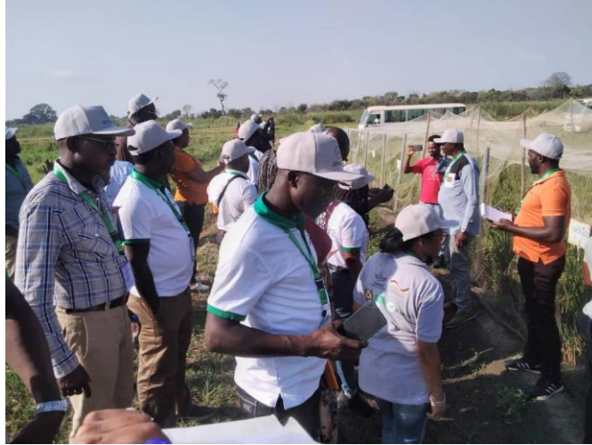
Photo 4: Visit to the demonstration plots for hundreds of rice accessions for quality analysis