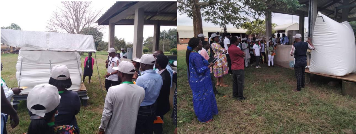
Photos 3: Presentation of storage cocoon and low temperature storage technologies