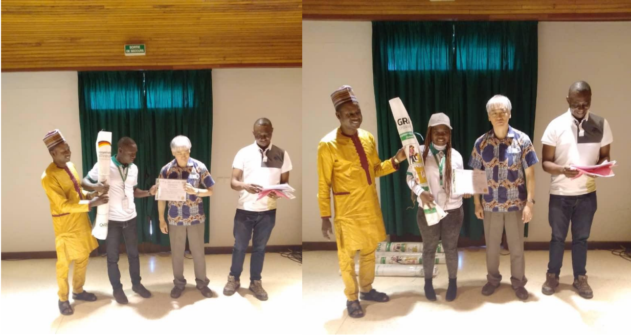
Photo 2: Presentation of Certificate of participation and hermetic bags