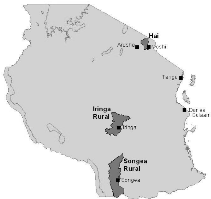
Figure 1.1—Study areas for trader and farmer surveys in Tanzania