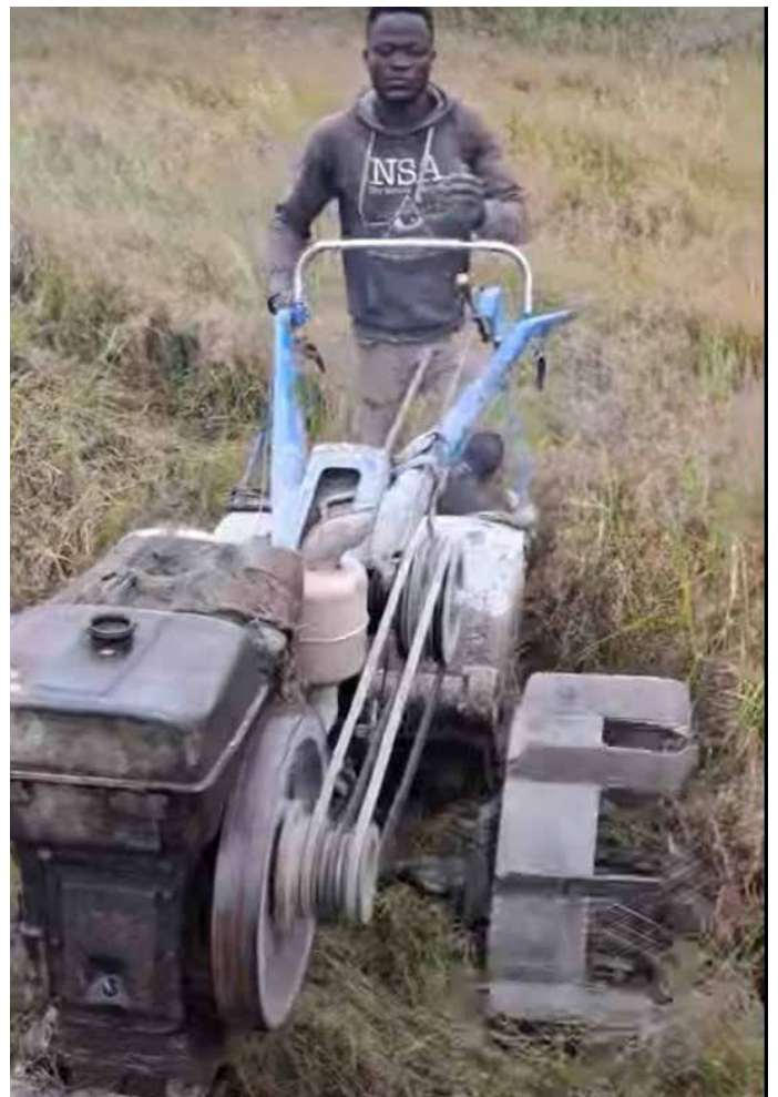
Land preparation with different equipment (photo: Adebayo Oke).