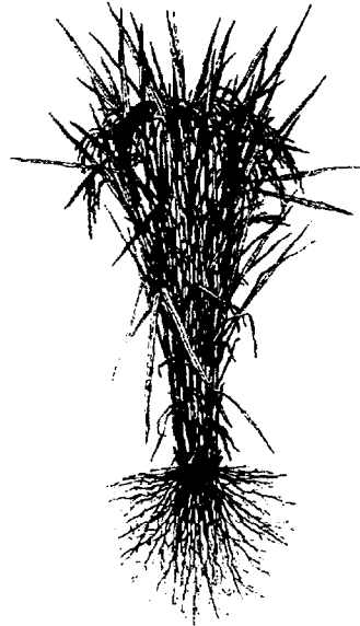
Improved High Yielding (Modern Rice)