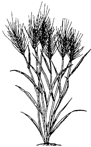
Wheat Modern semidwarf variety