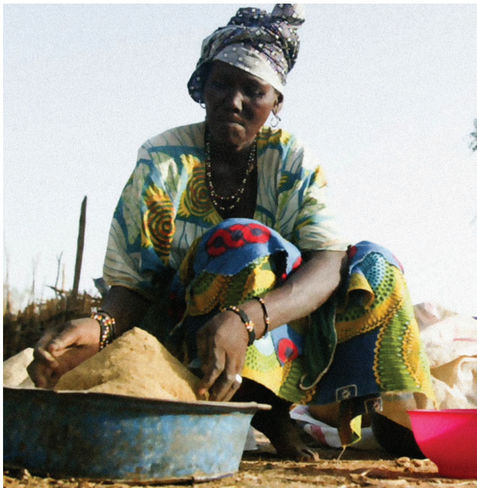
A MILLET BRAN SELLER AT A FEED MARKET NEAR NIAMEY, NIGER.

Although women actively participate in most activities along the fodder value chain, proceeds from the biomass produced were found to be unequally distributed. A greater portion of the benefits were usually reaped by men. Sometimes the proceeds from the sale of fodder biomass are partly reallocated to buy food for household consumption. However, the research also identified a collaborative, biomass production decision making relationship between men and women within the household. When fodder biomass originates from plots of land that have been specifically allocated to a woman by the male head of household, the woman usually then decides what to do with it and the proceeds from any sales.