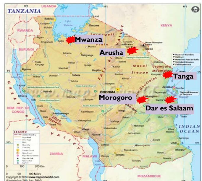
Figure 1. Map of Tanzania showing sites of the study

The study was undertaken at MoreMilkiT sites and other selected regions in the sub-humid and highland areas of Tanzania, (Figure 1)