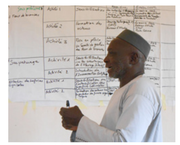
Photo 4: CAHIP member summarizing priority constraints and suggested interventions in Farakala, Sikasso.