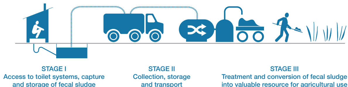
FIG. 1. SUSTAINABLE SANITATION VALUE CHAIN