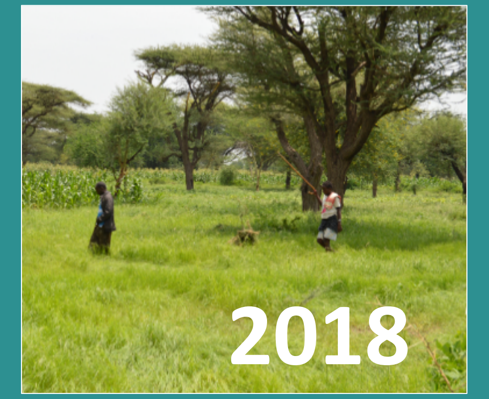
Harnessed the Taught pastoralists highland floods farming skills