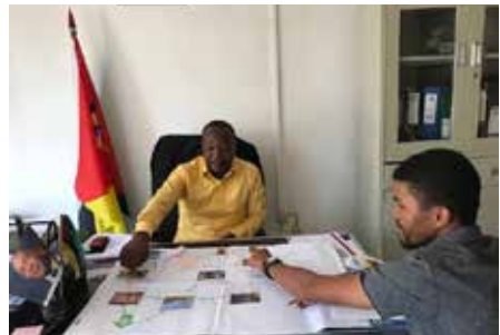
Farmer and government representatives illustrating their perception of change in the stakeholder network.