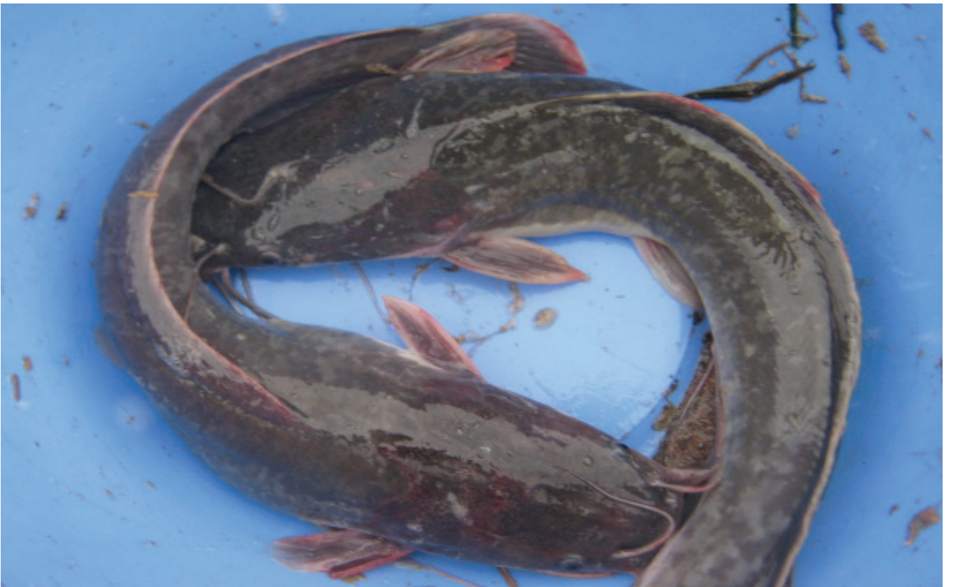
Catfish produced at the plant.