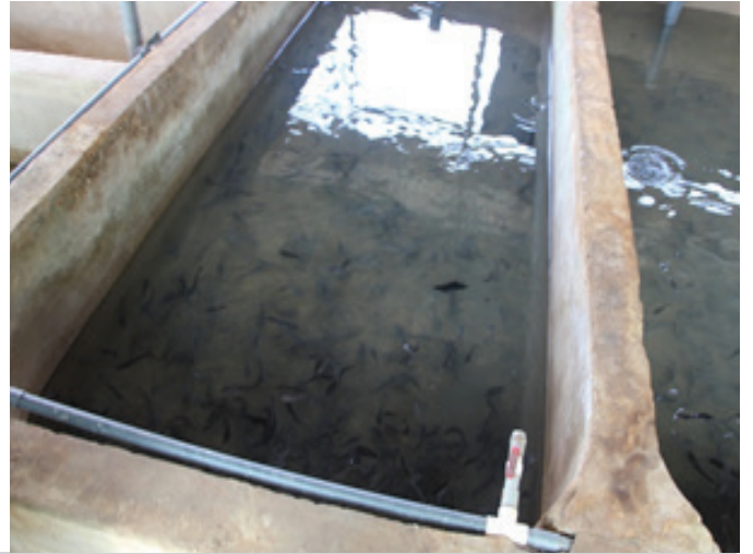
The rearing of fingerlings in basins.