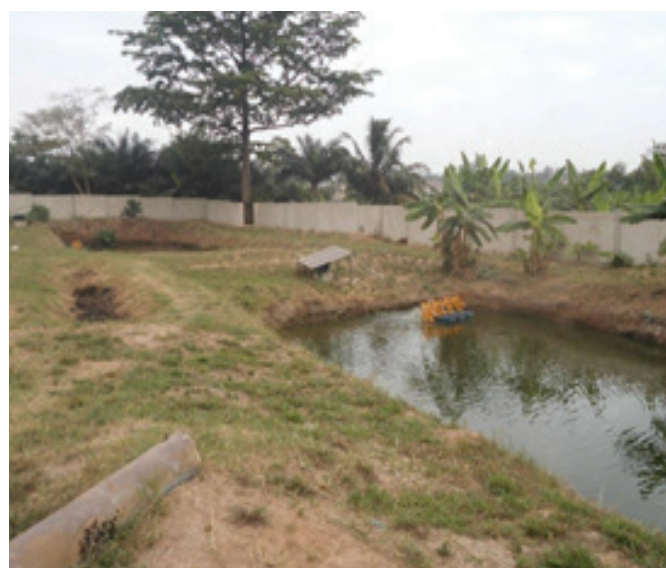
The Chirapatre wastewater treatment plant after the CapVal project. The ponds for wastewater treatment (including solar-powered aerators to enhance biological treatment performance before being used in aquaculture.