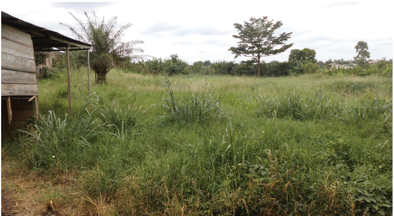
The Chirapatre wastewater treatment plant before the CapVal project.

Chirapatre Estate in Kumasi (Ghana) has a population of about 1,800 inhabitants and the community is served by networks of sewer lines terminating in a community waste stabilization pond (WSP) system receiving residential wastewater for treatment. The WSP is one of the five separate small-scale sewerage treatment systems currently existing in Kumasi. Over the years, the maintenance of this facility has been a challenge for the Kumasi Metropolitan Assembly (KMA) due to inadequate funds, resulting in environmental pollution and causing inconvenience to the people of the Chirapatre suburb.