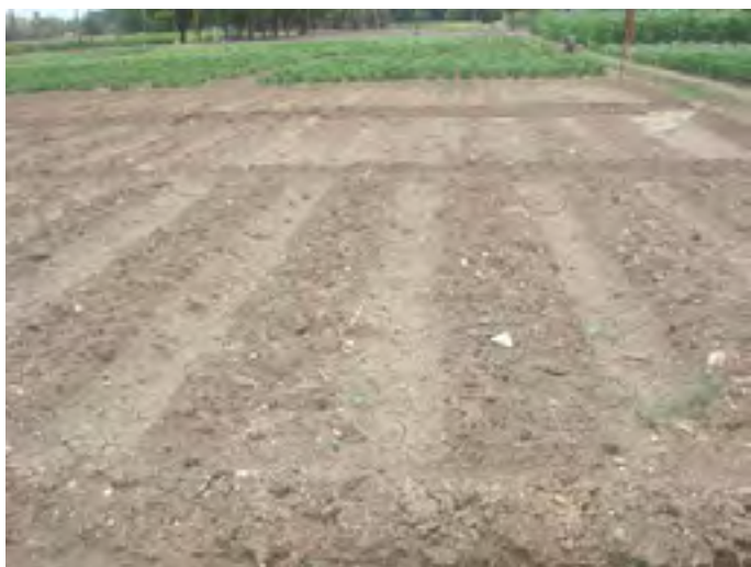
Broad beds and furrows ( http://www.agritech.tnau.ac.in/agriculture/agri_majorareas_watershed_watershedmgt.html )

The field furrows are blocked at the lower end. When one furrow is full, the water backs up into the head furrow and flows into the next field furrow. Broad beds, where the crops are grown and which are about 170 cm wide, are planted between the field furrows. They are similar to infiltration ditches.