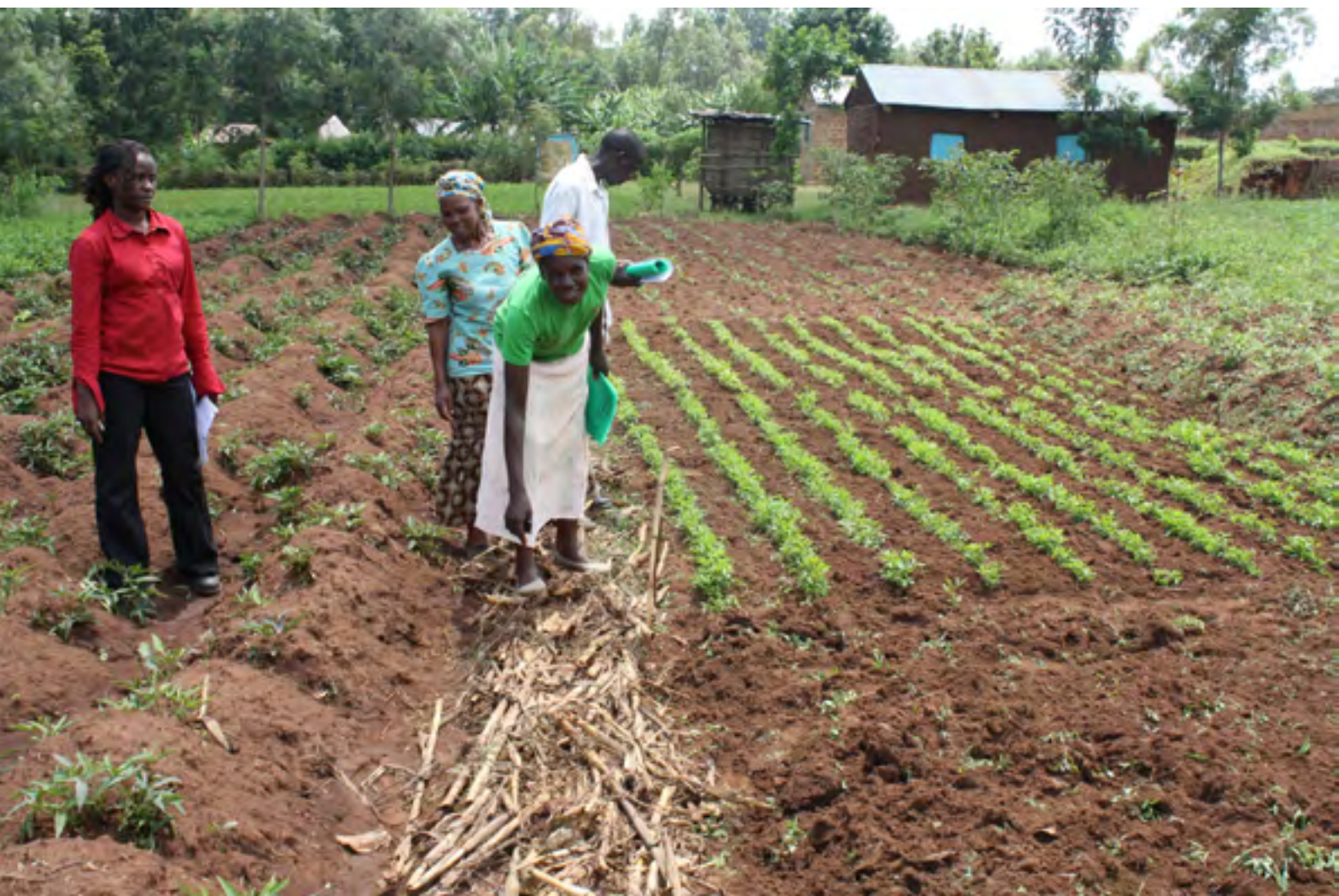
Trash lines in Kenya