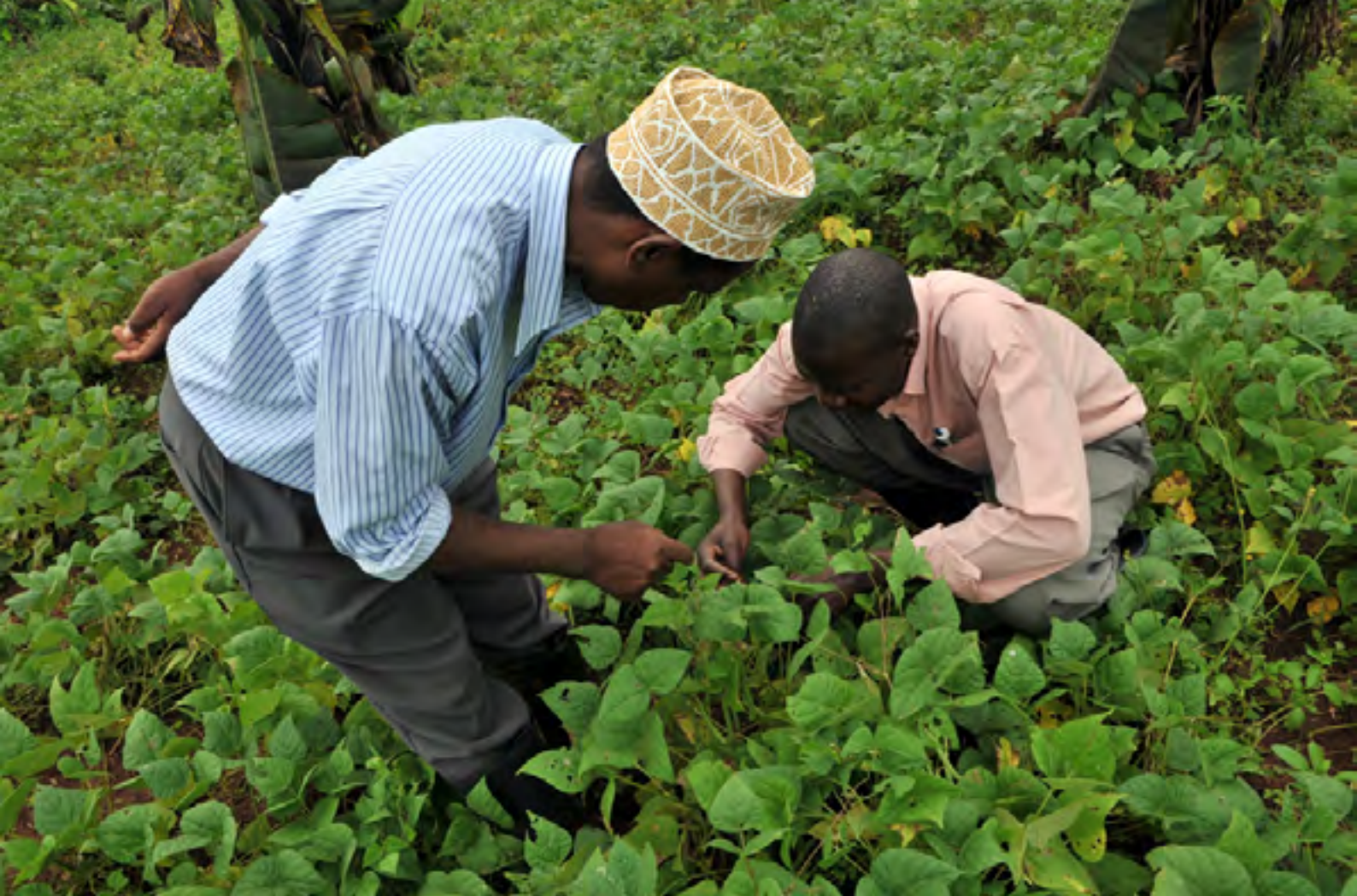
Assessing bean pests and disease in Uganda