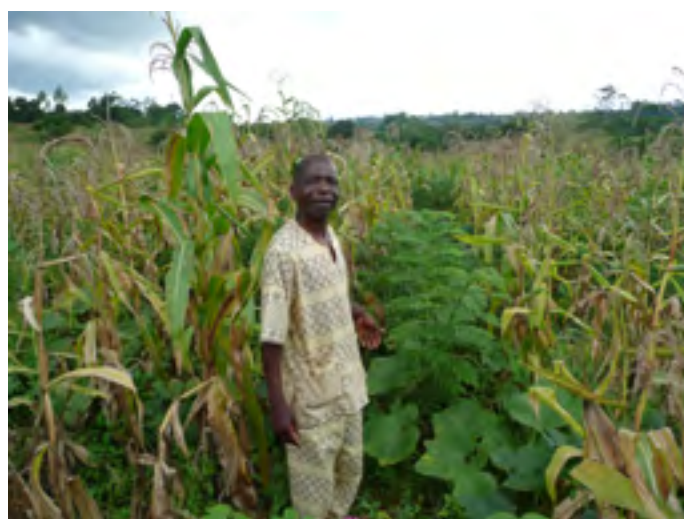
Nitrogen-fixing tree species planted within maize crops

This is the targeted use of a fast growing tree species to obtain the benefits of a natural fallow. Nitrogen fixing trees and shrubs are planted with the main aim of improving nutrient input into soil. They fix nitrogen and add organic matter to the soil. The practice is common where land is regularly fallowed especially in semiarid areas. Nitrogen fixing trees and shrubs include Sesbania sesban , Markhamia lutea (siola), Calliandra calothyrsus , Casuarina equisetifolia (whispering pine), and Leucaena leucocephala (Lusina).