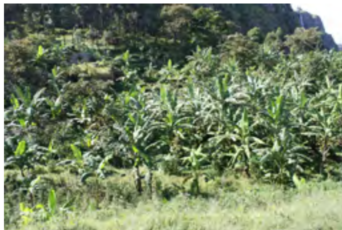
Banana trees above coffee crops in Mbale, Uganda

This practice involves growing shade tolerant crops such as coffee, tea and beans under trees such as Grevillea robusta , Cordia abyssinica , Faidhebia abyssinica , and Cordia Africana . The crops in most cases are plantation crops. The focus is on perennial components such as coffee tea which produce high value products. Trees provide microclimate conditions suitable for the growth of the tree species.