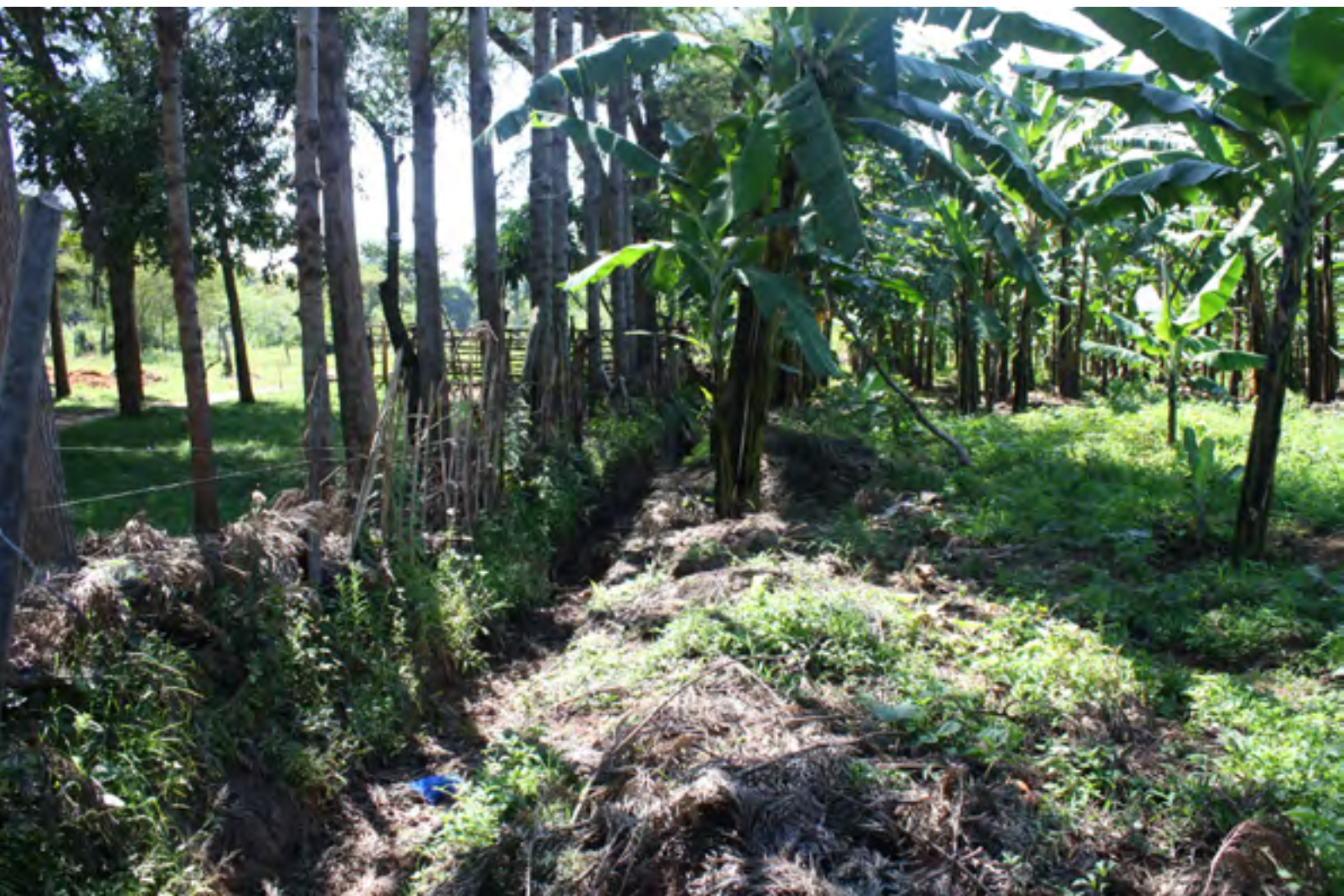
Infiltration ditch in Kenya