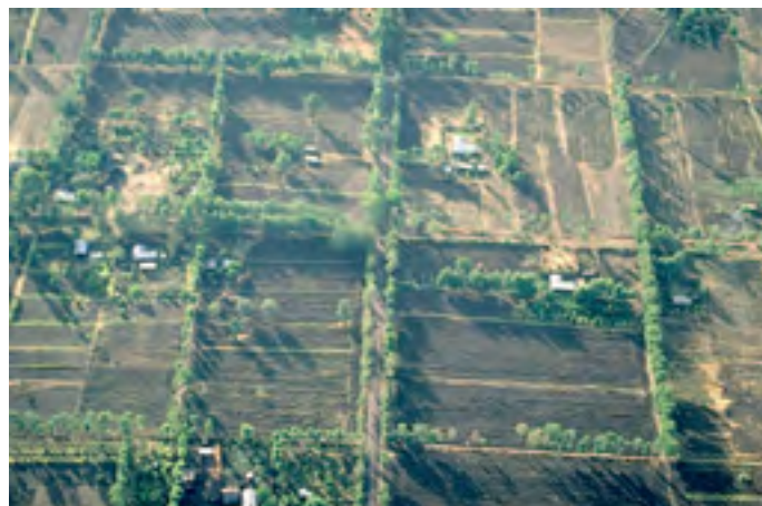
Boundary planting between small-holder plots

This involves planting trees on farm boundaries. It requires agreements between the neighbors involved to avoid conflicts due to the shading effects of the trees.