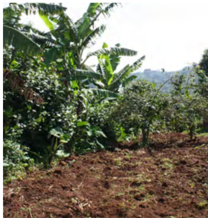
Incorporating leafy plants into soil

A windbreak is a plantation usually made up of one or more rows of trees or shrubs planted in such a manner as to provide shelter from the wind. Well-designed windbreaks (i.e. not too dense) not only reduce wind speed but increase humidity and reduce loss from the soil.