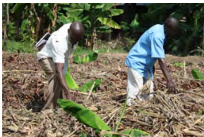
Planting banana trees in pits

Planting basins improve water use efficiency by the crops due to increased rates of water infiltration into the soil, which can improve crop yields and the increase the intensity of agricul-