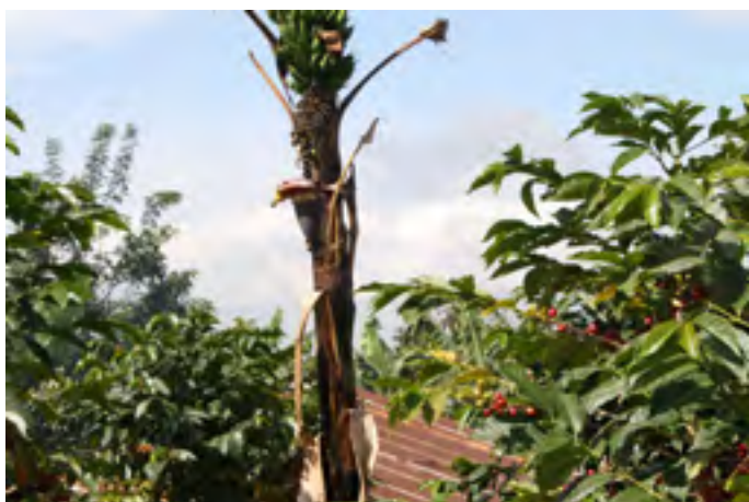
Banana trees and coffee plants grown together