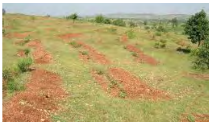
Contour bunds ( http://www.wesnetindia.org/photo_gallery.php )

A series of small mounds are placed along the contour of a slope to retain water, reduce erosion, and prevent flooding.