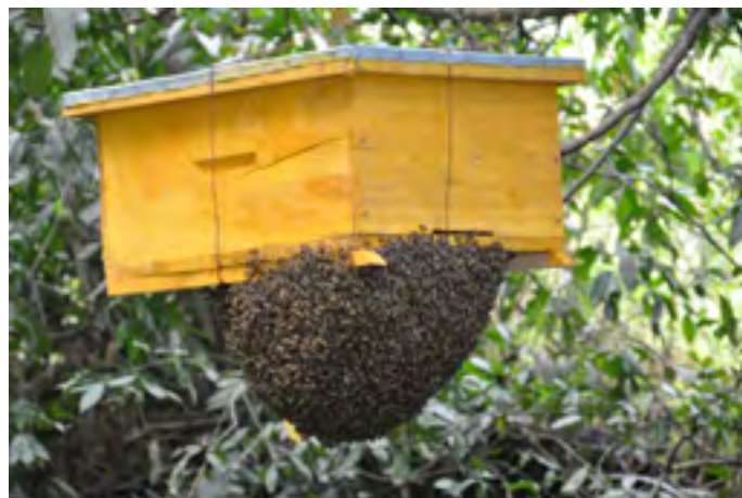
Bees colonizing a hive

Apiculture is the art and science of raising bees. It is an agro-forestry technique with untapped potential and a quick investment pay back. Beekeeping has traditionally been practiced in Kenya. Over 80% of honey produced locally still comes from traditional hives. There is a need to embrace modern technology, such as the use of modern beehives like Langstroth and Kenya Top bar hives, in beekeeping.