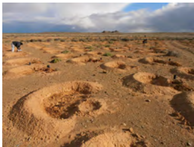
Half-moon micro-catchments ( http://www.ewt.org.za/programmes/RRP/riperian.html )

These catchments are made by digging pits and then using the soil to construct a semi-circular mound with the tip facing uphill. The pits are filled with manure and are often used for harvesting tree seedlings. They help keep moisture and improve soil fertility on sloped areas.