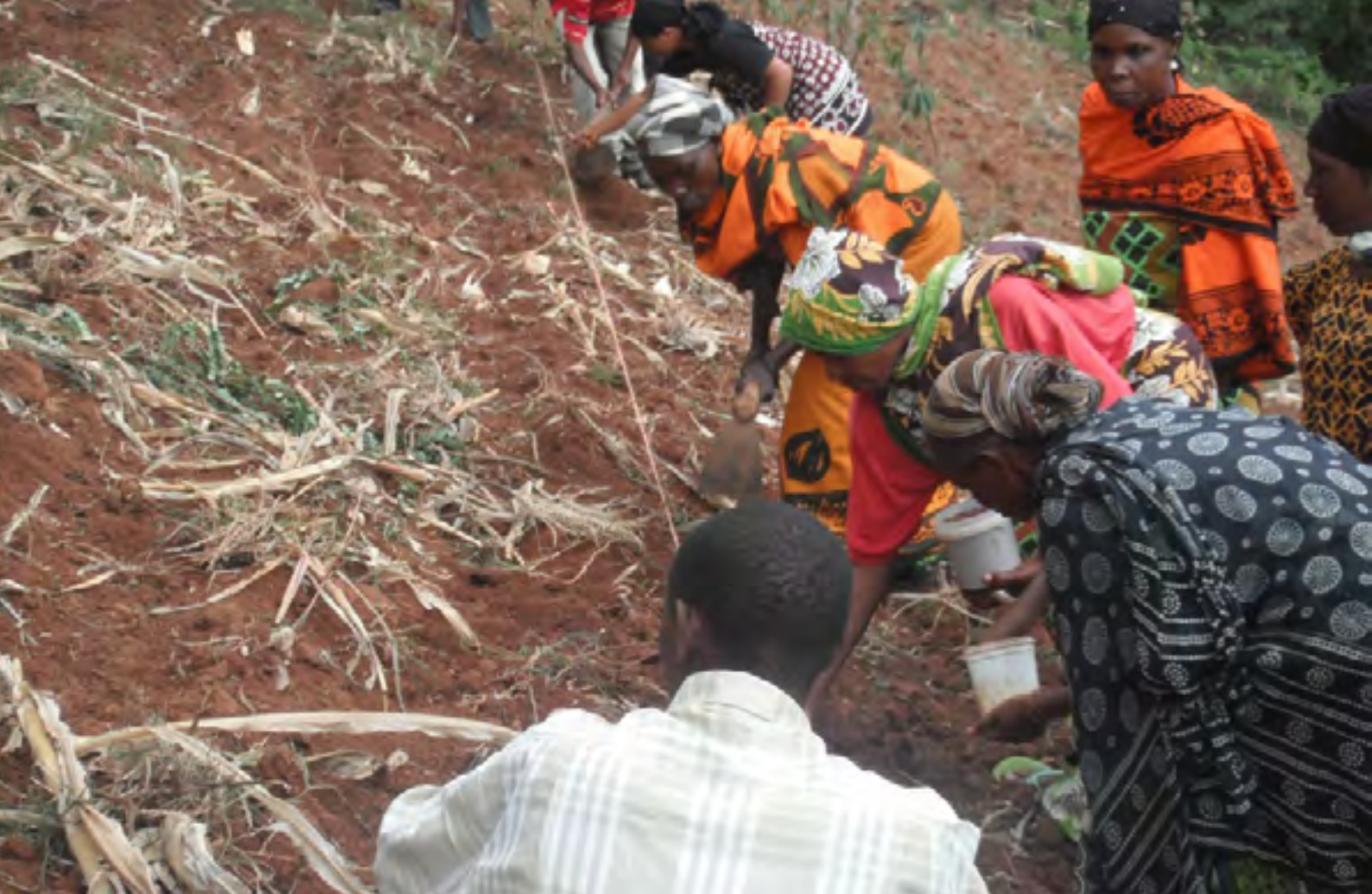
Demonstration of precise fertilizer application on small smallholder farm at planting