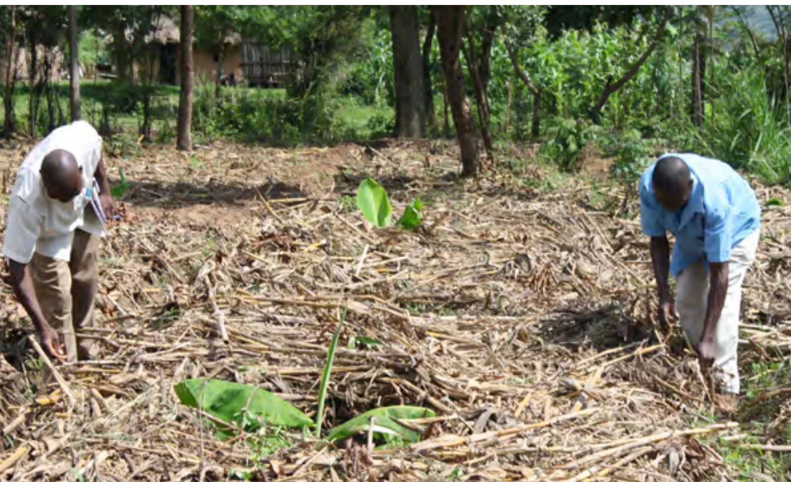
Mulching around banana crops

Mulching can improve the productivity of the land (i.e. crop yields) by making conditions more favorable for plant growth, i.e. conserving soil moisture, improving soil fertility and reducing soil erosion.