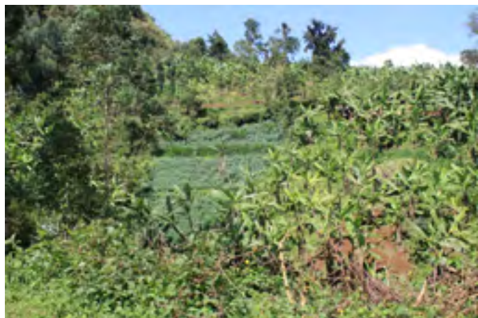
Trees planted on the slope of a hill to control erosion

The effectiveness of the vegetation strips depends on the: