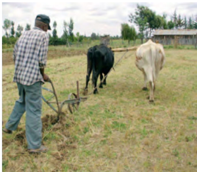
Conservation tillage (H. Liniger)