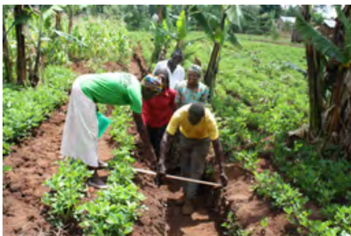
Digging a drainage channel

Diversion ditches and drainage channels remove excess water from the land. Diversion ditches and drainage channels can increase yields in flood-prone zones due to increased water drainage. By facilitating good aeration of the soil, they can also help avoid emission of N 2 O gas.