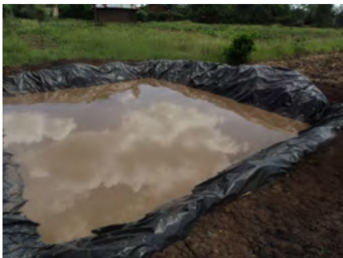
Water pan lined with plastic

A water pan is a shallow hole that collects and holds runoff water. Sometimes the pans are lined with plastic to prevent water loss.