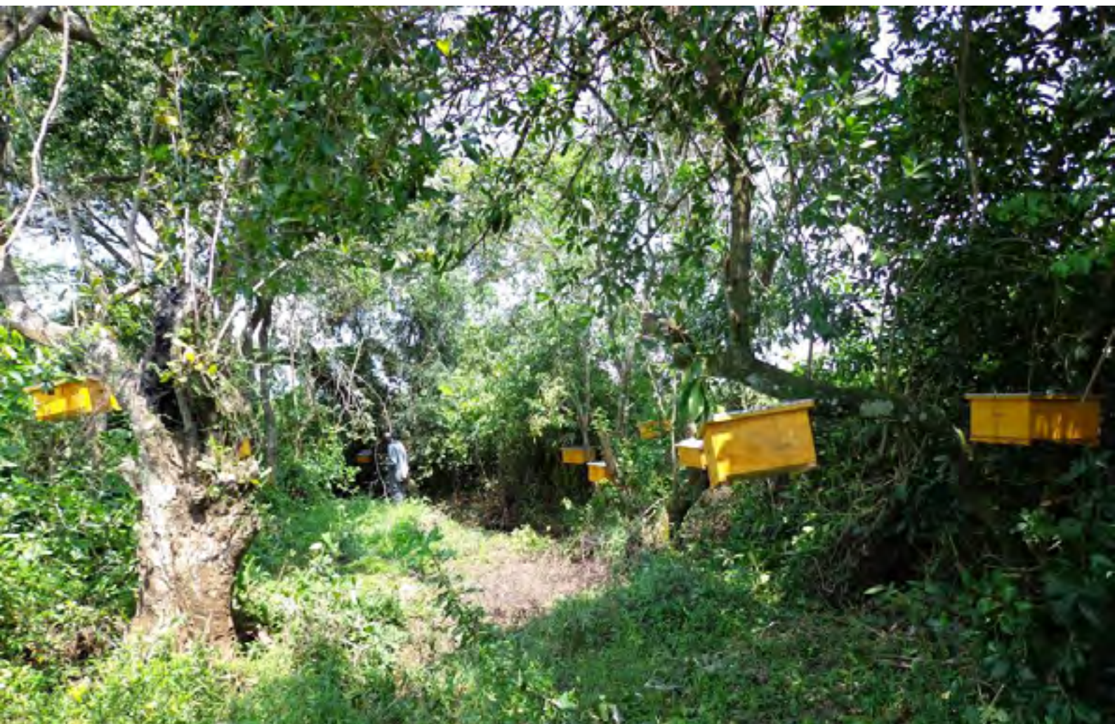
Bee keeping in Kenya