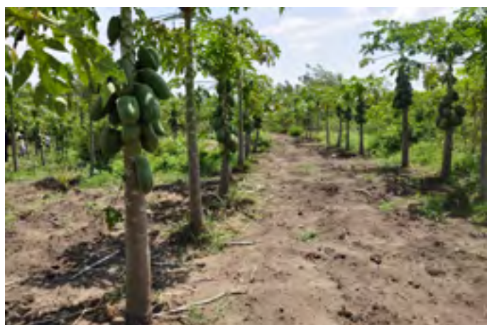
Trees on cropland

Trees may be grown in fields while crops are grown alongside or underneath. The practice of growing trees in this way can be done either by protecting and managing the trees that are already there or by planting new trees.