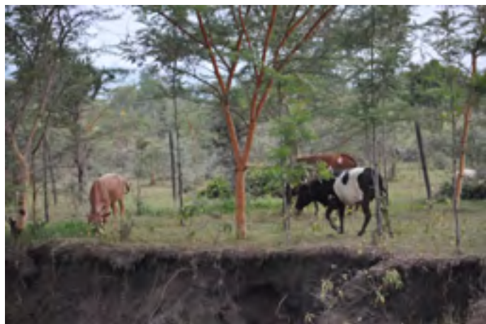
Woodlot in Kenya

Woodlots are an area on the farm set aside specifically for wood production. Woodlots may include a single species or a mixture of several species. Woodlots can also be useful for beekeeping by providing flowers for nectar. Examples of woodlots commonly planted by people in Kenya include: Casuarina , Sesbania , Gliricidia , Grevillea and Markhamia species.