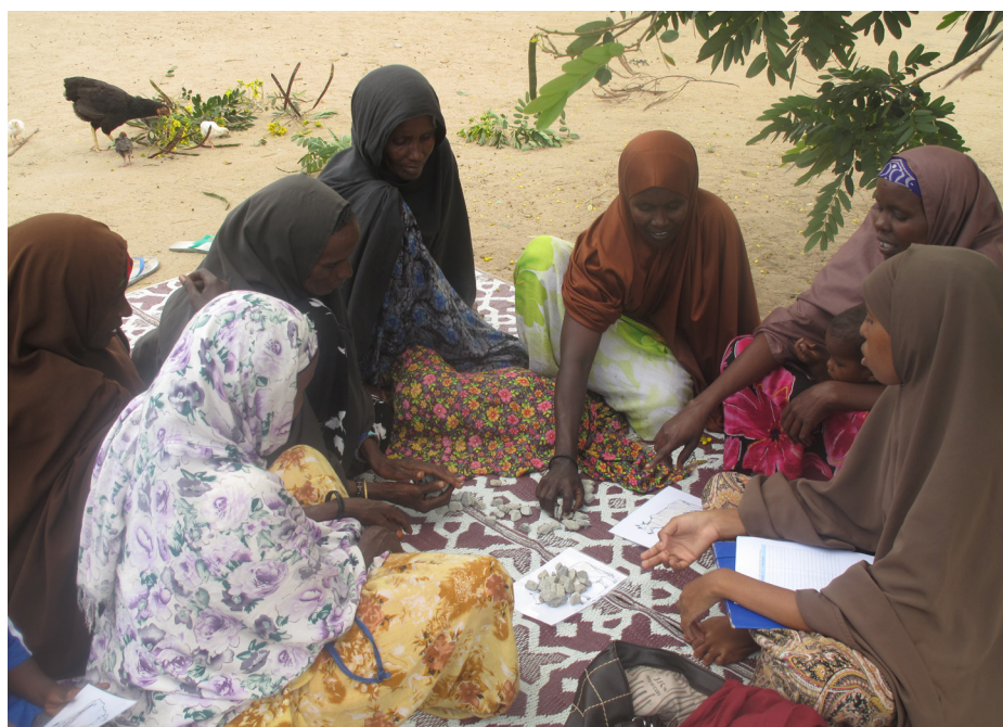
Women focus group discussions in Bodhai division

The preferences of men and women livestock keepers regarding the new CBPP vaccine will be integrated into the vaccine development process and its delivery. These will be determined through a household survey to be carried out in February 2014, which will establish the gendered preferences and the willingness to pay for the new vaccine. The survey will also establish farmers' preferences on timing and frequency of vaccination, whether elective or compulsory and whom to deliver the vaccine, so that women gain maximum benefit from the product. The success of the vaccine's roll out in the study area will act as a pilot for its introduction to other areas where the disease is endemic, both in Kenya and other African countries.