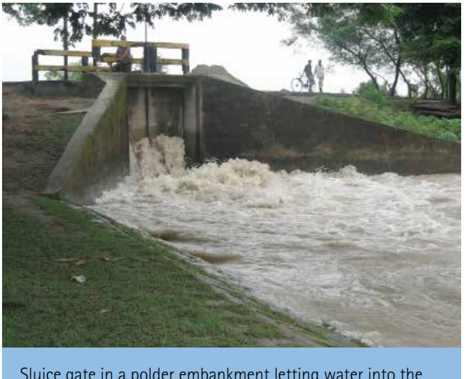
Sluice gate in a polder embankment letting water into the khal for irrigation

improved. In 2008, the polders supported a total population of 8 million people<sup>[2]</sup> living on the 1.2 million hectares of land within 139 polders across the coastal zone.