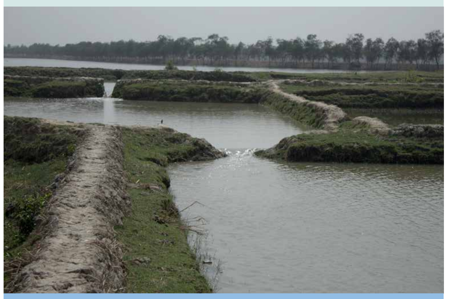
Poor maintenance and informal water intake pipes result in damaged embankments, roads and severe flooding.