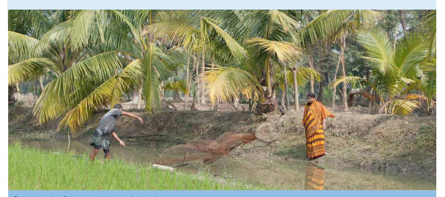
Fishing in a rice-fish system in a low salinity region