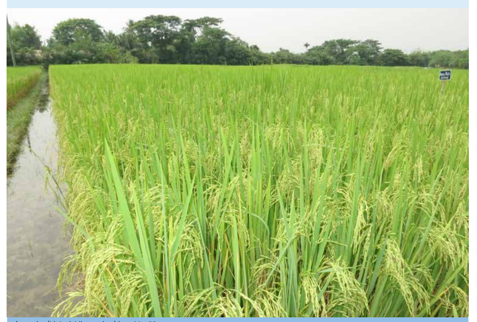
Aman rice (high yielding variety) in polder 30