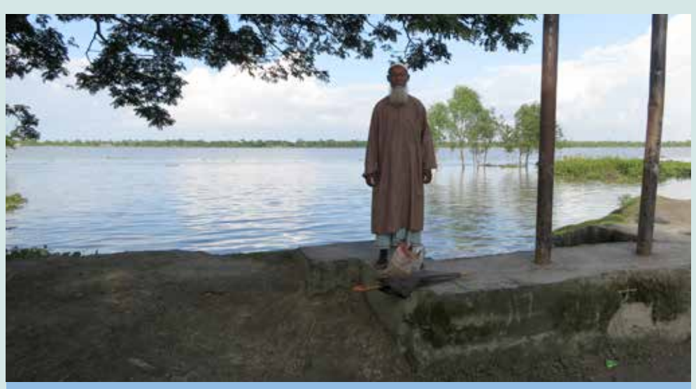
Farmer standing on sluice gate, the river behind him at high tide.