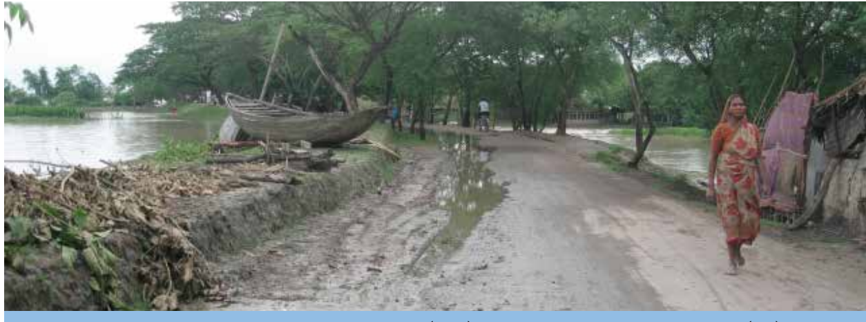
Polder embankment protecting the lands inside the polder (right) from flooding by the river at high tide (left).

also responsible for routine and minor maintenance of the water infrastructure, whereas implementing agencies are supposed to support major maintenance requirements.