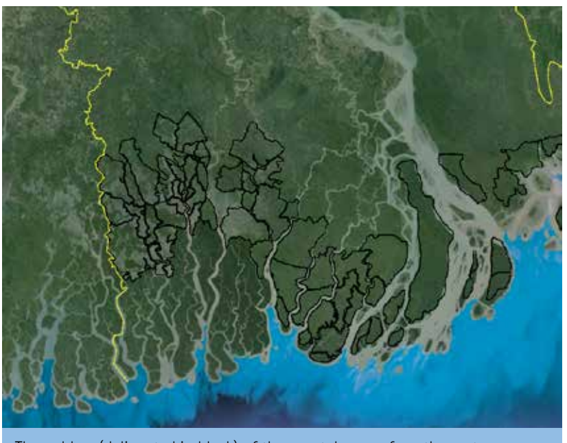
The polders (delineated in black) of the coastal zone of south-west and south-central Bangladesh.

Large-scale coordinated development of well-engineered embankments and the creation of polders in the coastal zone only began in the 1960s with the implementation of the Coastal Embankment Project (CEP), driven by the need for land and food for the increasing population. The polders were designed to increase agricultural production by protecting the lands from inundation due to high tides and river flooding, but they also provide protection against typical storm surges. Polders, ranging in size from a few thousand to about fifty thousand hectares were constructed throughout most of the coastal zone, with foreign aid assistance. Sluice gates were installed in the embankments, with most gates connecting some of the larger natural channels within each polder to the surrounding rivers. This provided the ability to drain water from or bring water into the polders as needed, and additional smaller inlet structures ('flushing' pipes) were also installed. The CEP was a successful project that established standards and criteria based on the