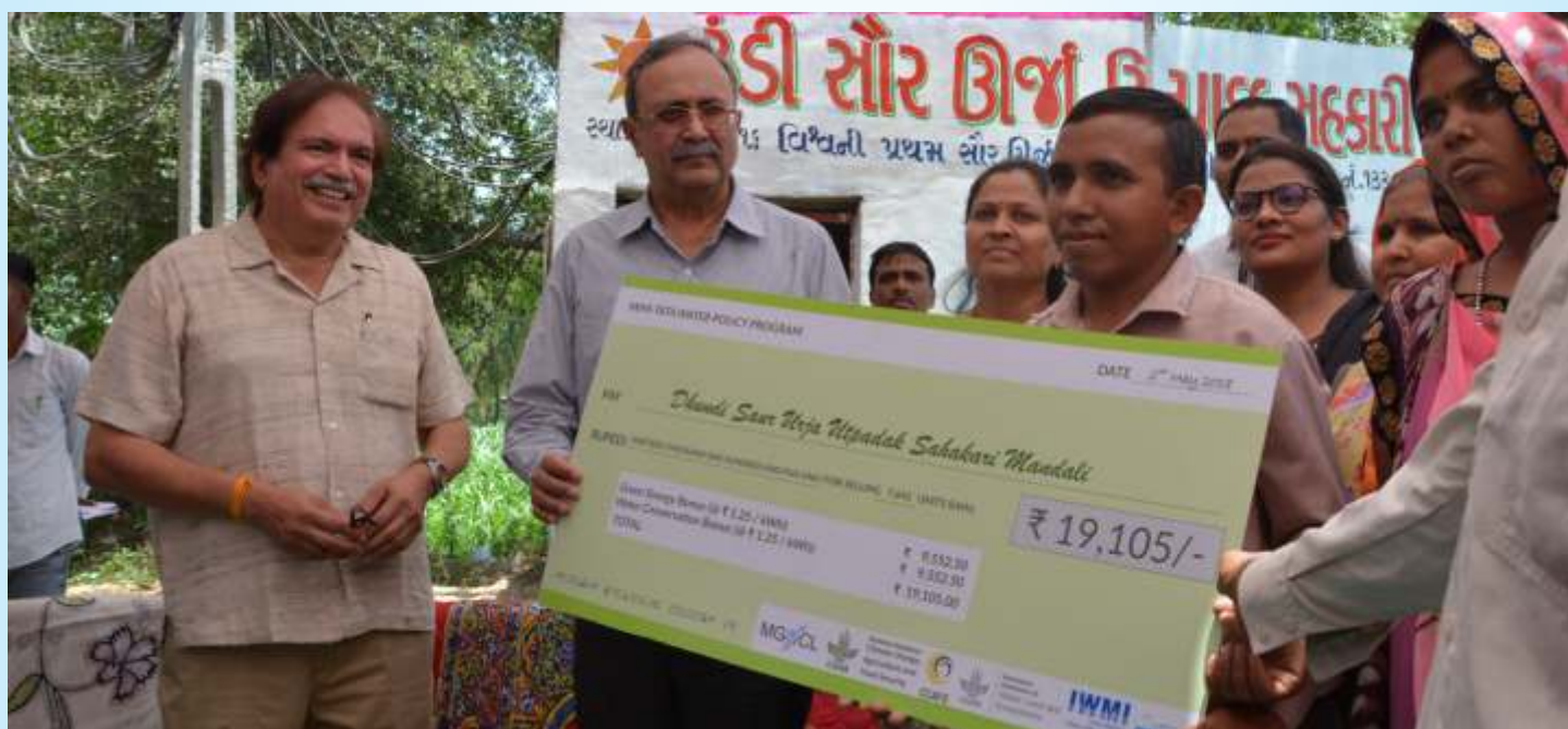
Picture1: Hon'ble Energy Minister of Gujarat, Sh. Saurabh Patel paying monthly payment to Dhundi Coop as it completes 1 st year of successful electricity sale on 2 nd May 2018

The Dhundi-pattern SPICE arguably deserves a better feed-in tariff than megawatt-scale solar power plants or even roof-top installations as solar pumps at Dhundi not only replaced existing diesel pumps but also future subsidy-guzzling electric pumps. Megawatt-scale solar plants require large public investments in transmission, whereas in the case of Dhundi, the micro-grid was erected by farmers at their own expense and energy is being