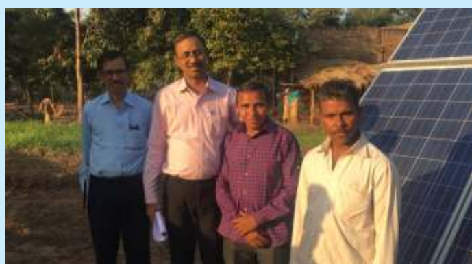
Picture 2: Director at Ministry of New and Renewable Energy (MNRE) at New Delhi, Sh. J.K. Jethani visited Dhundi and met the members of the Dhundi Coop.

generated much closer to where it will be used. When replicating the model in a village having electricity network for farm power, the existing infrastructure can be used. Rooftop solar plants will ultimately deprive electricity utilities of income from their highest-paying consumer segments. The Dhundi SPICE, on the other hand, liberated MGVL and the state government from debilitating farm power subsidies. The average agriculture electricity consumption in the central Gujarat region served by MGVL 3 is 830 kWh per HP of installed capacity 4 , which translates into a subsidy of ₹3,154/HP/year considering the tariff charged to be ₹0.70/kWh against the cost to serve of ₹4.50/kWh. If Dhundi farmers were using the subsidized electricity, MGVL would have had to bear a subsidy of around ₹170,000 annually; in addition to the capital expenditure of ₹1,350,000 on poles and cables for connecting tubewells to the grid, at ₹150,000 per new connection. One can take the annual interest and depreciation cost on this investment at a conservative 10 per cent or ₹135,000.