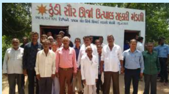
Picture 3: Farmers participating in SKY scheme visit Dhundi to understand the SPICE model

There is a lesson to be learnt here. State governments until now have promoted solar irrigation pumps by offering around 80-90 per cent subsidy on capital costs to farmers who opt out of grid power connections. A better way to promote solar pumps could be through PPAs that guarantee attractive feed-in tariffs to farmers for replacing their existing subsidized grid connections. The capital cost subsidy can easily be scaled down to 30 per cent (central assistance through MNRE), and farmers could be offered ₹3.50/kWh as base tariff for 25 years which can be topped up by an additional ₹3.50/kWh as an 'Evacuation Based Incentive' (EBI) for initial few years to aid loan repayment by farmers. In fact, government and DISCOMs would be better-off solarizing electric tubewells even if farmers are unwilling to surrender their grid connections but agree to being net-metered at the base tariff. Under such an arrangement, farmers will have access to solar energy during the day and grid energy during the night; however, they will get paid only for solar energy sold net of grid power used in pumping.