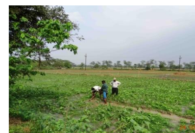
Figure 2 Farmers digging drains in waterlogged sunflower field on 25 Feb 2016