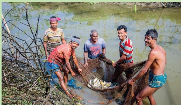
Collective fish culture during wet season (200kg/ha)