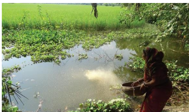
Figure 4 Distribution of supplementary fish feed (rice husk) by woman – women can be involved in fish culture as a new livelihood opportunity

The main challenge is to convince the target community beforehand, on profit sharing and yield distribution to all, including landless. There is a great potential for increased fish production as there are many suitable WMUs with canals and depressions and the fish market is well developed in this region.