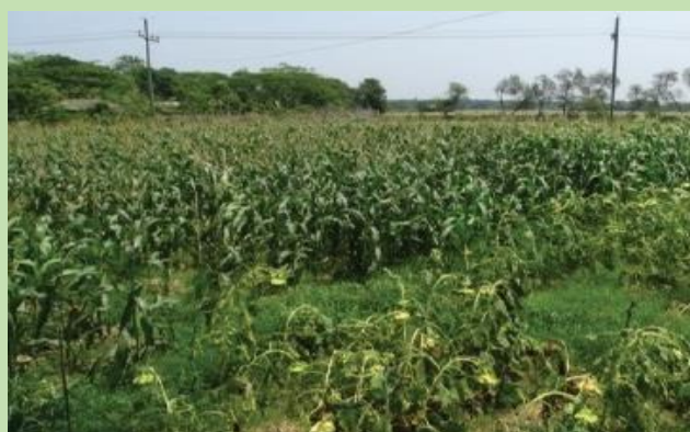
Waterlogging avoided: farmers could harvest dry season crop of maize (6 ton/ha) & sunflower (1 t/ha)