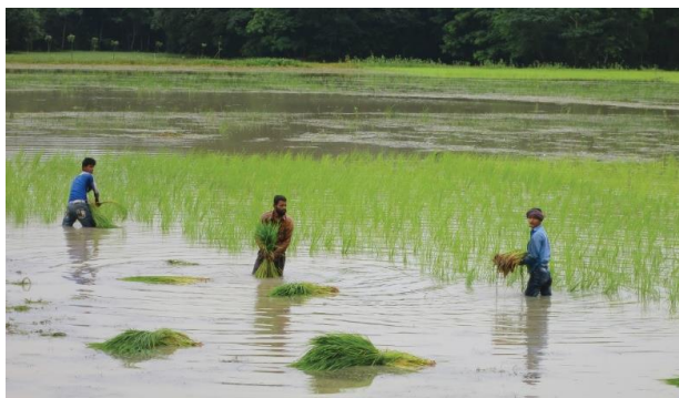
Figure 1 Traditional rice transplanting in knee-high flooded polder fields.

Farmers grow traditional rice varieties (Fig 1) during the wet season from July to December with an average 2 to 3 ton/ha yield. As fields do not dry quickly, they sow a second crop (usually sesame and mungbean) from March to June, after a 2 month fallow period. This dry season crop is often damaged by pre-monsoon rainfalls (2-3 times every 5 years). In the last 4 years, all second crops were destroyed. This research study found that poor drainage, rather than salinity intrusion, is the main cause of the poor productivity of these farms.