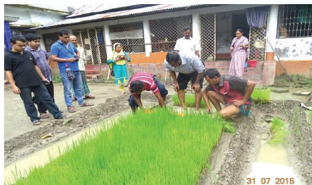
Figure 5 Rice mat nursery preparation. A potential business model for youth and women in polders adopting modern rice culture.

Women in these polders have very limited livelihood opportunities because of heavy homestead workload and societal norms that restrict their engagement in public life (eg marketing produce is seen as socially unacceptable). Young men are now reluctant to work in agriculture migrating out of their villages and causing labour scarcity.