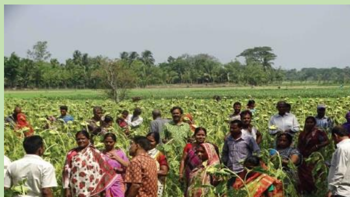
Successful community management