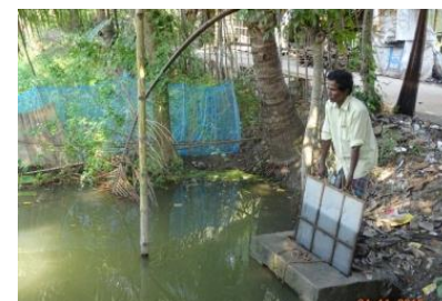
Fig 3 Managing water level in WMO4 for HYV aman rice culture

From 60% land with over 40mm water depth to less than 20%