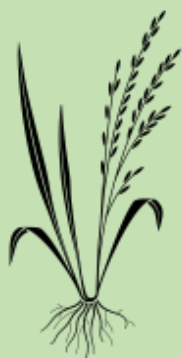
Early maturing HYV rice (4 to 5.5 ton/ha): 2 more tons of rice per hectare compared to the traditional way