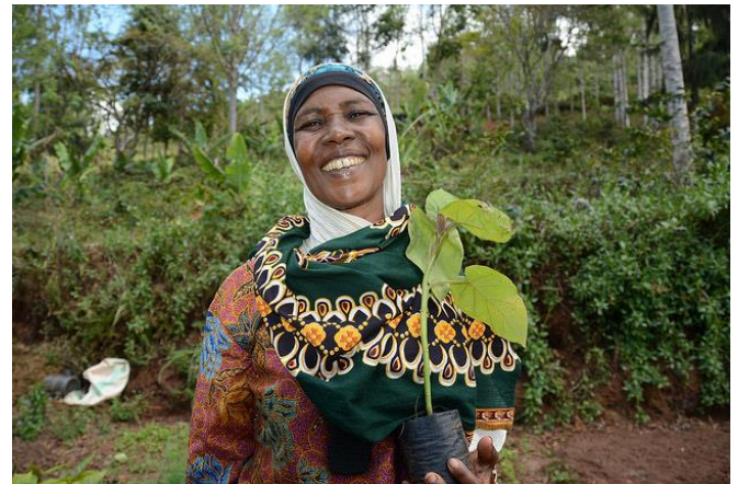
Farmers in Lushoto now have access to tree seedlings and are embracing better land management practices.

improved land management. In 2011, only 59% of households reported to have made some tree and agroforestry management related changes and only 22% were producing or purchasing tree seedlings. This has since changed significantly after the establishment of three tree nurseries; each under the management of umbrella SACCOs, with a combined capacity of producing over 150,000 tree seedlings within six months. The varieties planted were developed through research by the World Agroforestry Centre (ICRAF) and the Tanzania Forestry Research Institute (TAFORI). By integrating trees on-farm, Lushoto farmers are diversifying their livelihoods and are responding to a policy by the Lushoto District Council of a 10% tree cover on all farms.