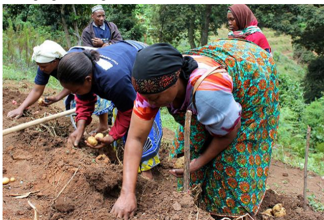
Farmers in Lushoto during participatory testing of resilient potato varieties.

Since 2011, the CGIAR Research Program on Climate Change, Agriculture and Food Security (CCAFS) has facilitated a partnership around collective action in seven villages in Lushoto. The partnership integrates a science approach based on a climate-smart village (CSV) model that focuses on improving local knowledge of climate risks to inform farming decisions. The goal is to respond to climate variability, reduce periodic hunger, ensure food security and improve household incomes. It involves participatory testing of resilient agricultural technologies, training to build the knowledge and capacity to change local practices and improve planning for adaptation to changing farming conditions.