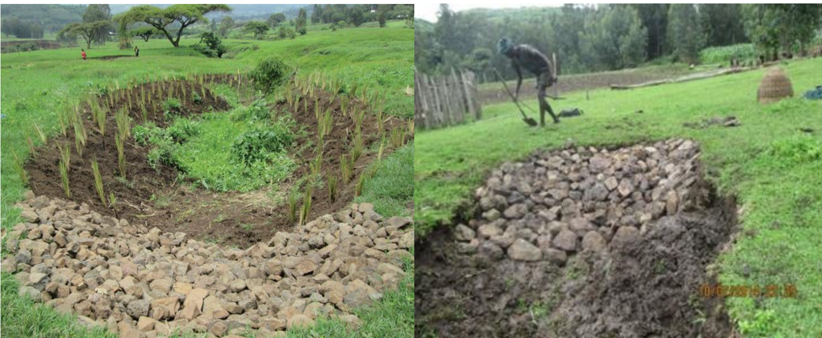
Picture 2: Gully head treatment using stones of different diameters

The CGIAR's WLE program through 'Sustaining land management interventions through integrating income generating activities, addressing local concerns and increasing women participation' project is supporting IWMI and national partners to: (a) identify incentives that can support farmers to adopt long-term conservation approaches; and (b) provide empirical evidence related to the impacts of restoration programs on ecosystem services and on the role of incentives to sustaining long-term conservation approaches. The project is using ecosystem-based approaches to guide restoration of degraded lands. It has integrated a gender-based approach to incentivize women and landless youth participation in the interventions.