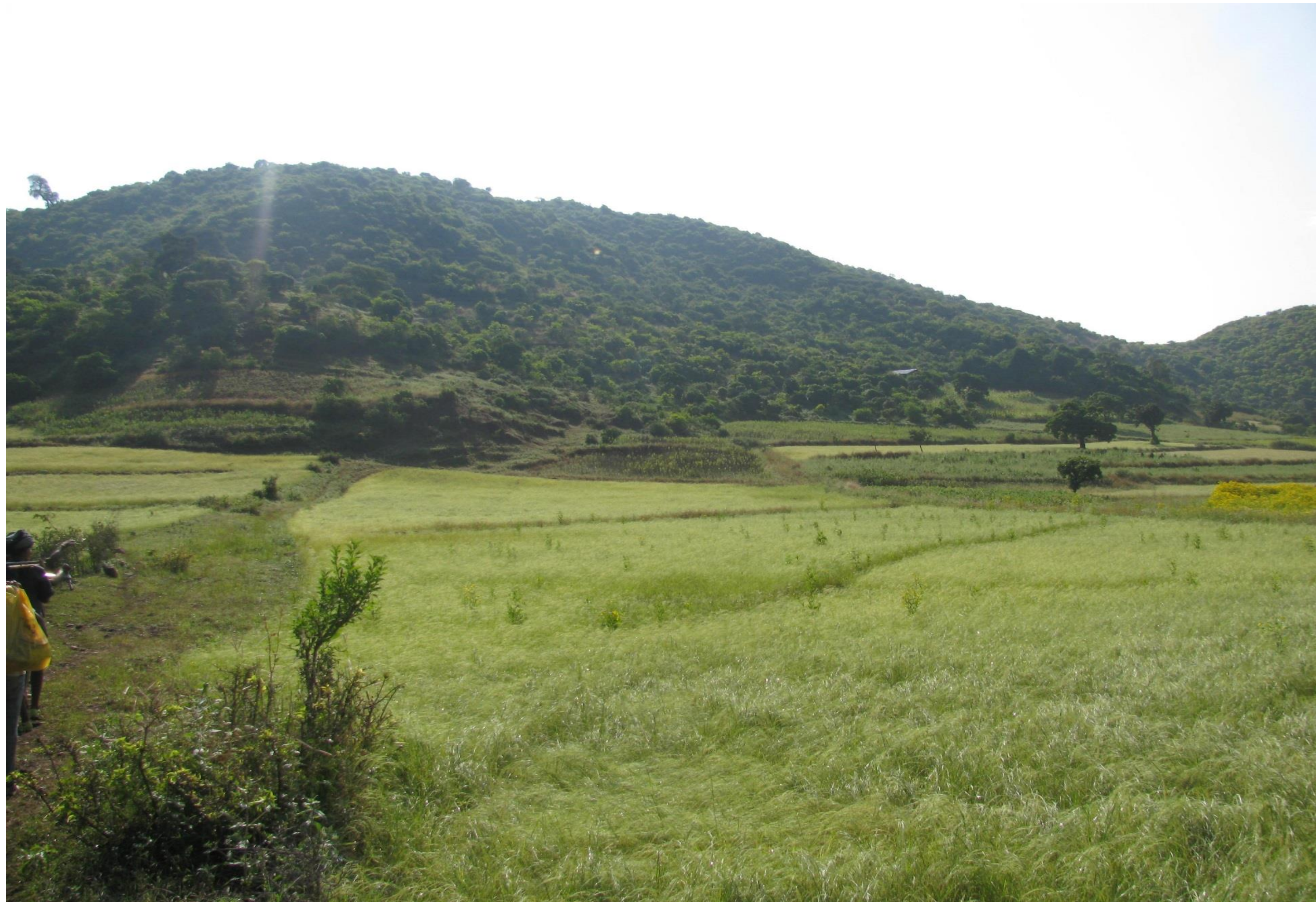
Picture 1: Exclosure established on uphill and SWC measures in agricultural lands

Since 2010, the government of Ethiopia in collaboration with the local communities has implemented the establishment of exclosures and construction of Soil and Water Conservation (SWC) measures to restore degraded ecosystems throughout the country. The aim is to double agricultural productivity to contribute to the country's economy by achieving a projected GDP growth of 11-15% per year. The greatest challenge is to ensure that such interventions are sustainable.