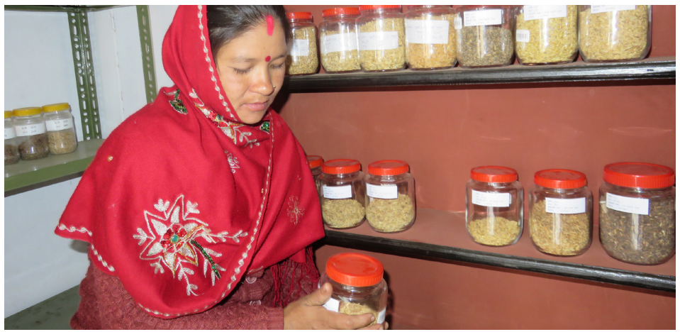
Ghanapokhara Community Seed Bank in Lamjung District.