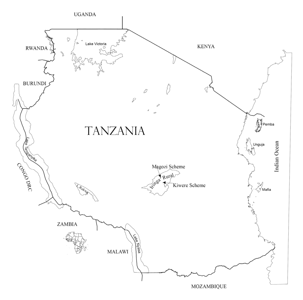
Figure 1. Location of Kiwere and Magozi irrigation schemes.

age of household heads is 46 and 43, respectively (Table 1). Agriculture, rainfed and irrigated, is the main source of income. More than a quarter of households experienced food insecurity over the last five years, while more than 90% consider themselves to be in good health.