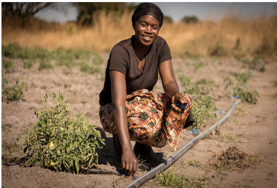
DRIP IRRIGATION SYSTEM POWERED BY SOLAR PUMPS

Lettuce, which has a very short growing cycle, offers the potential for six cultivation cycles a year in Burkina Faso under drip irrigation. Assuming adequate water supply, a 250 m 2 farm plot of lettuce grown in this way is calculated to be able to produce an annual gross income of US$ 2,581. Tomatoes grown on the same plot size, with three potential cultivation cycles a year under drip irrigation, could result in US$ 4,376, and likewise pepper, with 2 potential cultivation cycles, could result in US$ 2,431. These projected incomes take into account a number of investment and input costs. Investment costs (to secure the site, installation of irrigation systems, a borehole and a water tower) for a pilot drip irrigation site of 1,400 m 2 (shared by a number of smallholder