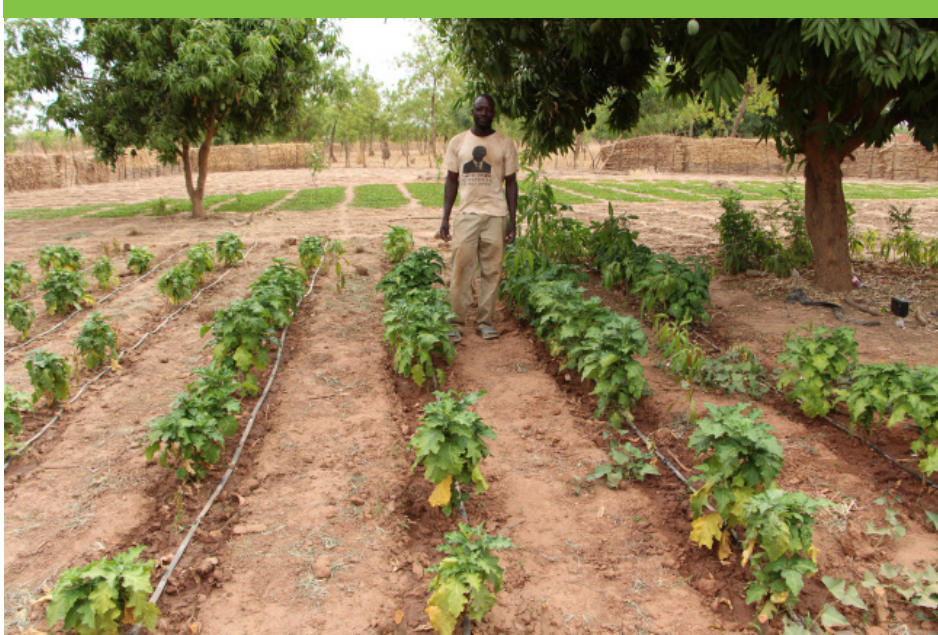
DRIP IRRIGATION FARMING IN KOUDOUGOU, CENTRAL BURKINA FASO.