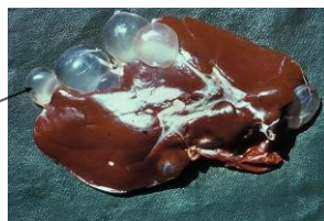
Cysts in the liver