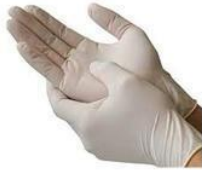
A pair of latex gloves