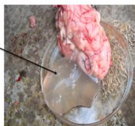
Cyst in the brain