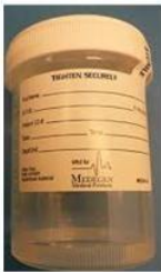
Sealable cap or screw cap