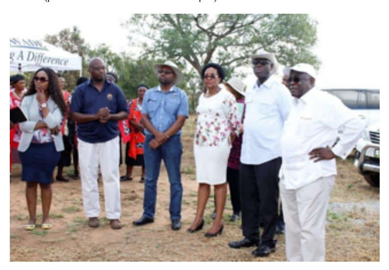
Picture 4: Kanayo F. Nwanze, president of IFAD visiting the SwaziBeef project sites in Siphofaneni, Swaziland in March 2017 accompanied by project officials

Viable cattle farming must start right at the beginning: choosing the correct breeds at a good price and thus determining the farmers' profit from cattle fattening. All the farmer groups selected for the project were trained on breed selection and encouraged to buy animals based on weight and age, and to negotiate price when possible. Initially, farmers purchased older animals which were being sold off cheaply. While they perceived this as a method of lowering costs, in the long run they lost money as the animals took a long time to adapt to the new feeding regime and the market offered very low prices when they tried to sell. During the second cycle farmers, responded to the training offered by the project and started to source mostly young animals. They were delighted with the almost immediate results: markets paid them premium prices for their animals.